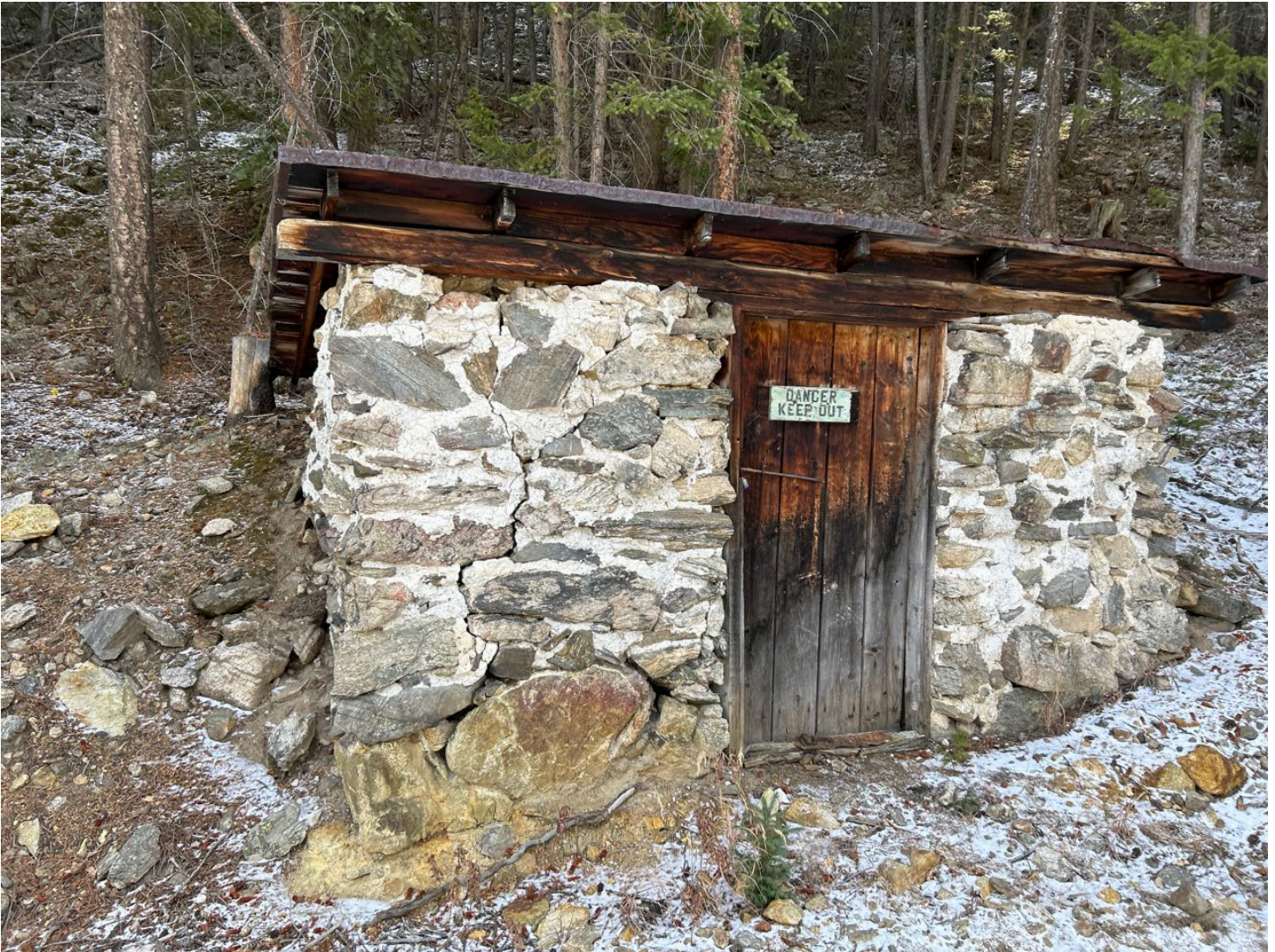
Figure 9: Historic stone building, outside of NOI permit area (410)