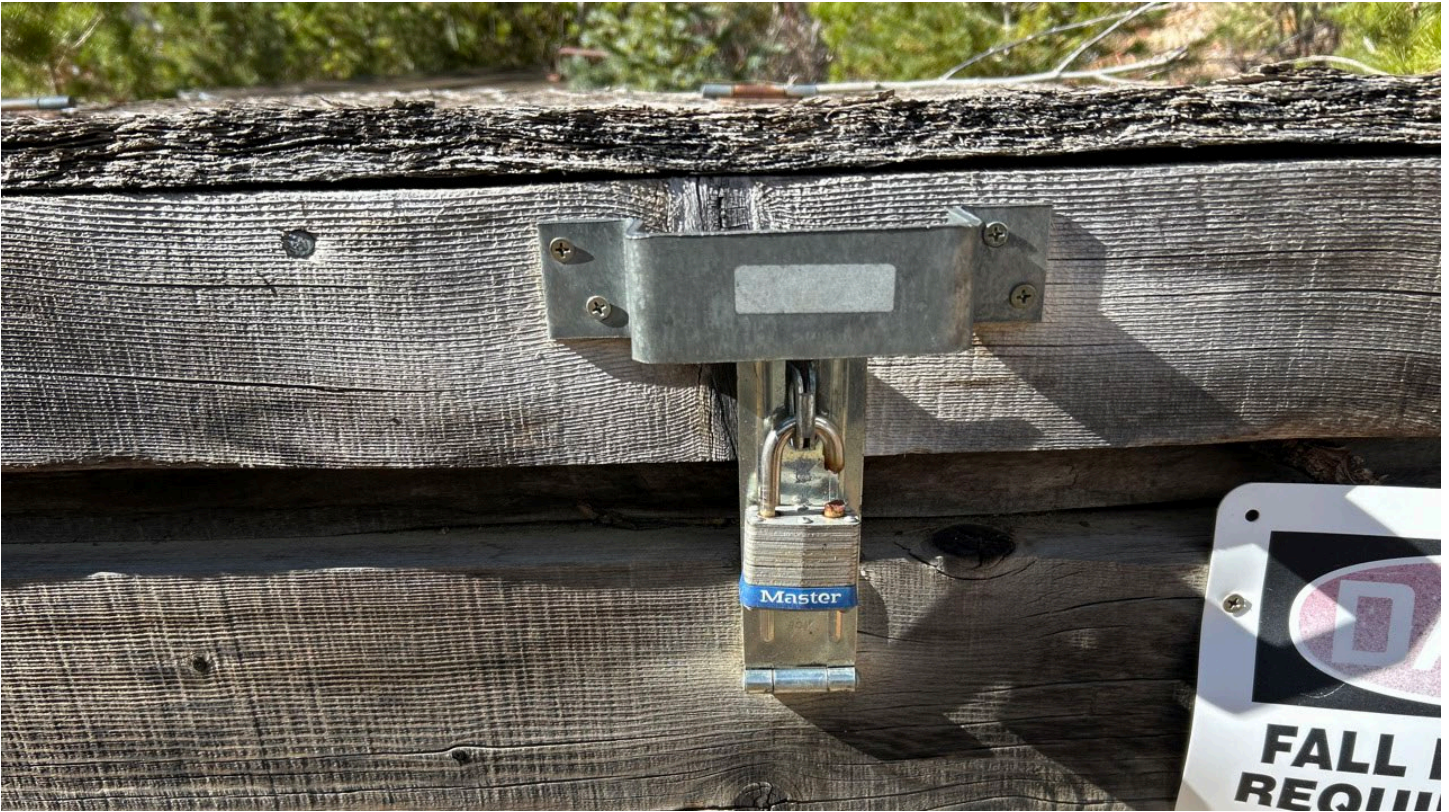
Figure 7: Vandalized lock on shaft cover (408)