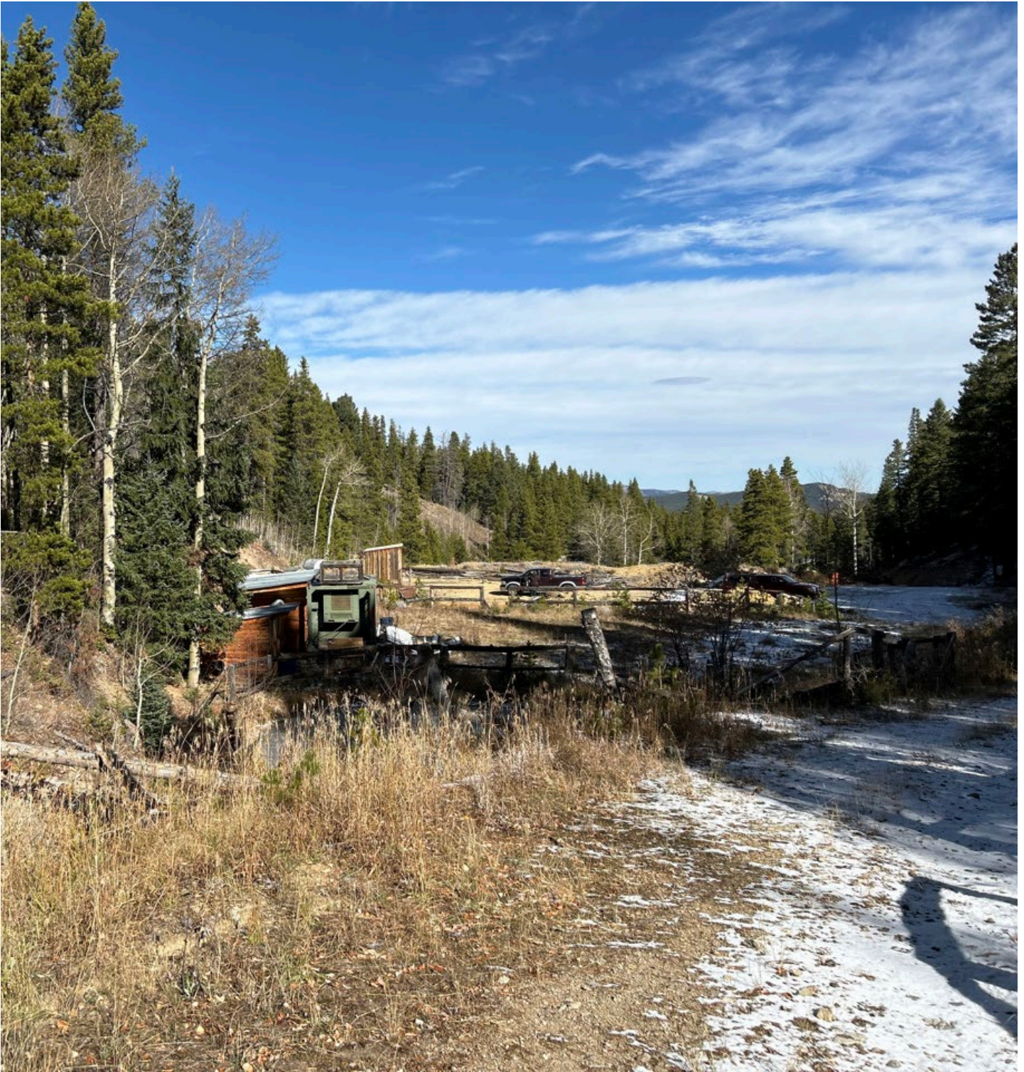
Figure 15: Overview of site from South (413)