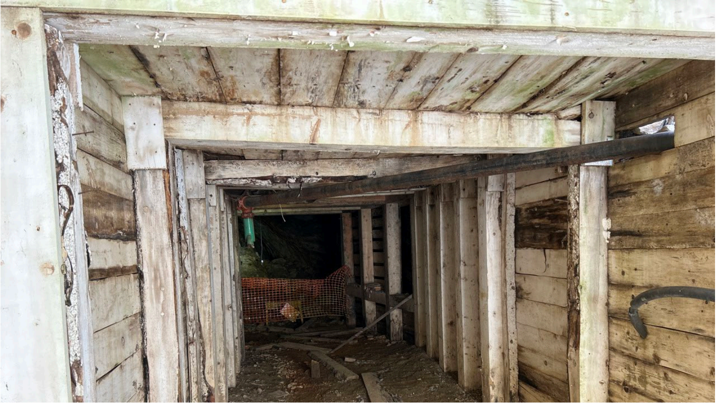
Figure 3: Portal (406)