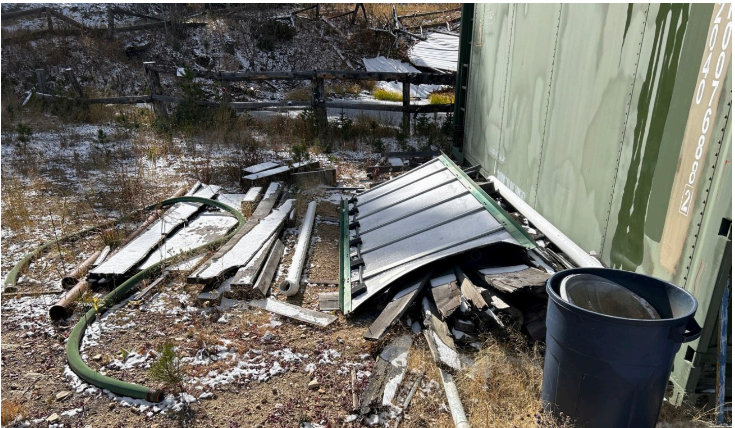
Figure 12: Trash outside office (411)