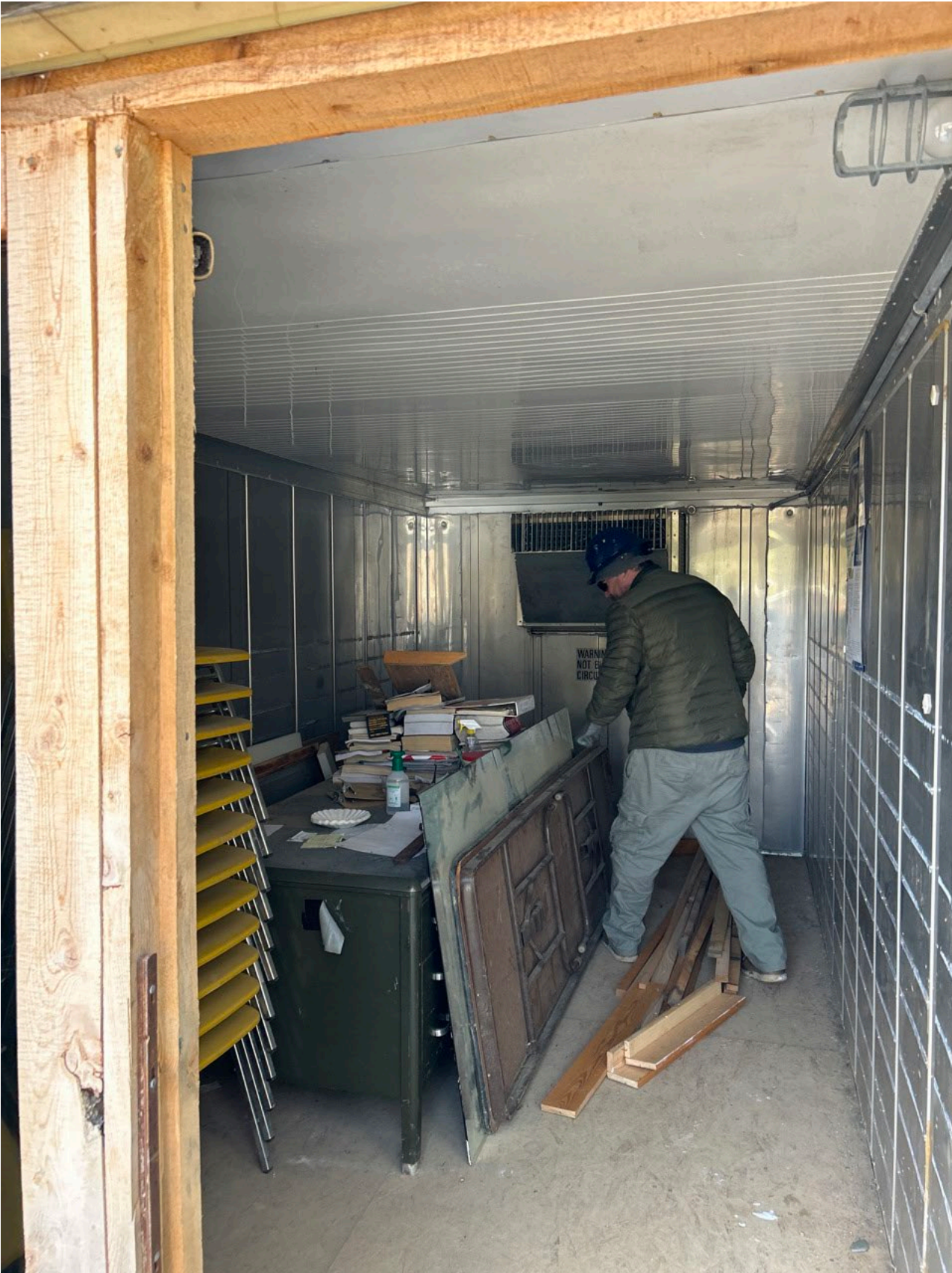
Figure 10: Office, secure (411)