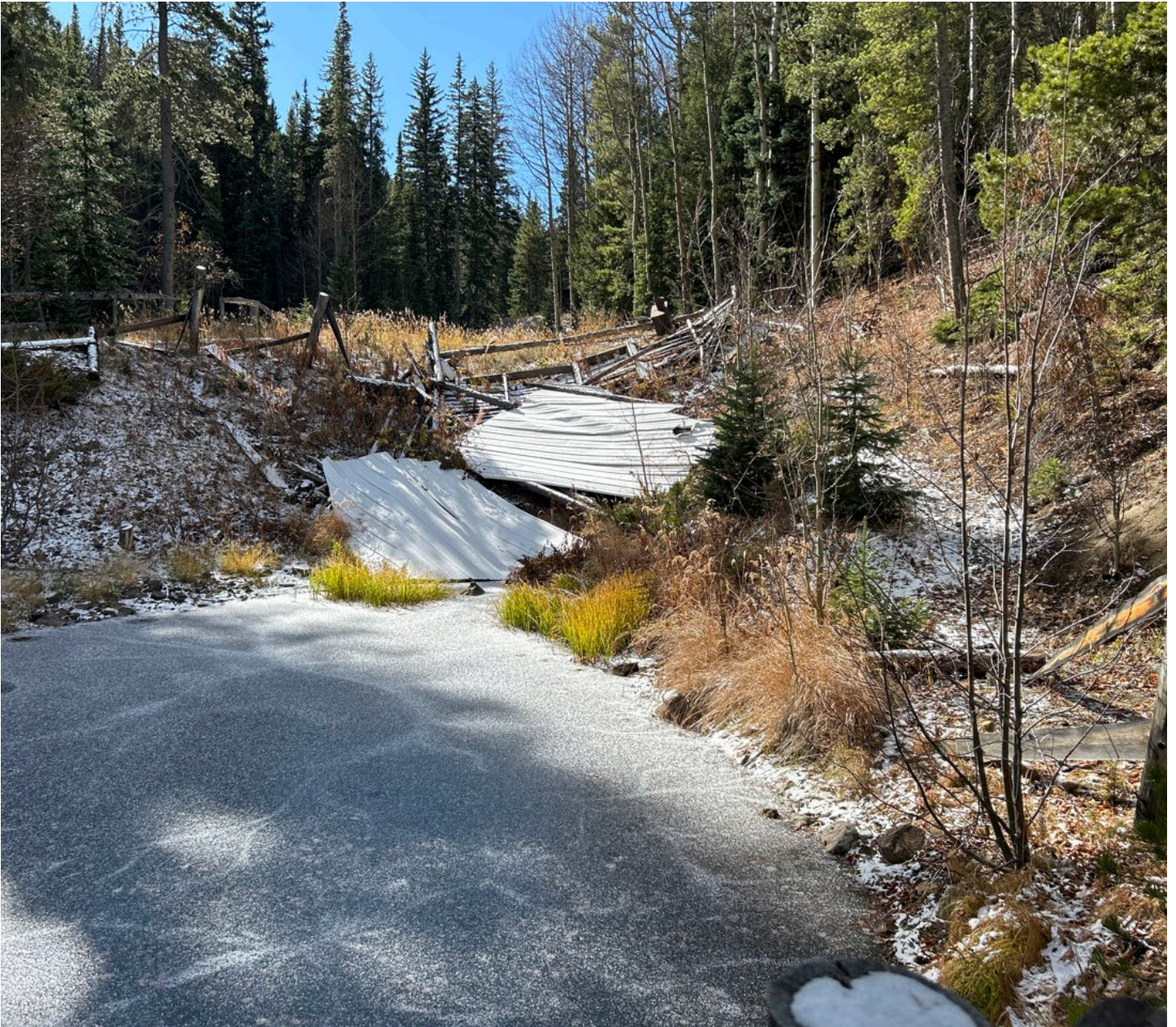
Figure 14: Pond, with collapsed building material outside NOI permit area (412)