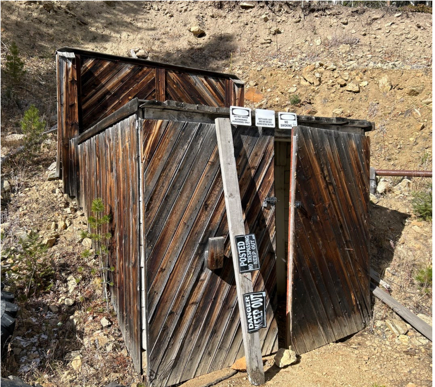
Figure 2: Portal structure needs repair to secure the opening (406)