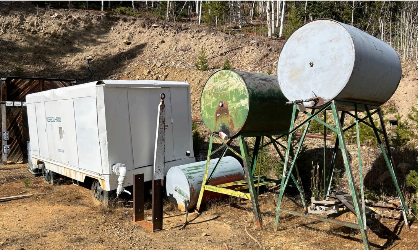
Figure 5: Air compressor trailer and empty fuel tanks (407)