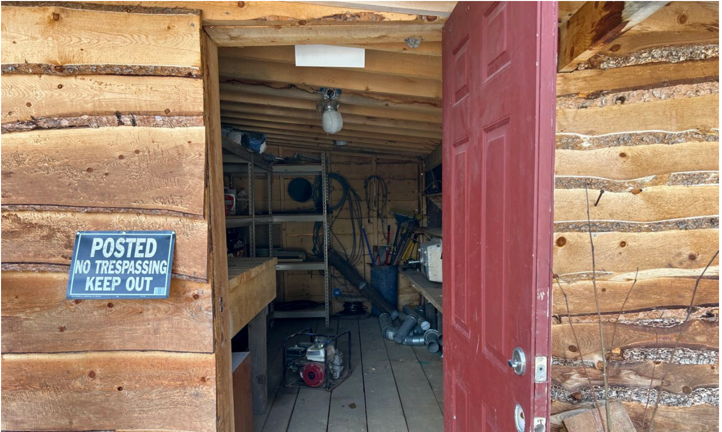
Figure 11: Parts room (411)