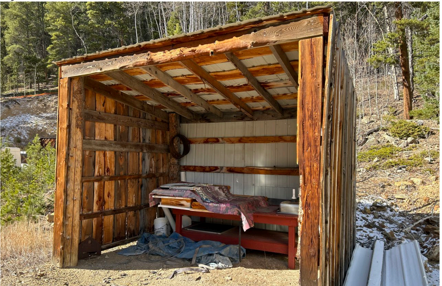
Figure 8: Sawmill area (409)