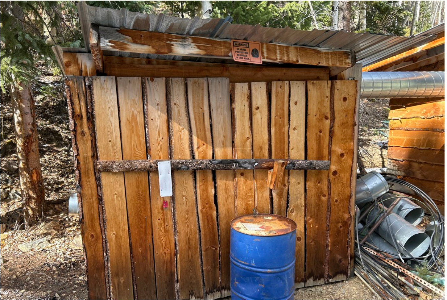
Figure 13: Generator shed (empty), with empty drum and other trash (412).