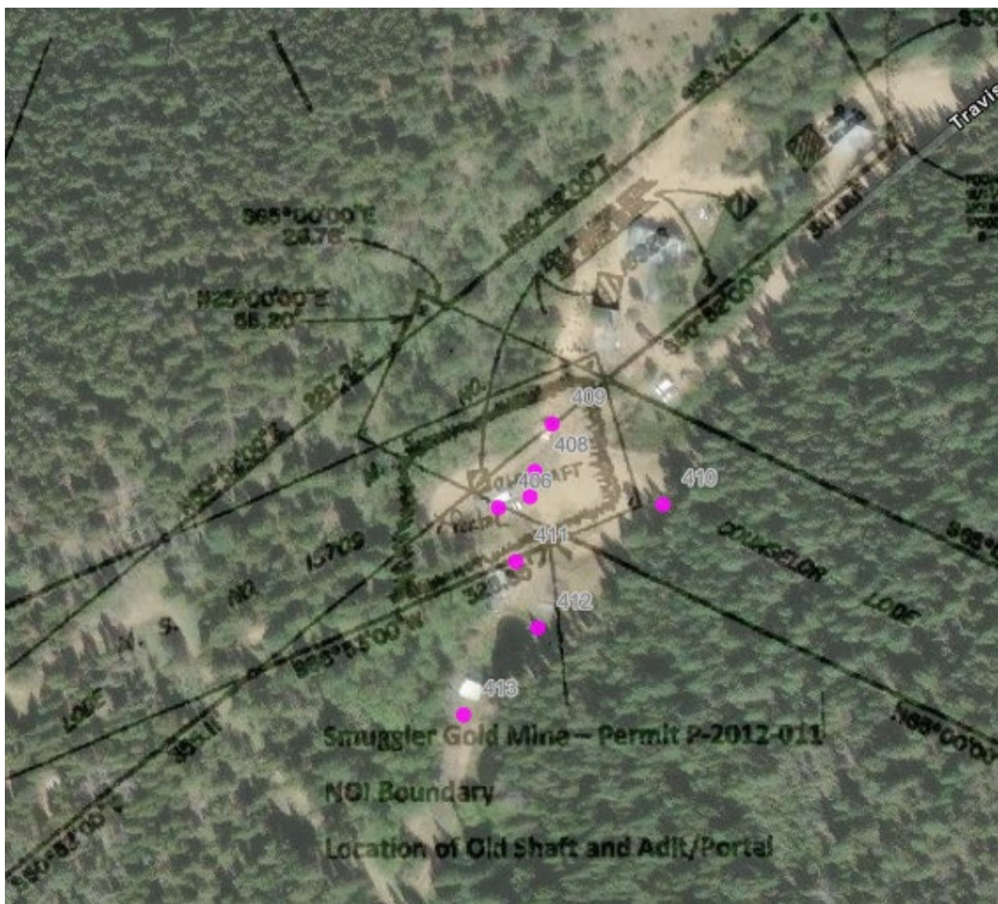
Figure 1: Screenshot of map used during inspection, with photo locations in pink