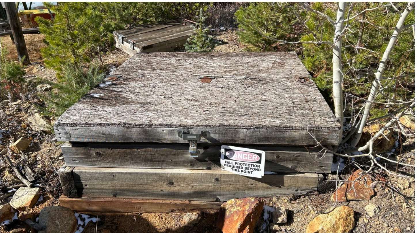
Figure 6: Hatch cover to shaft opening (408)