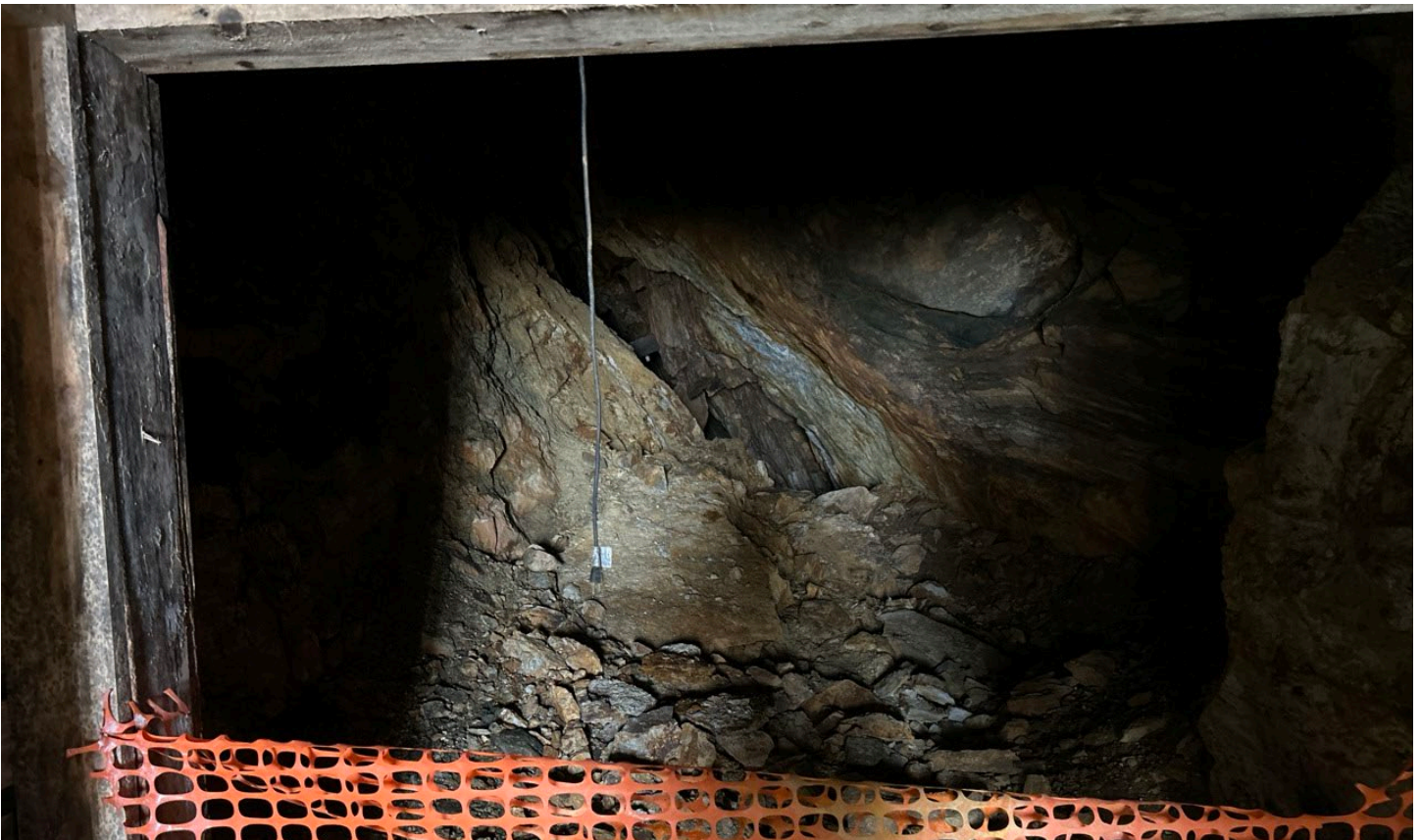
Figure 4: Rockfall inside portal