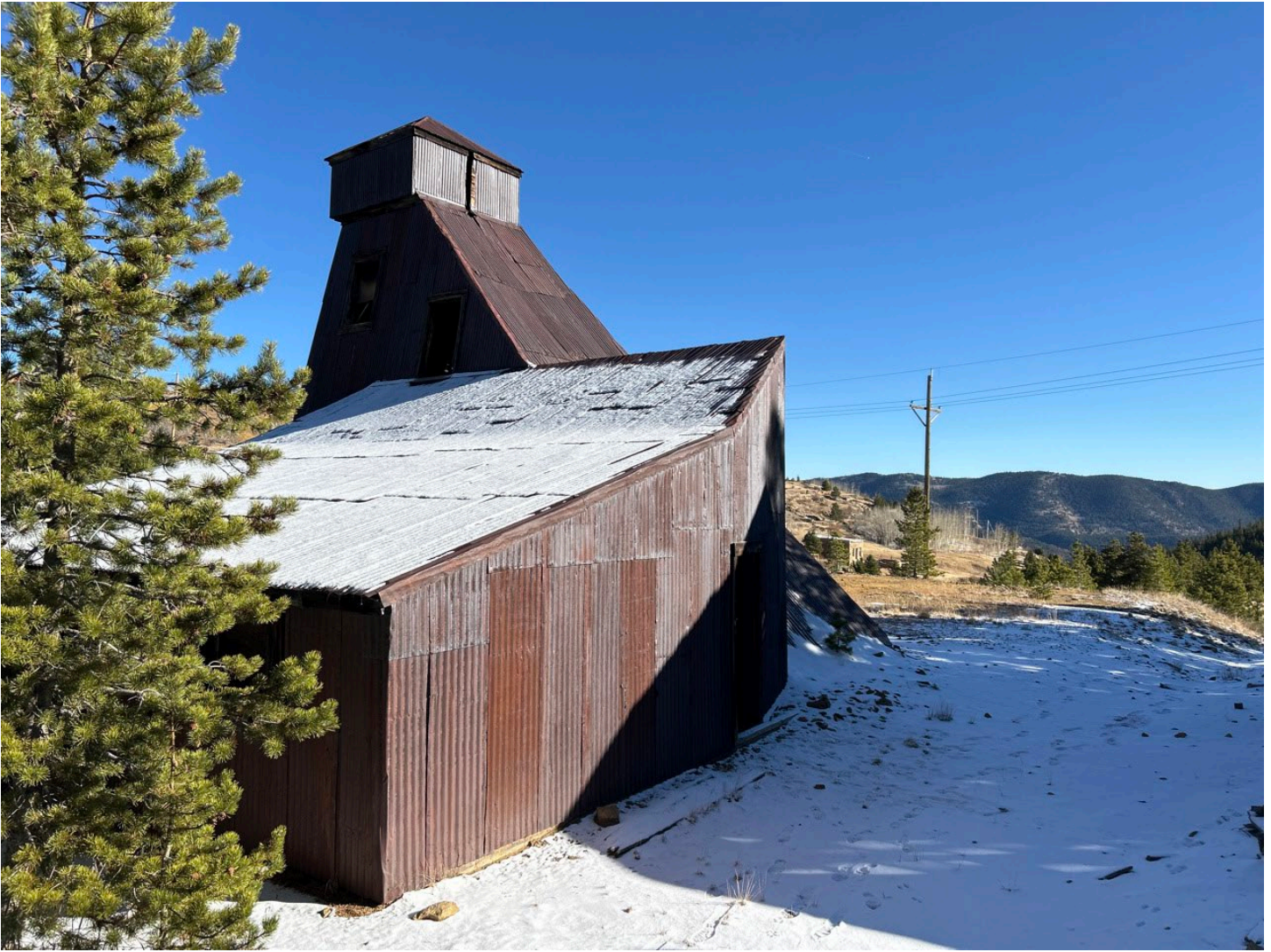
Figure 7: More pre-law mining disturbance (405)