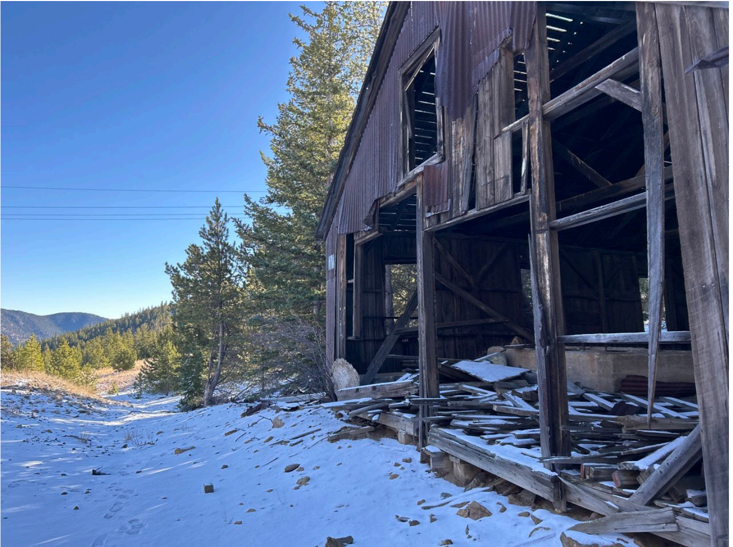
Figure 6: Pre-law mining disturbance (405)