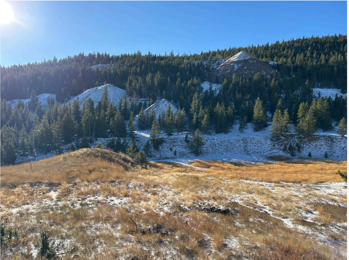
Figure 3: Overview of site to S (403)