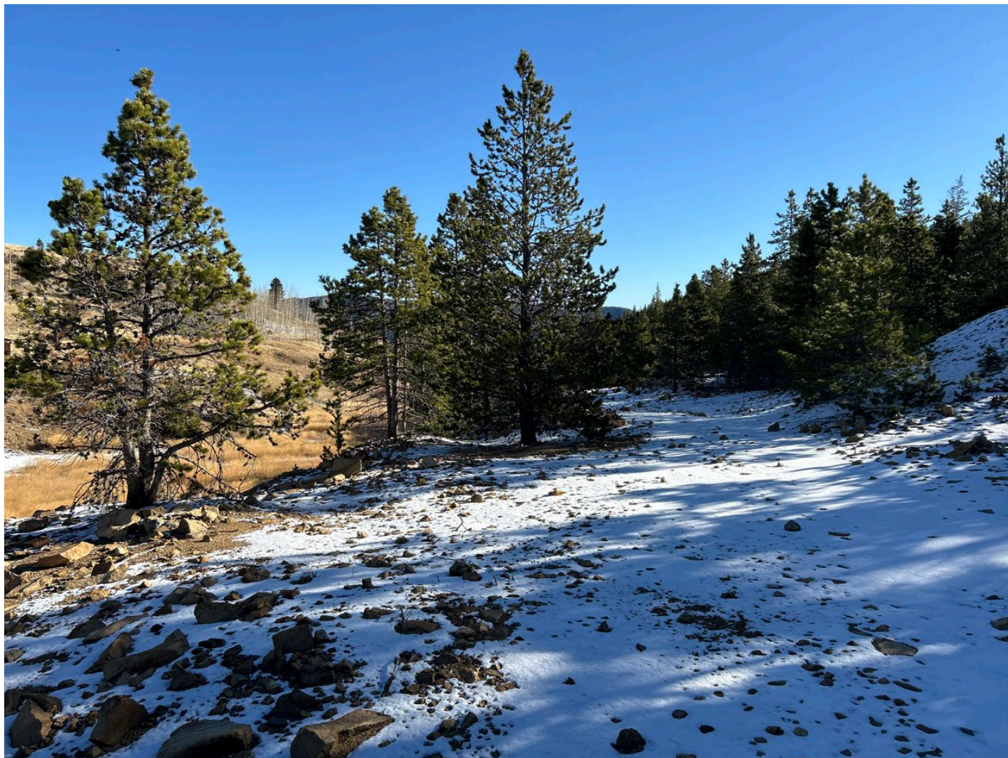
Figure 5: Reclaimed land (404)