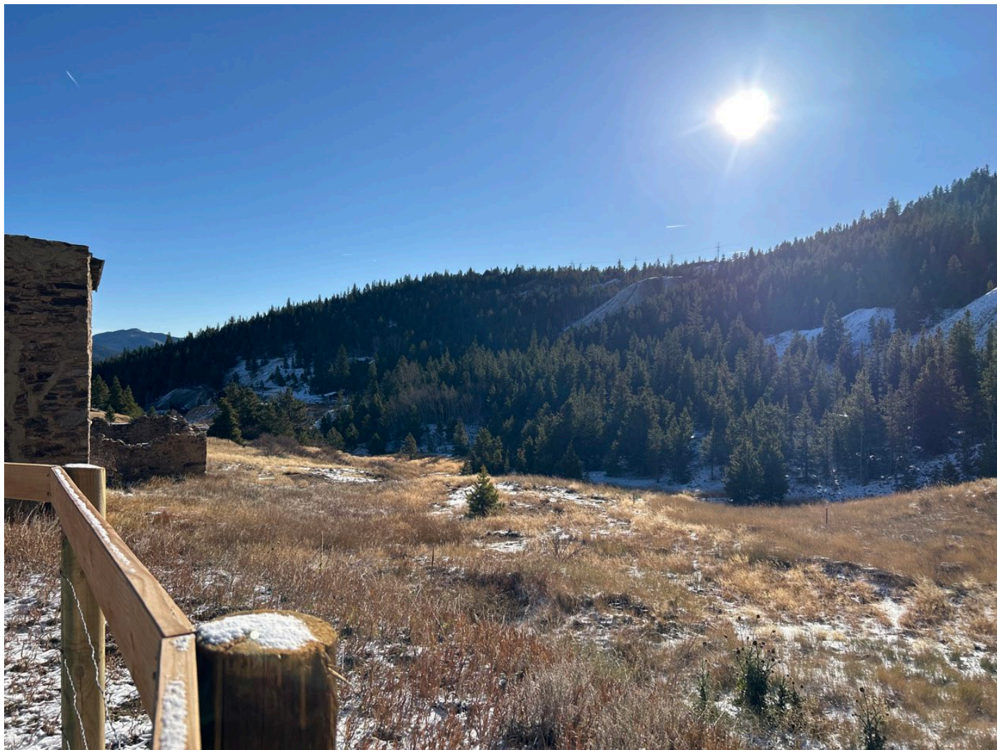
Figure 2: Overview of site to SE (403)