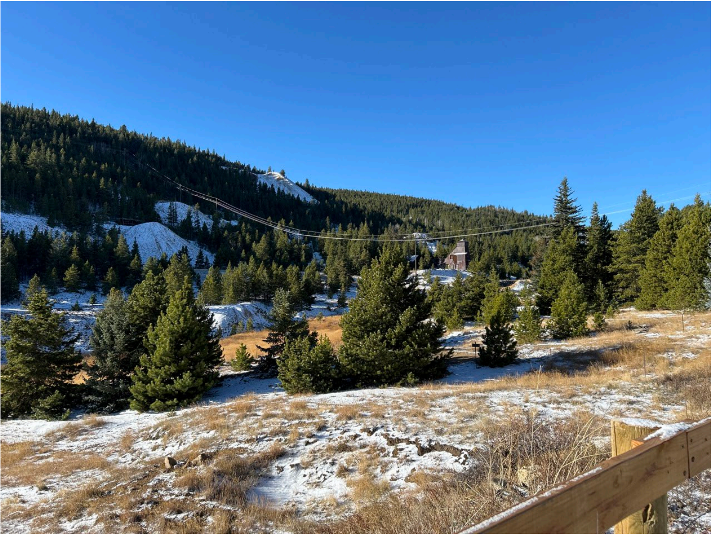
Figure 4: Overview of site to SW (403)