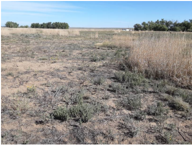
Evidence of selective mowing to preserve desirable vegetation during seed development and dispersal (photo 10).