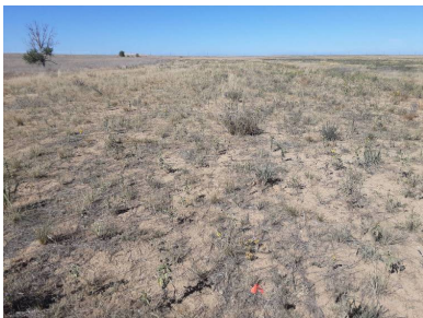
Photo point. Native vegetation is present in 2022 reclaimed areas mixed with minor cheatgrass infestations. Continue to monitor spring 2025 and add to mowing schedule if necessary (photo 9).

Signs of summer mowing within selective areas only (photo 8).