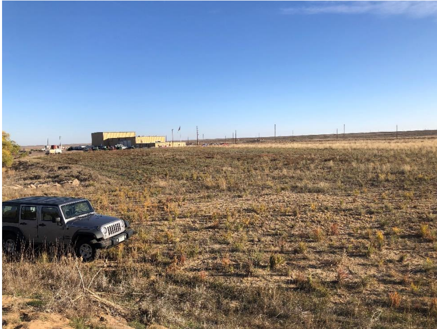
Area 38 and southeast corner of the Dugout Pond