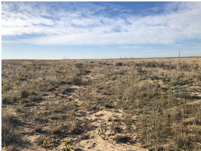
West side of site, looking south at Area 44