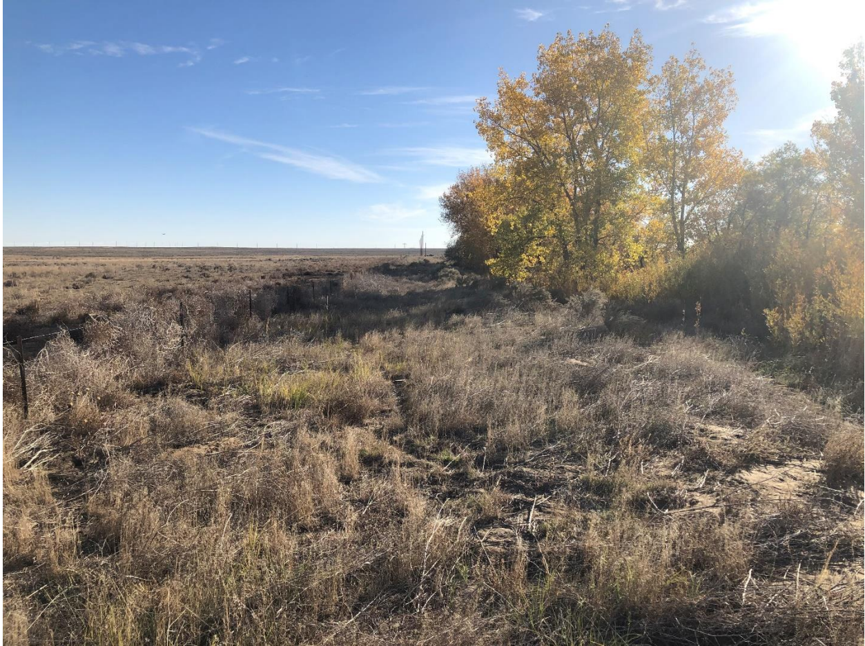
Sediment Pond 2 embankment

Number of Partial Inspection this Fiscal Year: 3