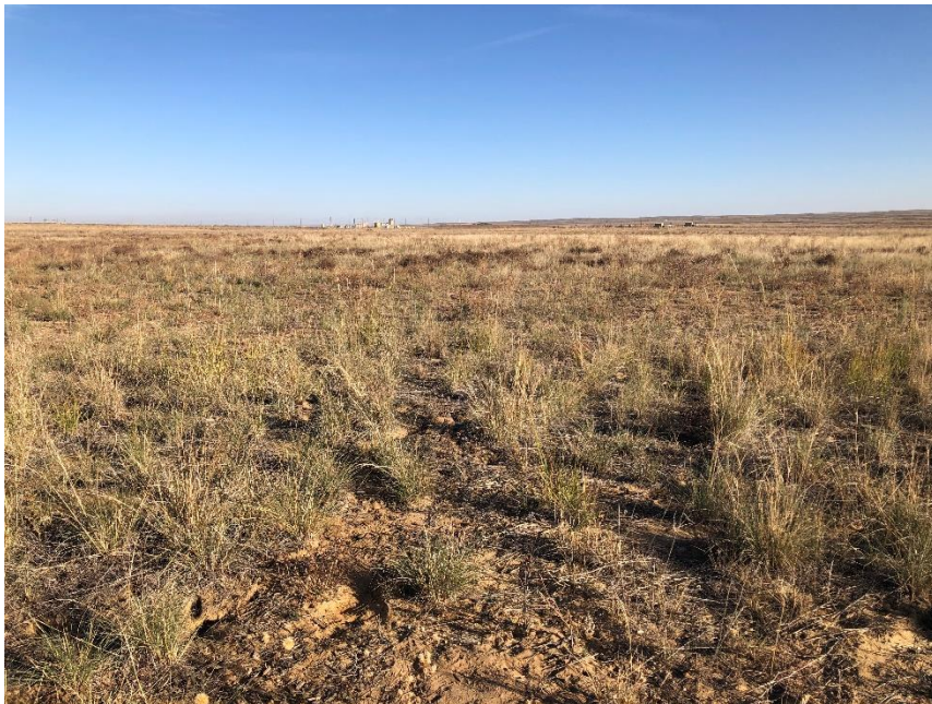
Area 36, west side

Number of Partial Inspection this Fiscal Year: 3