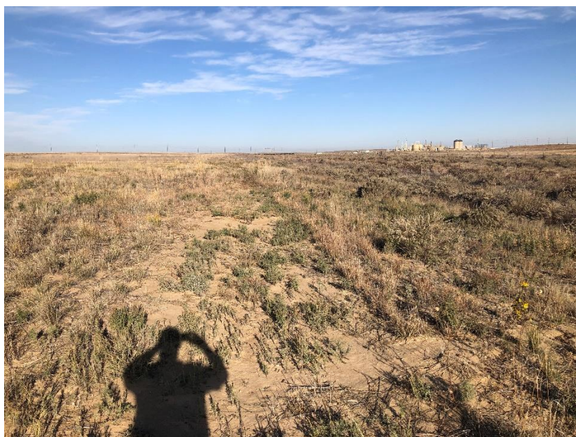
North side of site, looking northeast from Area 37

Number of Partial Inspection this Fiscal Year: 3