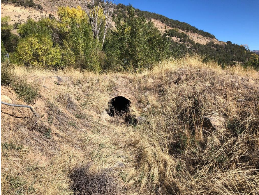
36" culvert at loadout (upstream side)