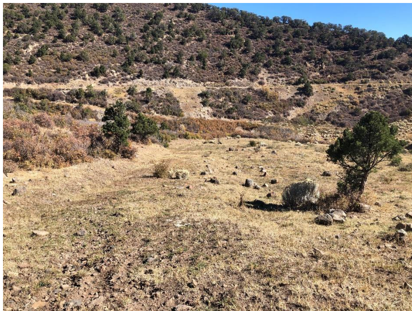
West Mine road, looking toward creek