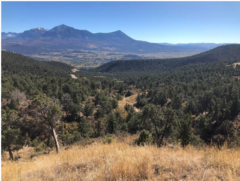
East Mine, looking down drainage at reclaimed Ponds 3 and 4

Number of Partial Inspection this Fiscal Year: 3