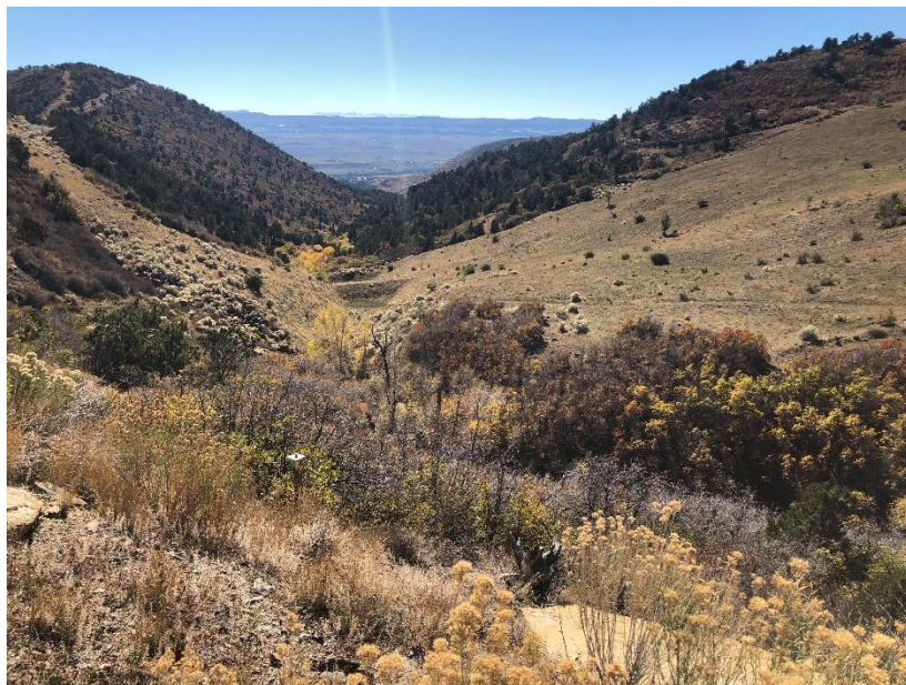
West Mine ponds

Number of Partial Inspection this Fiscal Year: 3