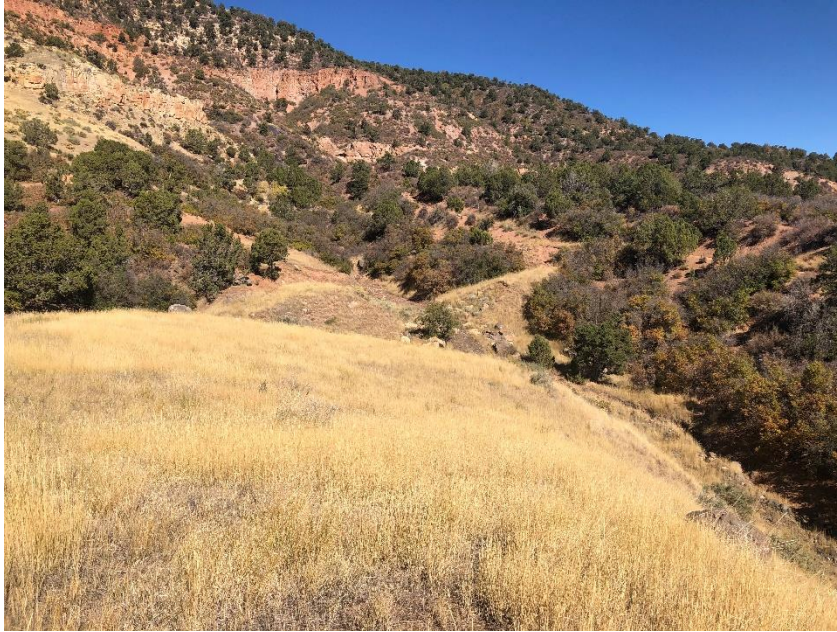
East Mine, looking up drainage at reclaimed Pond 1