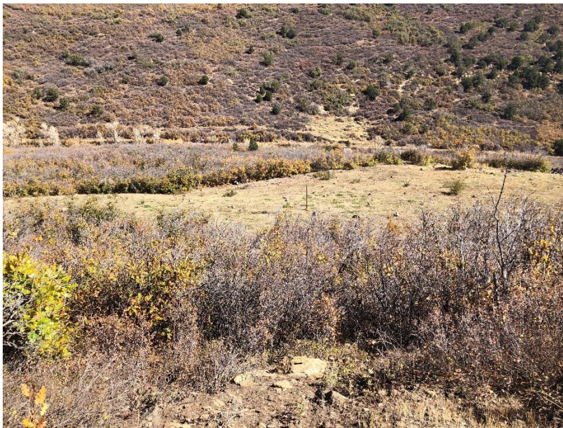
West Mine fan area

Number of Partial Inspection this Fiscal Year: 3