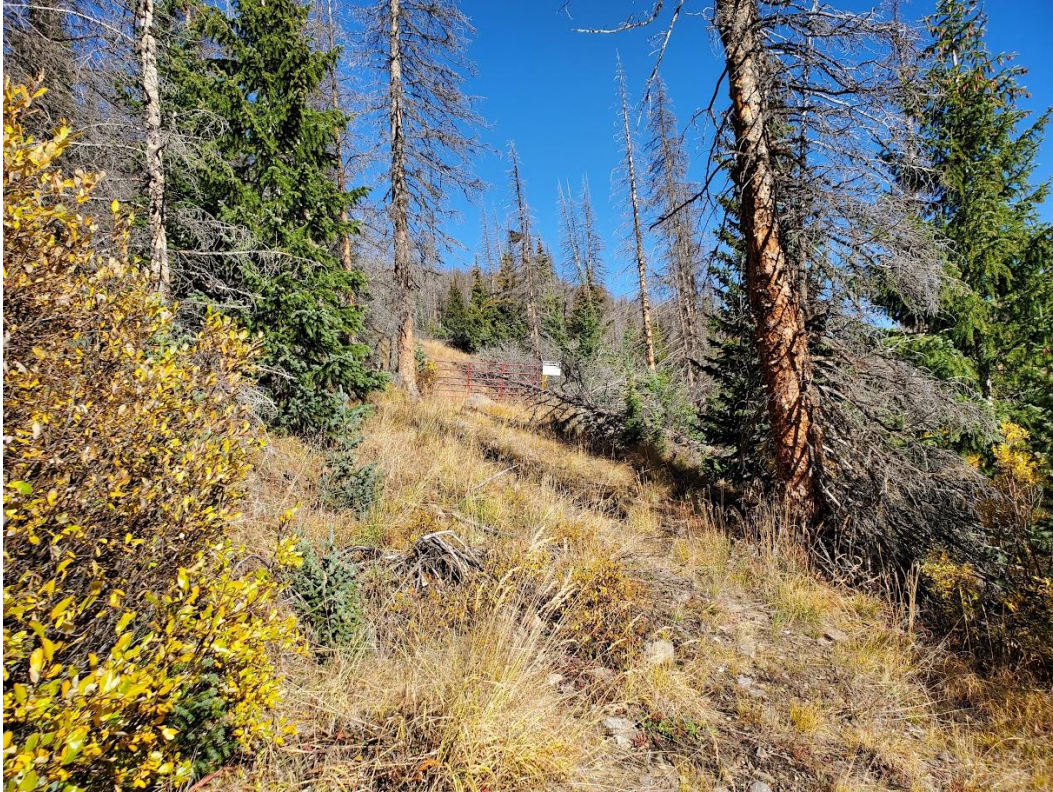
Photo 1: View to the north of culvert that conveys West Willow Creek under the access road.