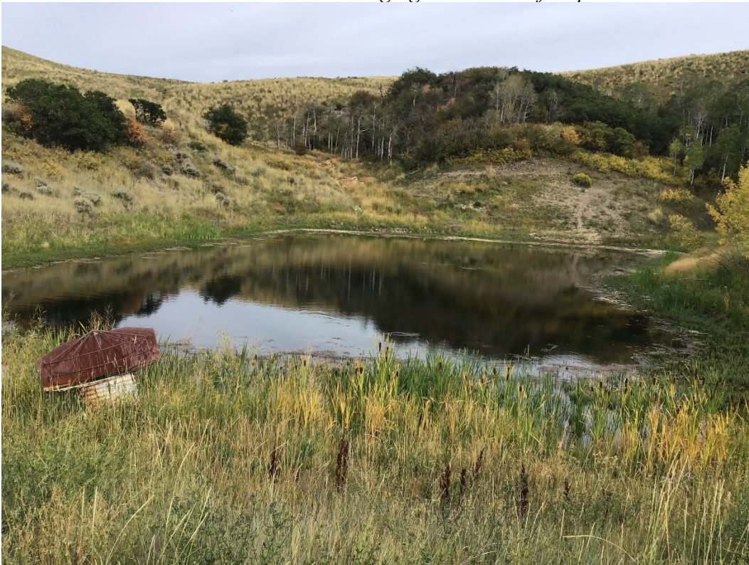
Photo 4: Pond 14 with its flume practically grounded due to low water.

Number of Partial Inspection this Fiscal Year: 2