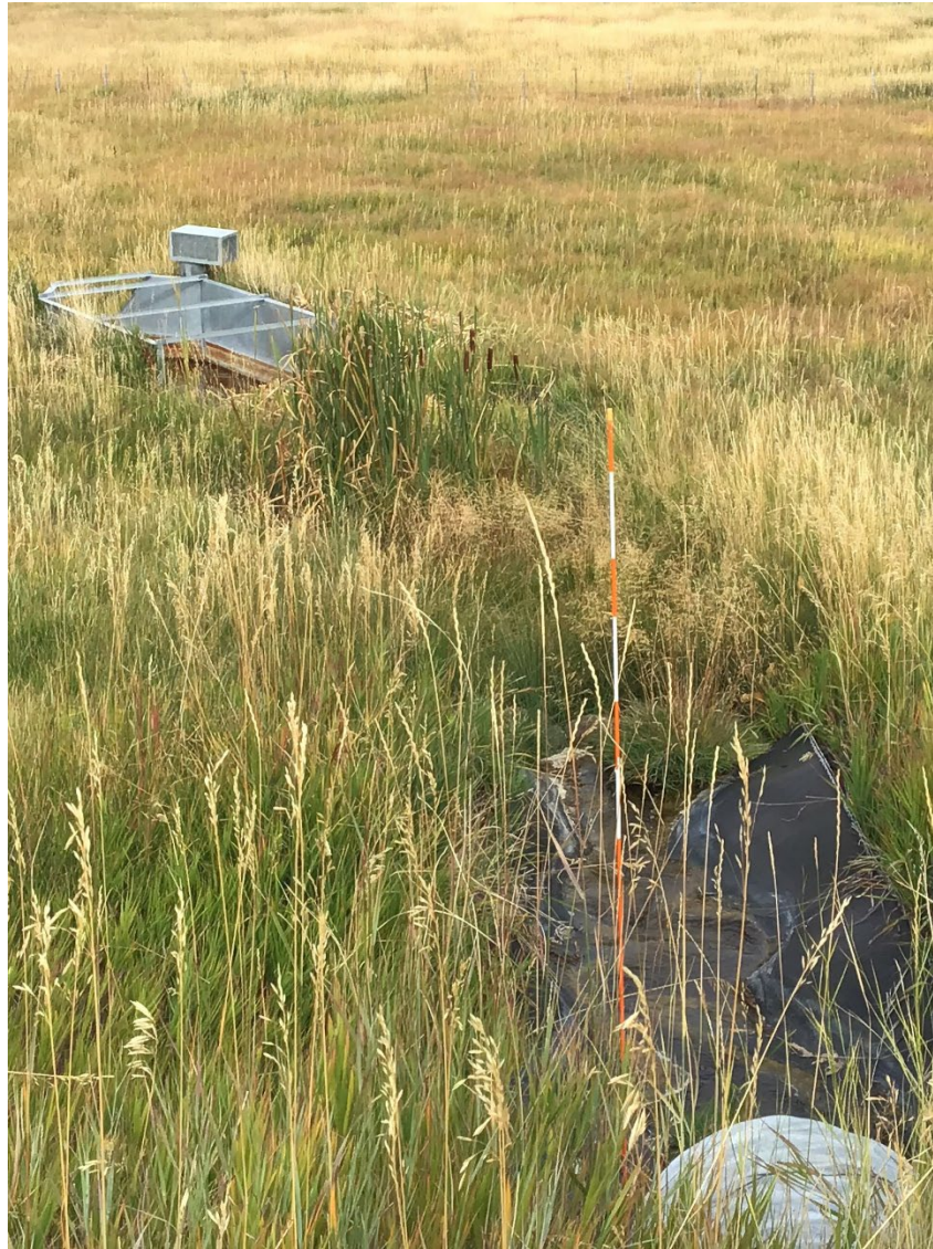
Photo 5: Pond 10 discharge culvert and flume cleared of vegetation.

Number of Partial Inspection this Fiscal Year: 2