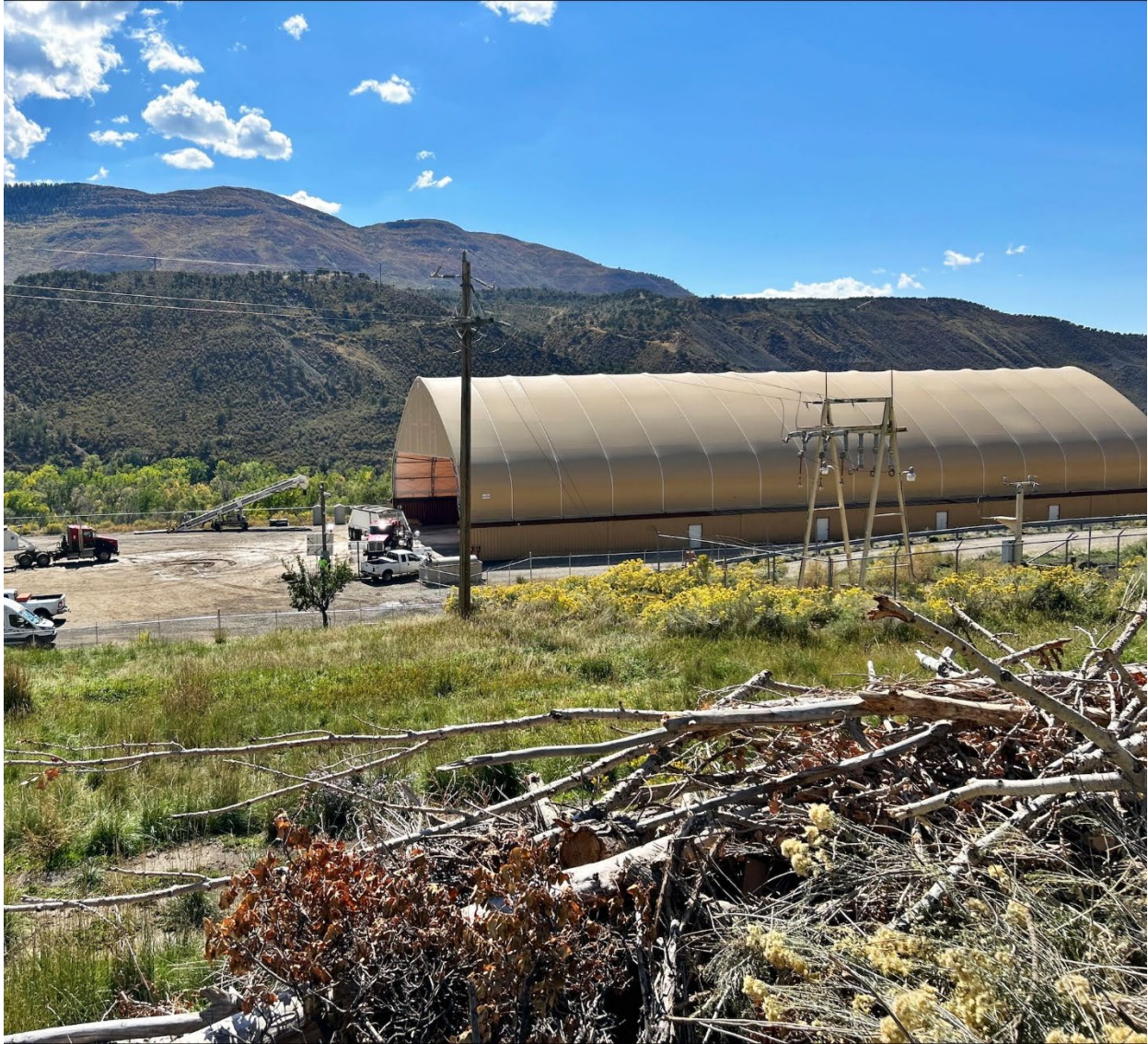
Figure 2: Lower pad, west side

Number of Partial Inspection this Fiscal Year: 2