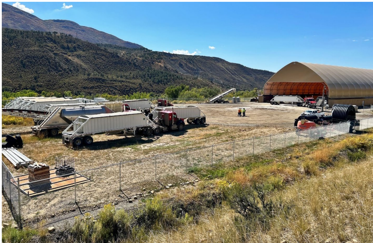
Figure 3: Gunnison Energy haul trucks and equipment