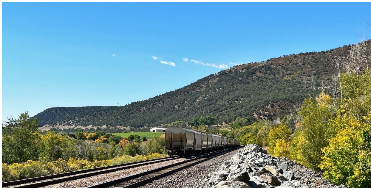
Figure 5: Rail cars on Bowie siding