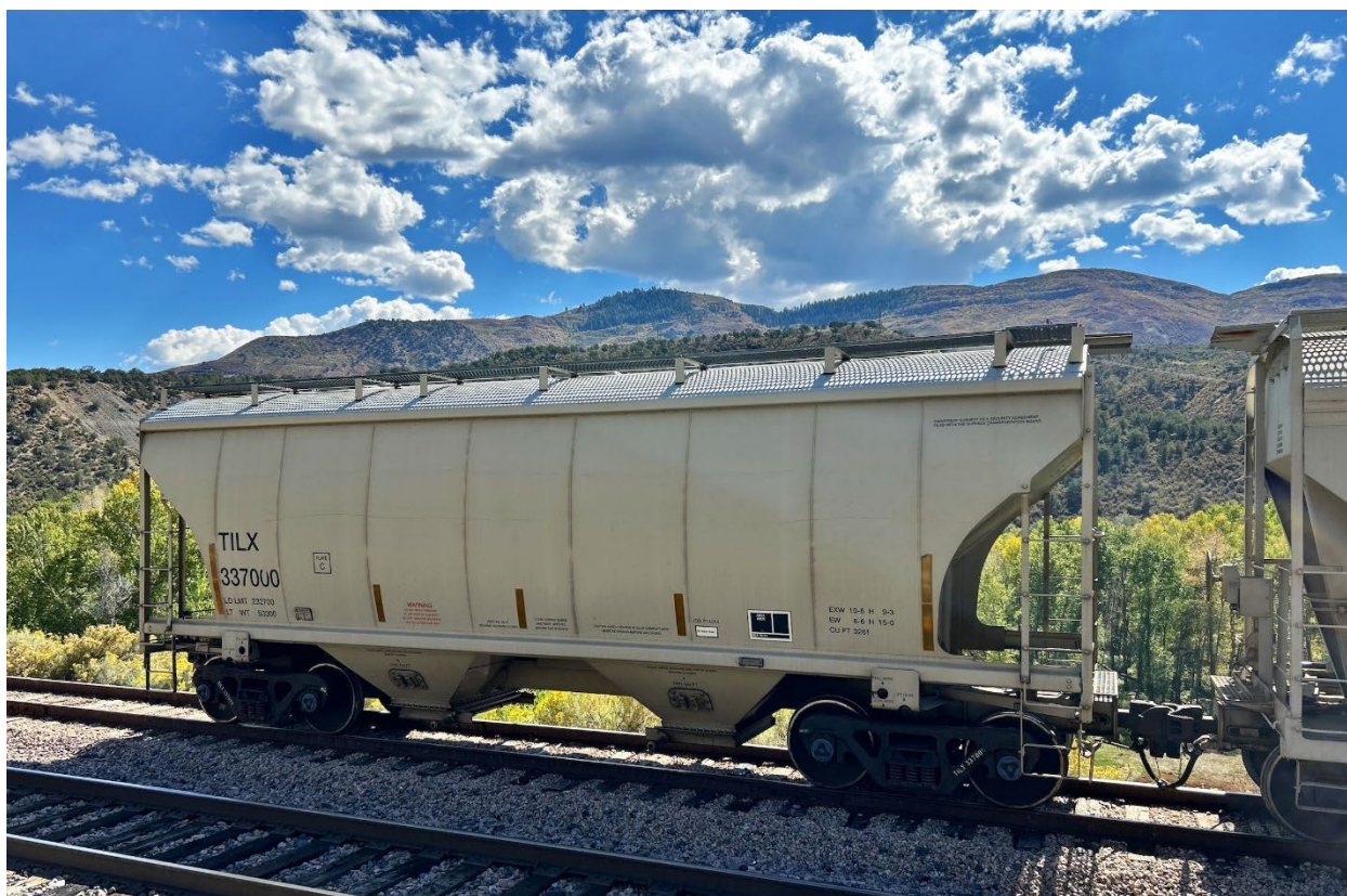
Figure 6: Rail car with frac sand

Number of Partial Inspection this Fiscal Year: 2