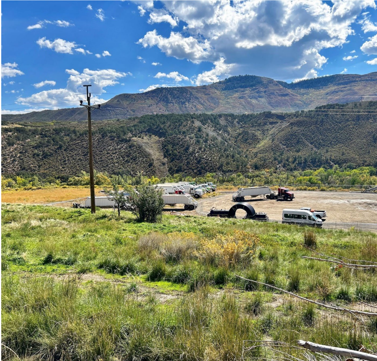
Figure 1: Lower pad, east side

No enforcement actions were initiated as a result of this inspection, nor are any pending.