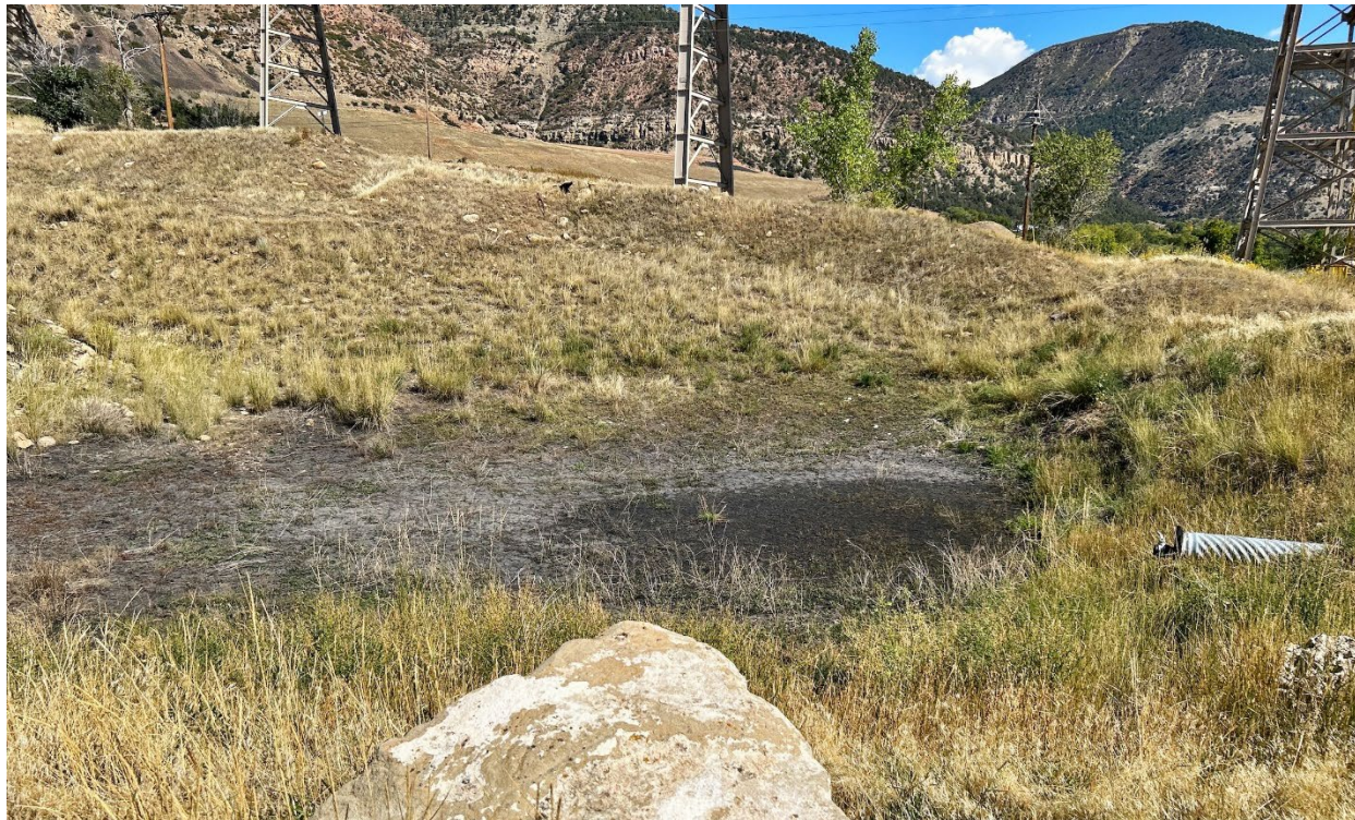
Figure 4: Sediment pond

Number of Partial Inspection this Fiscal Year: 2