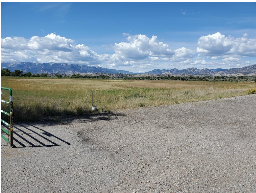
Photo 2: View to the northwest of undisturbed portions of the permit.