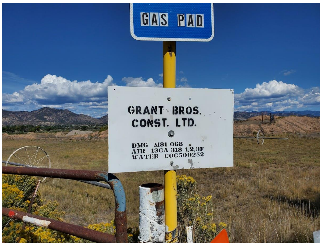
Photo 4: View to the north proper Mine ID at the entrance to the site.