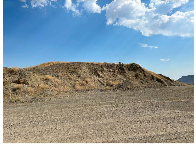
Photo : Seeded and stable topsoil pile.