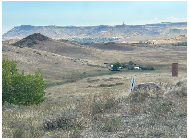
Photo 2: Pond located outside permit boundary, which flows into Van Bibber Creek.