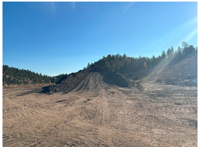
Photo 6: Representative stockpile, located in the northern portion of the permit.