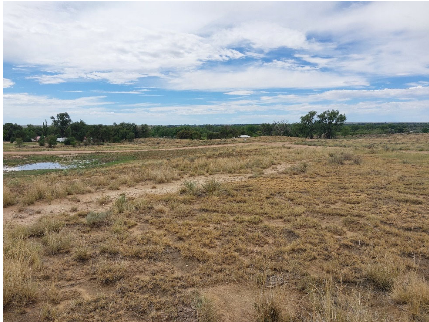
Photo #4: View from the lower west permit boundary area looking southeast at the land owned by Quarter Circle LT, Inc north of County Lane 13 that is proposed to be released.