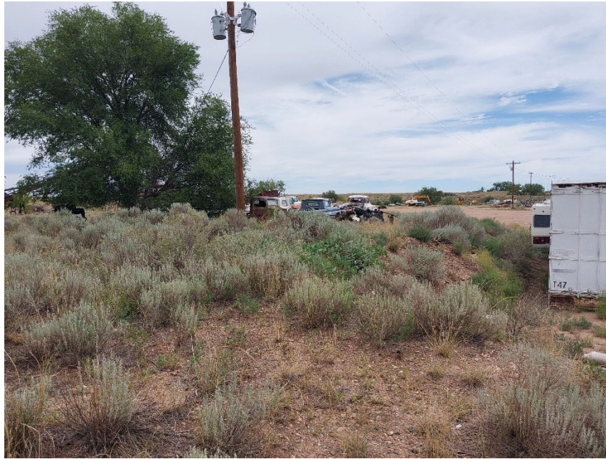
Photo #13: View of lands located on Mr. Gerald and Norma Korinek's property, looking to the northeast from the west portion of the permit boundary. Equipment that can be associated with mining can be seen in the photo.