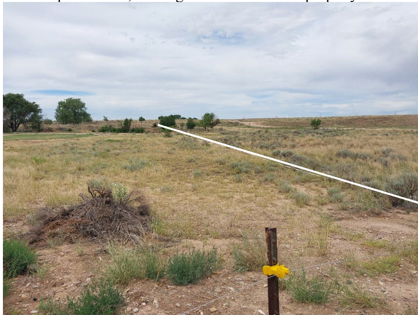
Photo #12: View of the lands located on Mr. Gerald and Norma Korinek's property in the southwest corner of the permit area, looking west from the east property line. County Lane 13 can be seen on the right side of the photo, the area to the left of the white line is proposed for release.