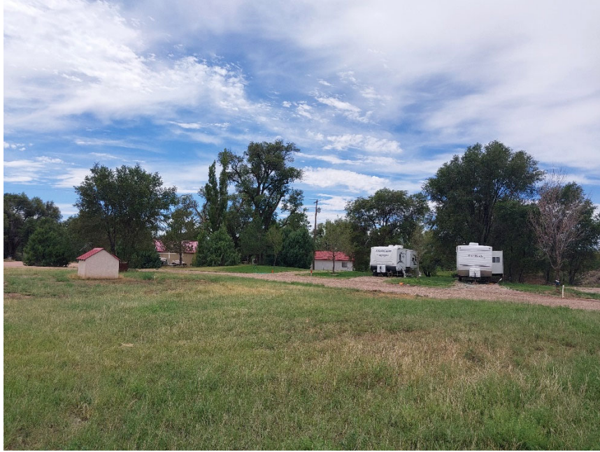
Photo #9: View of the lands located on Mr. Gerald and Norma Korinek's property in the southwest corner of the permit area, looking south.