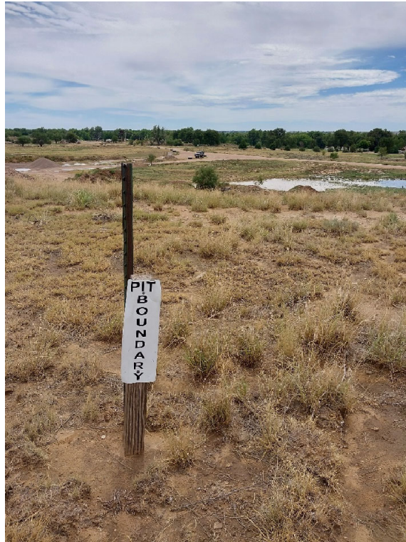
Photo #3: Permit boundary marker located along County Lane 15 on the west section of the permit boundary, looking east southeast. Active pit area can be seen in the background with several pools of standing water from recent storm events.