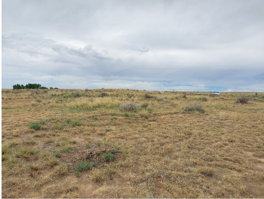
Photo #7: View of the lands located on Quarter Circle LT, Inc property in the southwest corner of the permit area, looking northwest.