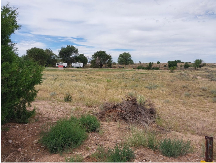
Photo #11: View of the lands located on Mr. Gerald and Norma Korinek's property in the southwest corner of the permit area, looking west from the east property line.