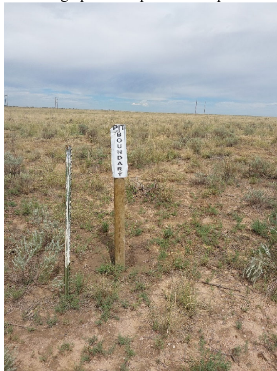
Photo #2: Permit boundary marker located in the northwest corner of the permit area, looking northwest.