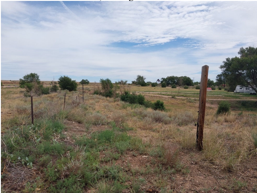
Photo #8: View of the lands located on Mr. Gerald and Norma Korinek's property in the southwest corner of the permit area, looking east.