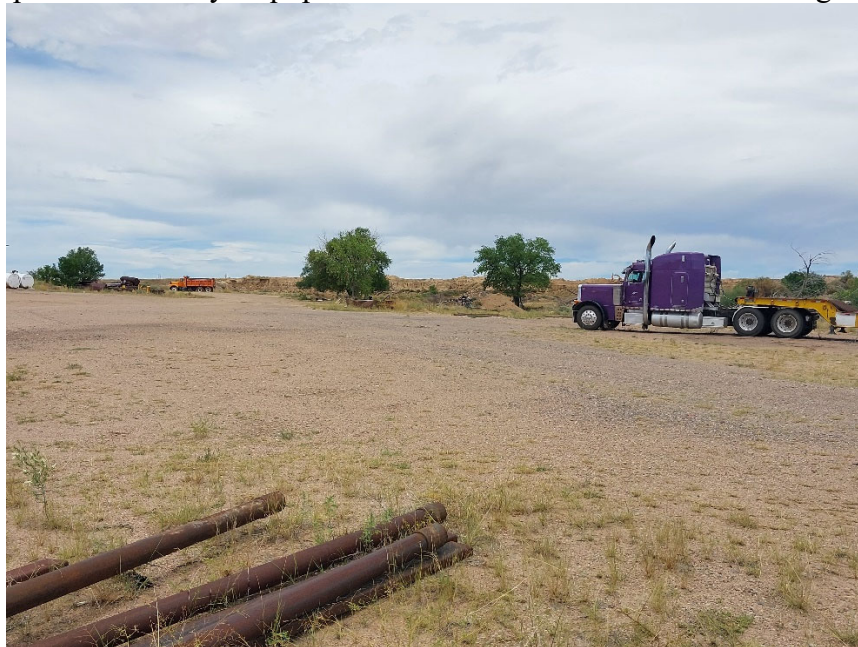
Photo #14: View of lands located on Mr. Gerald and Norma Korinek's property, looking north from the southeastern portion of the permit area. Materials and equipment that can be associated with mining can be seen in the photo.