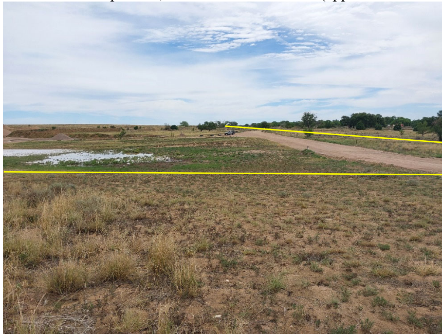
Photo #6: View from lower west portion of the permit area looking east at portions of land that are proposed for release. The yellow lines represent to approximate locations of the new permit boundary; land below the bottom line (owned by Quarte Circle LT, Inc) and above the top line (owned by Mr. Gerald and Norma Korinek) are proposed for release.