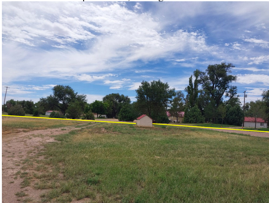
Photo #10: View of the lands located on Mr. Gerald and Norma Korinek's property in the southwest corner of the permit area, looking southeast. Lands below the yellow line are proposed for release.