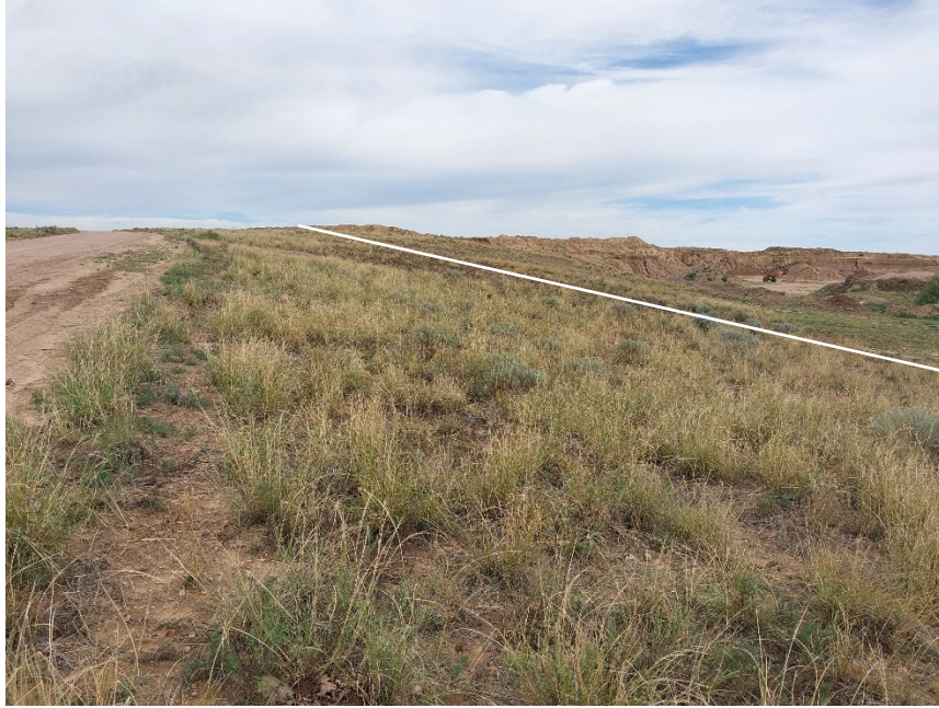
Photo #5: View of the permit area from the lower west portion of the permit boundary along County Lane 15 (seen on the left side) looking northeast at the section of land owned by Quarter Circle LT, Inc proposed for release located west of the active pit area, between the white line (approximate location) and the road.