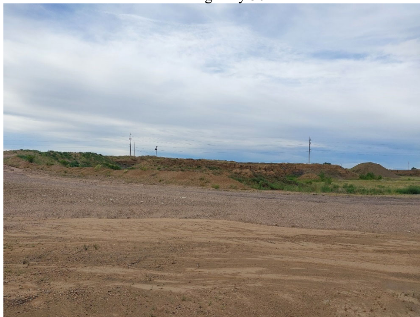
Photo #2: View of the current operation area in Phase 1, looking south. The highwall can be seen in the far background with stockpiles in front.