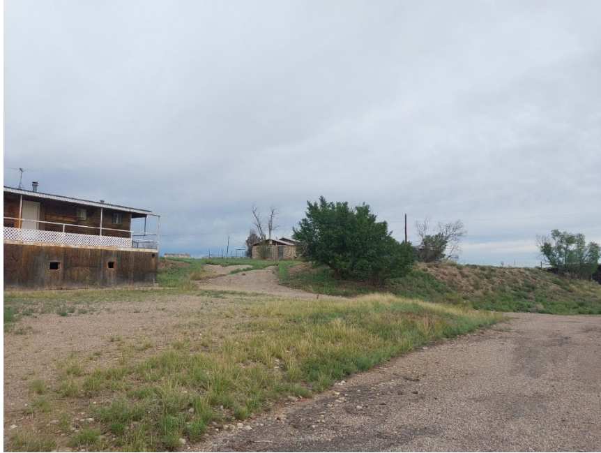
Photo #9: View of structures located in Phases 2 and 3 that will be demolished as operations progress through Phase 2.