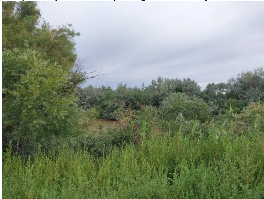
Photo #14: View of the portion of the Arkansas River that is within the permit area. There are no boundary markers in this area due to inaccessibility. Looking north.