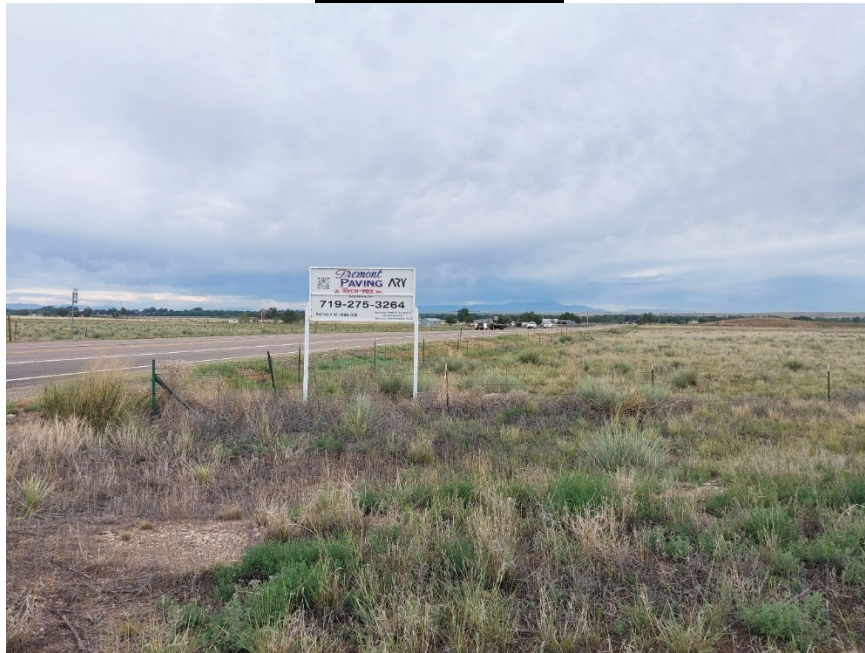
Photo #1: Mine sign in accordance with Rule 3.1.12(2), at the entrance of the mine, located on the north side of U.S. Highway 50.