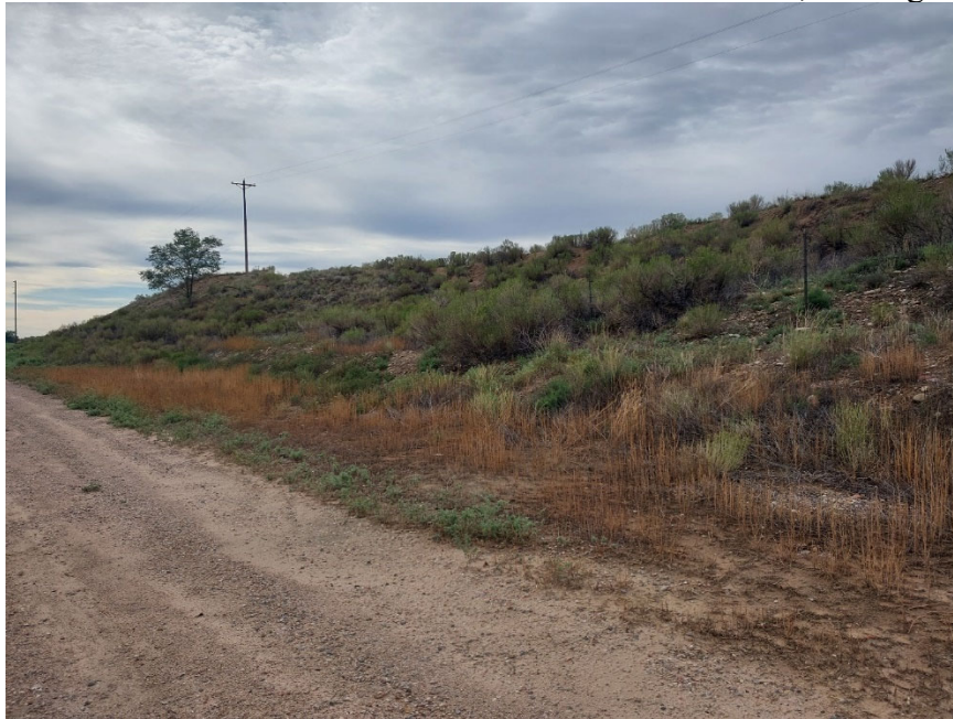
Photo #4: View of internal road that runs east-west along the base of the terrace, looking southeast.