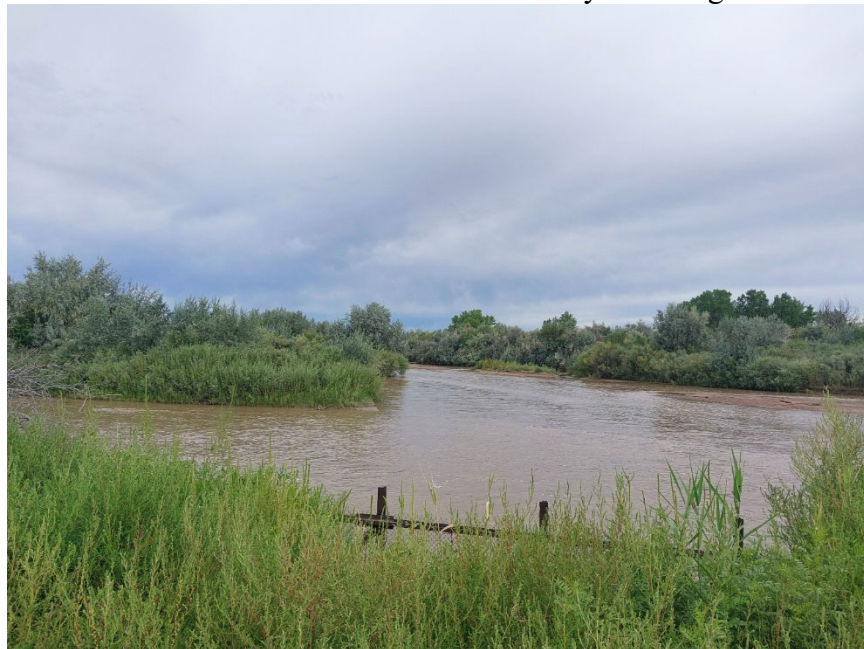
Photo #16: View of the portion of the Arkansas River that is within the permit area. There are no boundary markers in this area due to inaccessibility. Looking upstream.