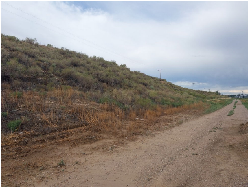
Photo #5: View of the internal road that runs east-west along the base of the terrace, looking to the west.