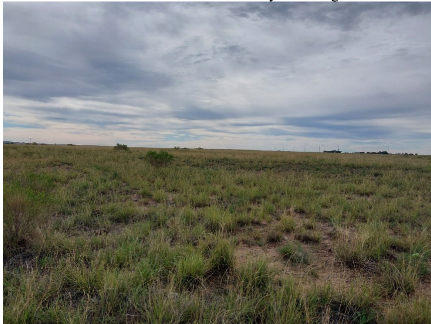
Photo #18: Area of Phase 1 that was reclaimed by previous operator. Looking to the southeast.