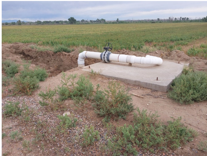
Photo #10: Irrigation system access point located on the lower portion of the permit area, looking to the northwest.