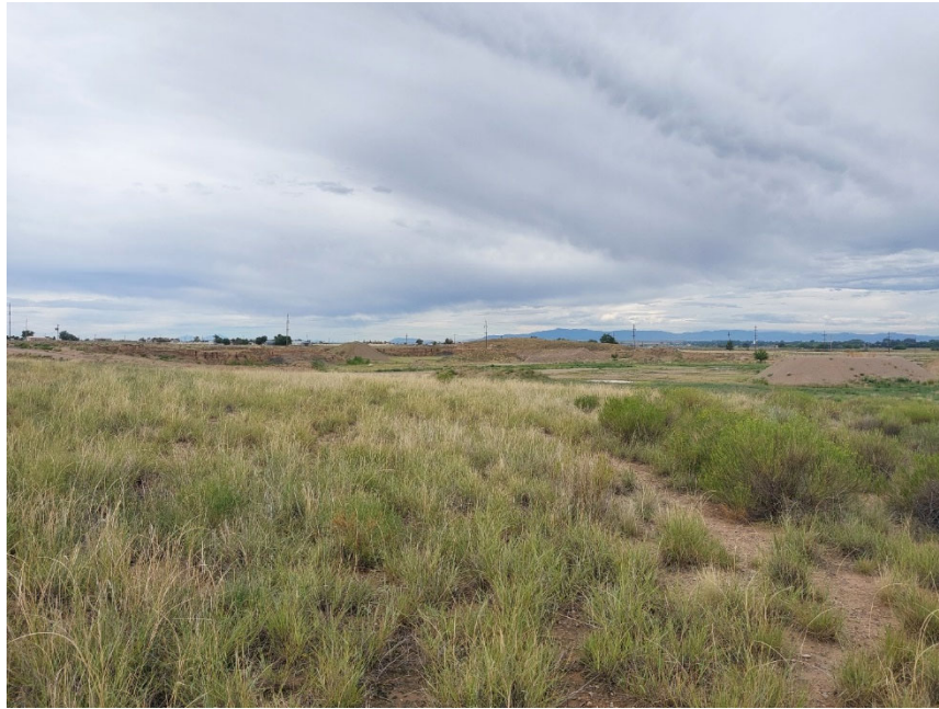
Photo #19: Area of Phase 1 that was reclaimed by previous operator. Looking to the southwest, the current mining area can be seen in the background.