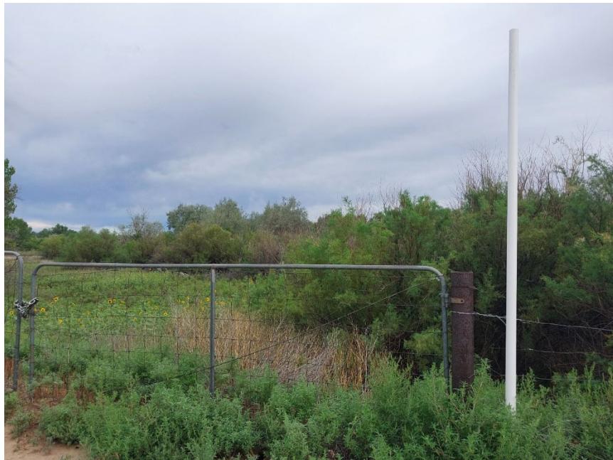
Photo #12: Permit boundary marker located on the east side of the Arkansas River at the northeast corner of the permit area.