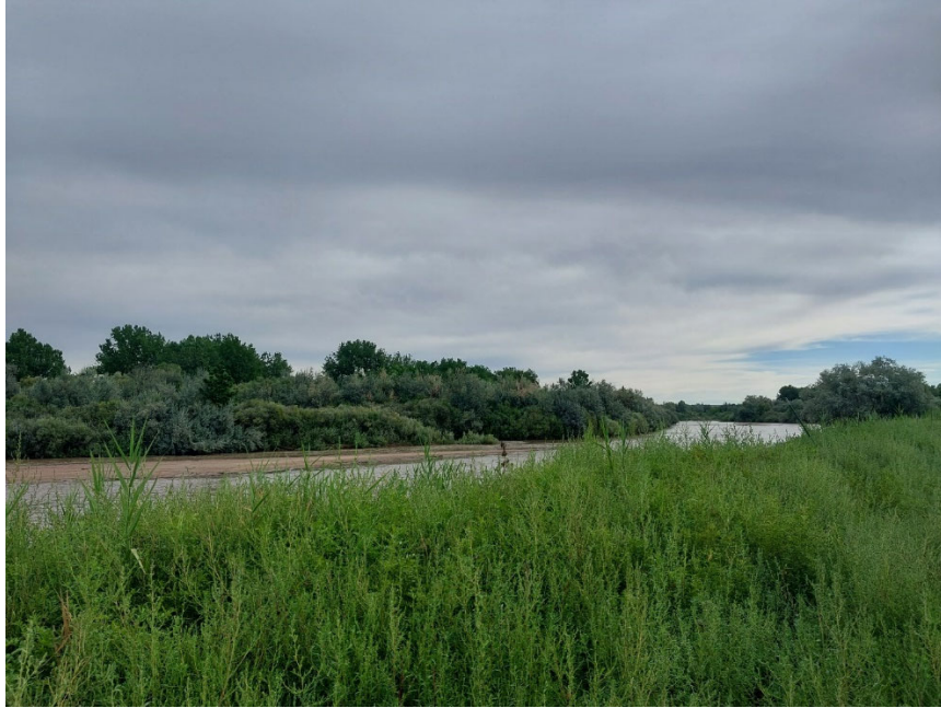
Photo #17: View of the portion of the Arkansas River that is within the permit area. There are no boundary markers in this area due to inaccessibility. Looking downstream.