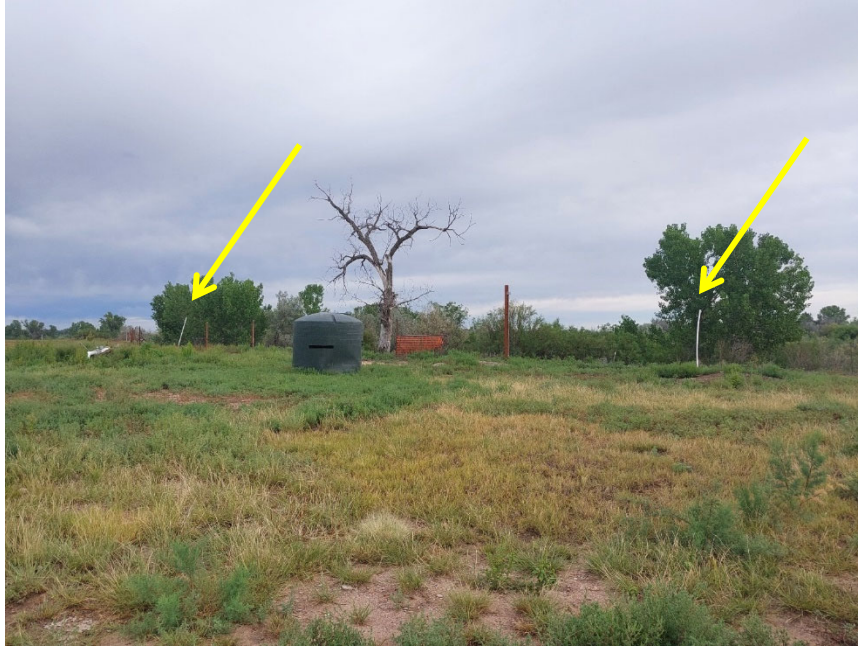
Photo #13: Permit boundary markers located along the north side of the permit area, west of the Arkansas River portion, yellow arrows pointing to the boundary markers.