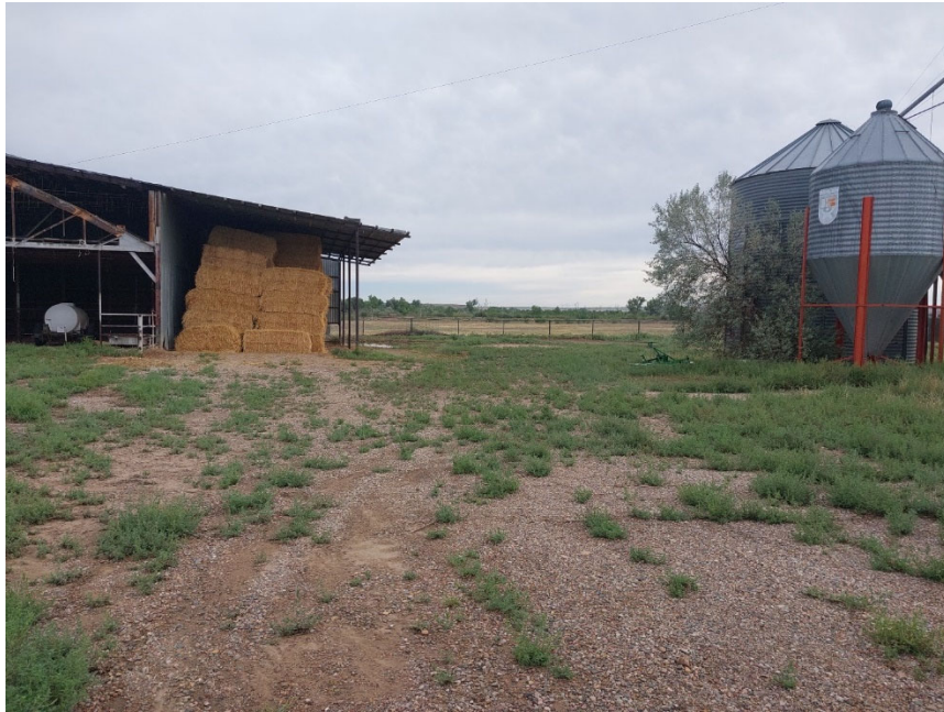
Photo #7: View of the structures located in Phases 2 and 3 that will be demolished as operations progress through Phase 2.