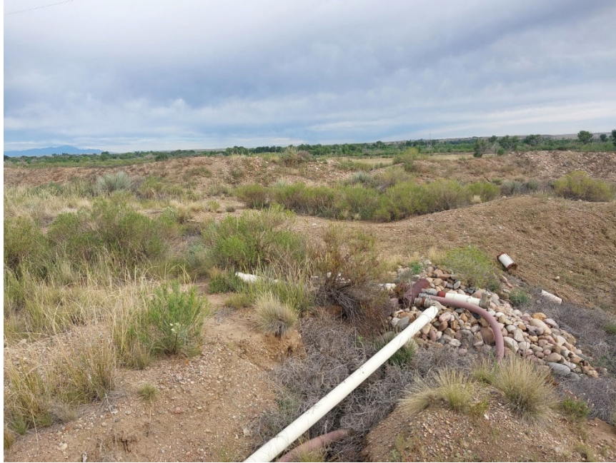
Photo #11: Irrigation system access point located on the higher terrace of the permit area, looking to the northwest.