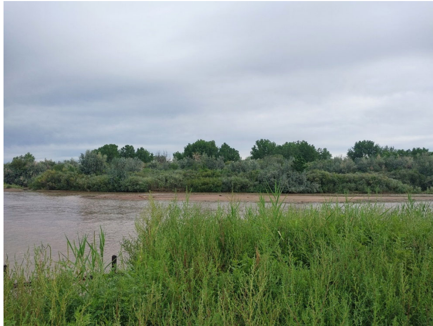
Photo #15: View of the portion of the Arkansas River that is within the permit area. There are no boundary markers in this area due to inaccessibility. Looking north.