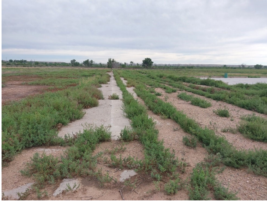
Photo #3: View of internal road that is located between Phase 2 and Phase 4, looking to the north northeast.