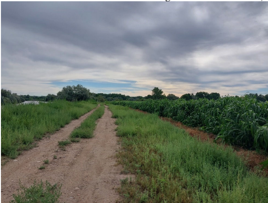
Photo #6: View of internal road the leads to the Arkansas River within Phase 6, looking northeast.