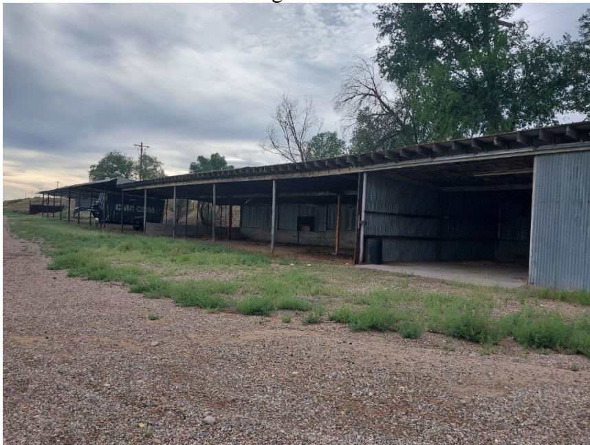
Photo #8: View of structure located in Phases 2 and 3 that will be demolished as operations progress through Phase 2.