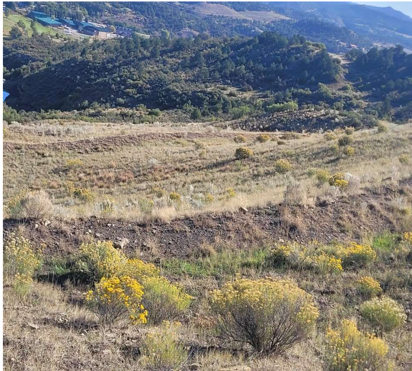
Fill #8 taken on 9/30/24

Fill is in good condition and vegetation is in great condition.