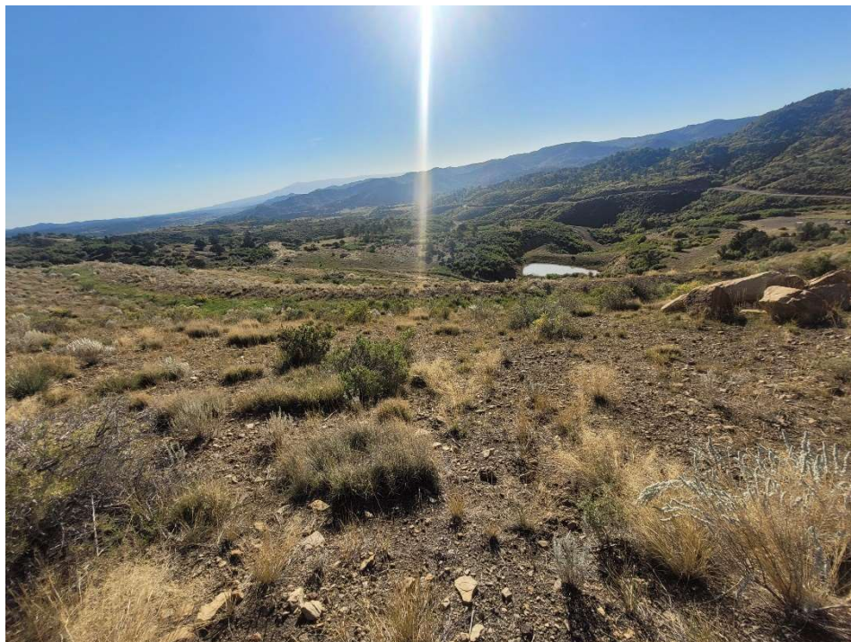
Fill #9 taken on 9/30/24