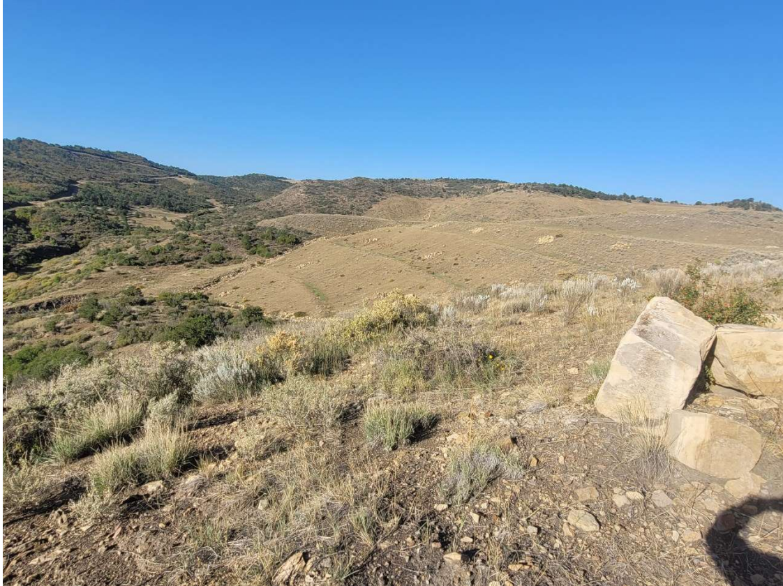
Fill #7 taken on 9/30/24