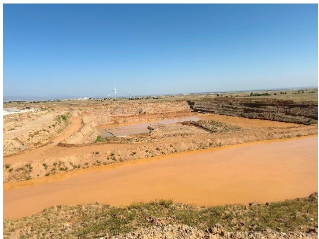
Photo 3: Water storage for on-site wash plant, filtered on-site per operator.