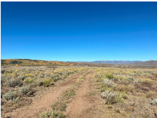
Photo 5: Pre-existing road. The operator has stated that no improvements are planned as part of this permit.