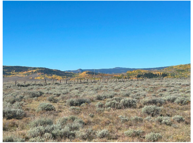
Photo 2: Pre existing fence line and larger post marking southern point of the east permit boundary.