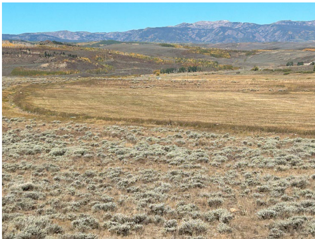
Photo 3: Nearby Arapaho Ditch and northern boundary marker for the eastern site boundary.