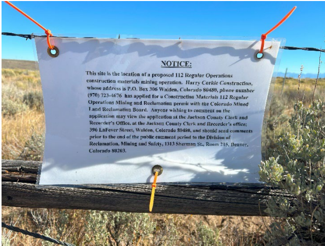
Photo 1: Posted notice of the permit application, located at the gate leading to the permit.