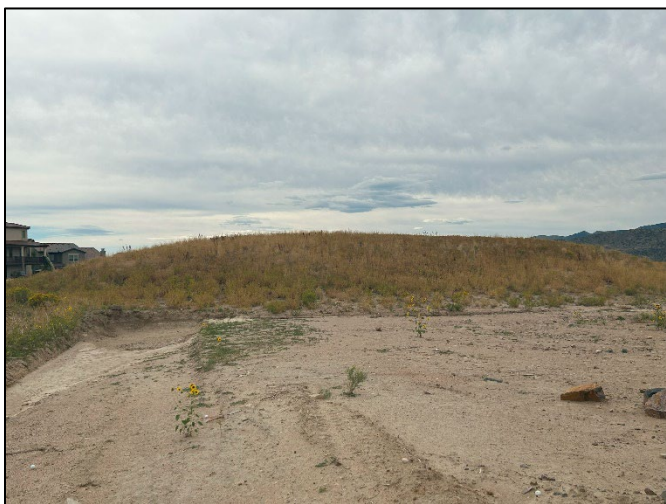
Photo 3: Stockpile that had been a source of complaints. Currently well stabilized.