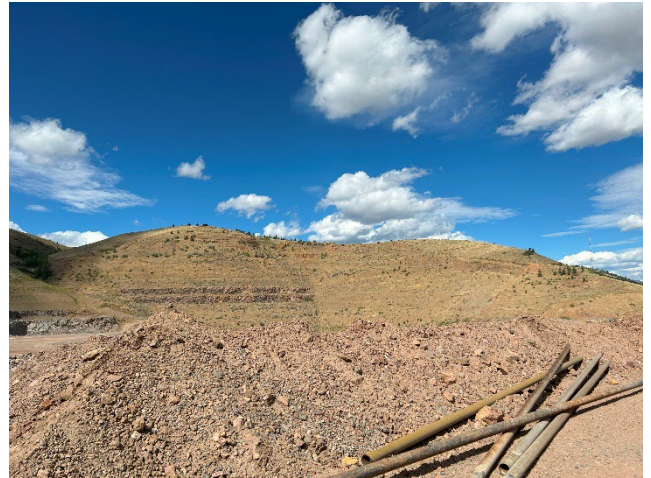
Photo 2: Reclaimed slopes facing north overlooking the quarry pit pond.