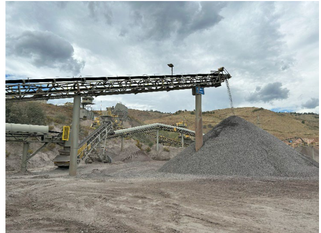
Photo 6: Representative photo of operation stockpiles and processing facilities.