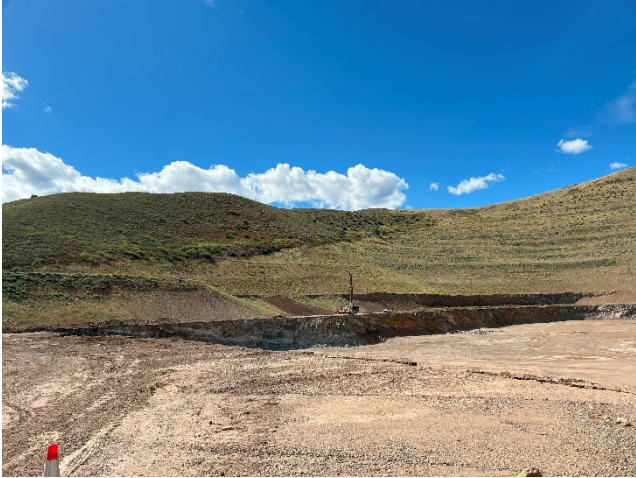
Photo 1: Reclaimed slopes facing south. The unaffected near the top of the slope is the undisturbed AM4 addition.