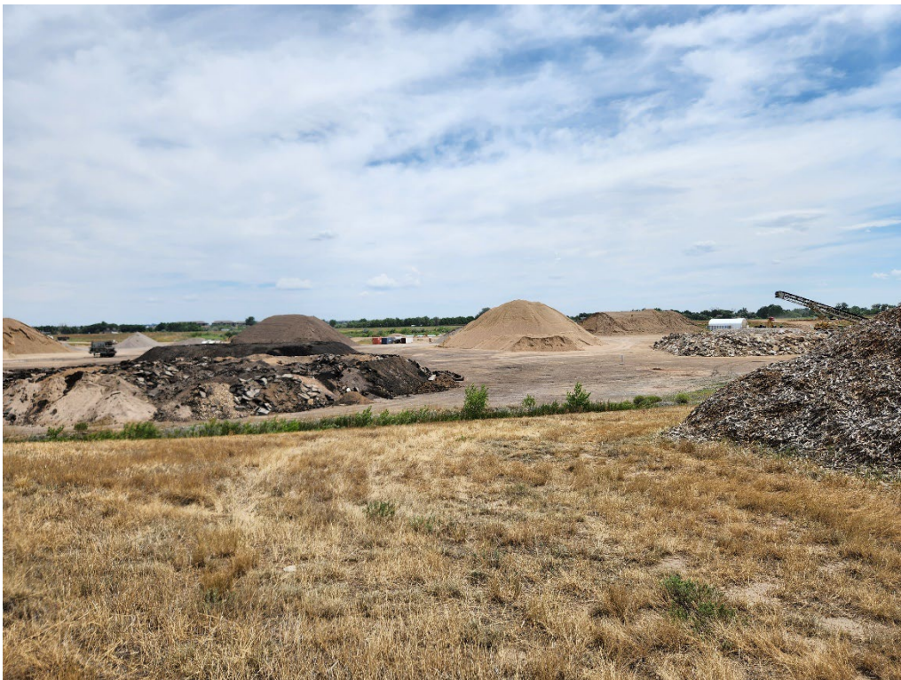
Figure 6. Material stockpiles located in the phase 1 mining area, looking northeast.