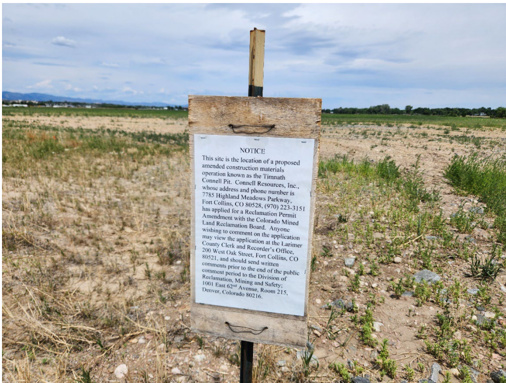
Figure 2. Notice of proposed Amendment sign.