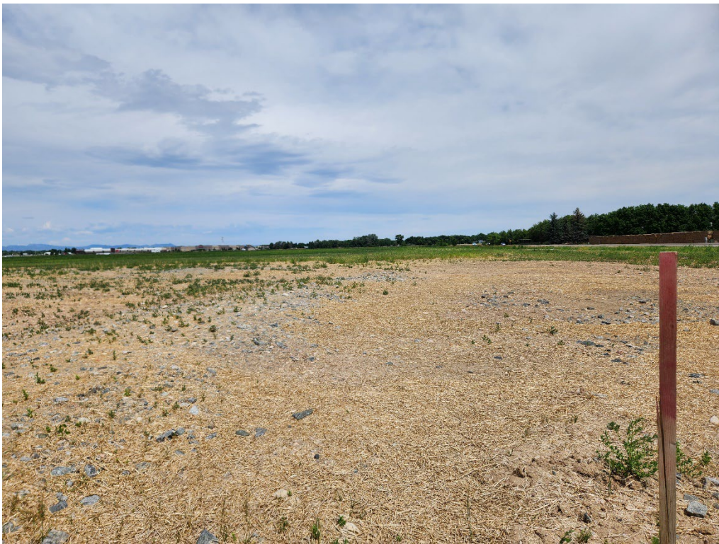
Figure 4. Phase 2 mining area in reclamation, facing north.