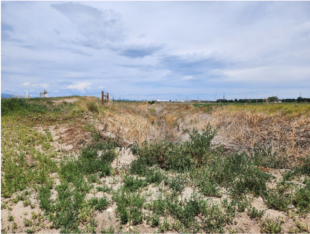
Figure 7. Boxelder ditch, looking north.