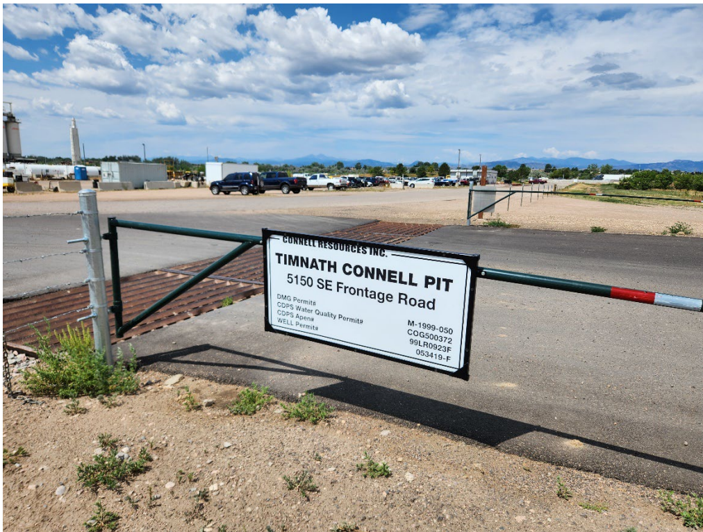
Figure 1. Mine entrance sign.