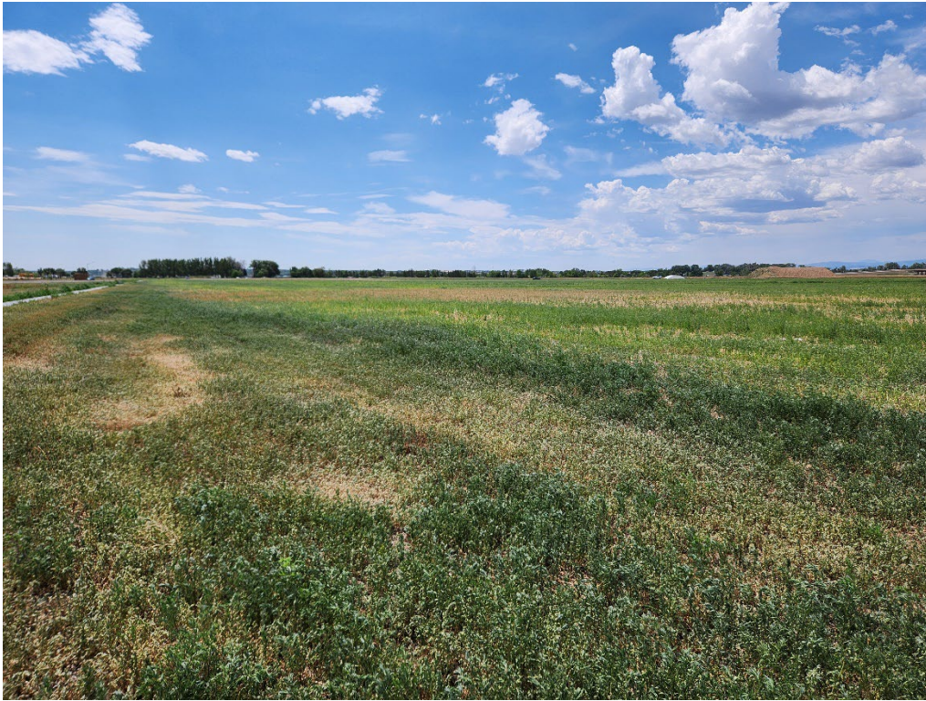
Figure 3. Phase 2 mining area in reclamation, facing southwest.