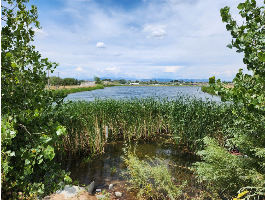
Figure 5. The recharge pond located southwest of the site, looking west.