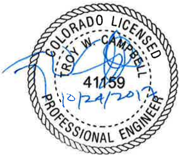
EXHIBIT PREPARED BY: TROY W. CAMPBELL, P.E. #41159

Project: 2186.02 Drawing: SS_EXH Drafted By: CJD Date: 10/24/17 Checked By: TWC