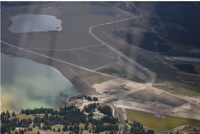
Robinson TSF, 1 Dam, 2 Dam