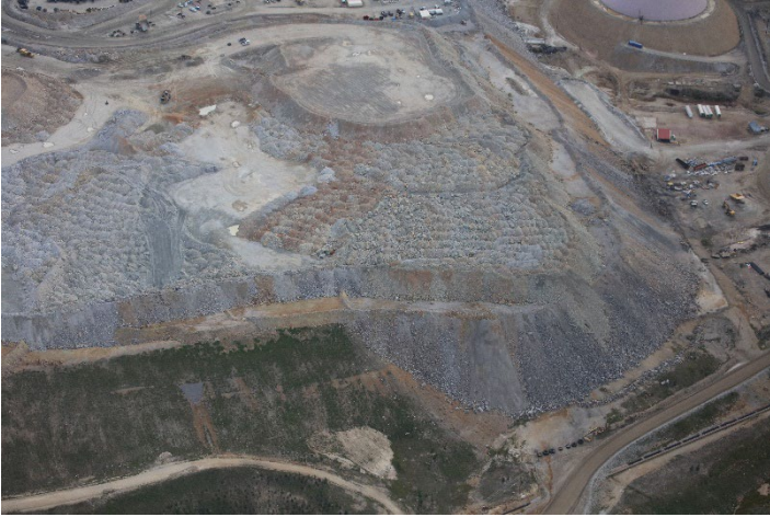
North 40 OSF

The North 40 and McNulty OSF's were observed. No abnormal conditions were noted. OSF's appear to be functioning within the established design criteria.