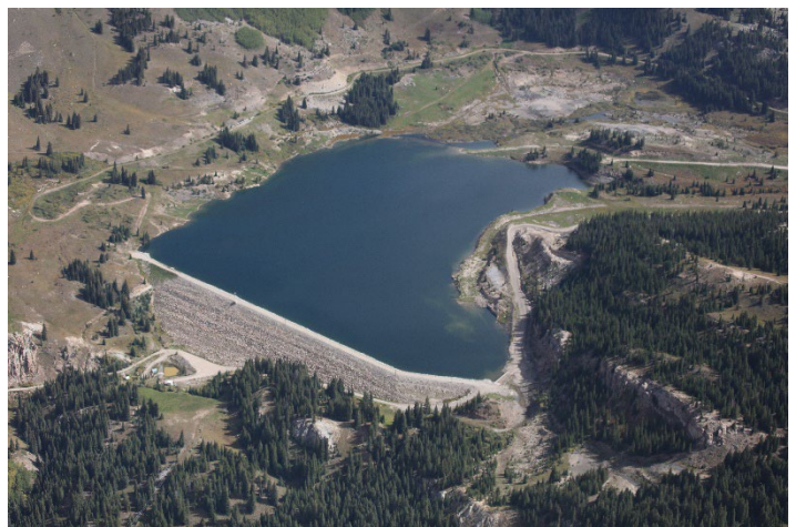
Eagle Park Reservoir/4 Dam

No problems or violations were noted during this inspection.