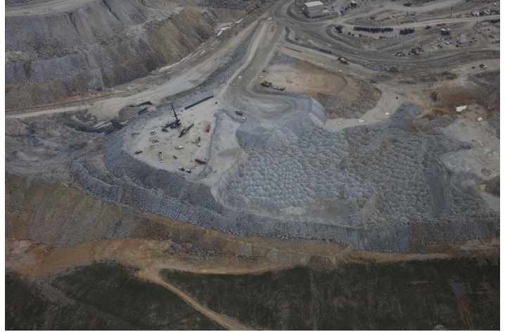
North 40 OSF