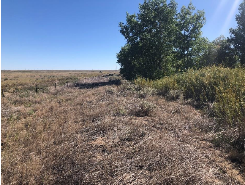
Embankment of Sediment Pond 2