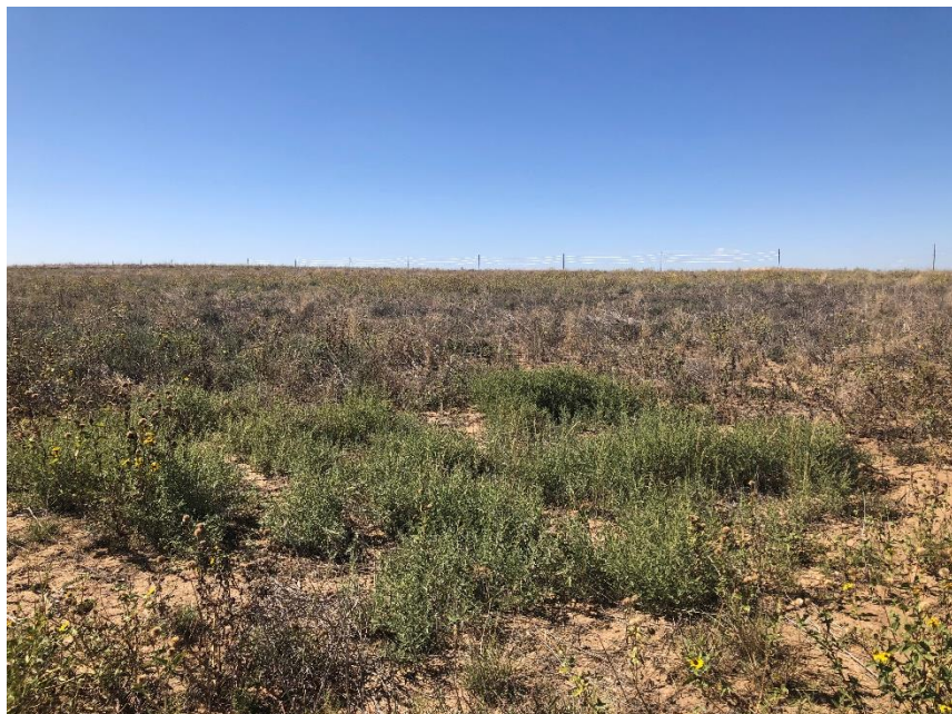
Area 35, looking southwest