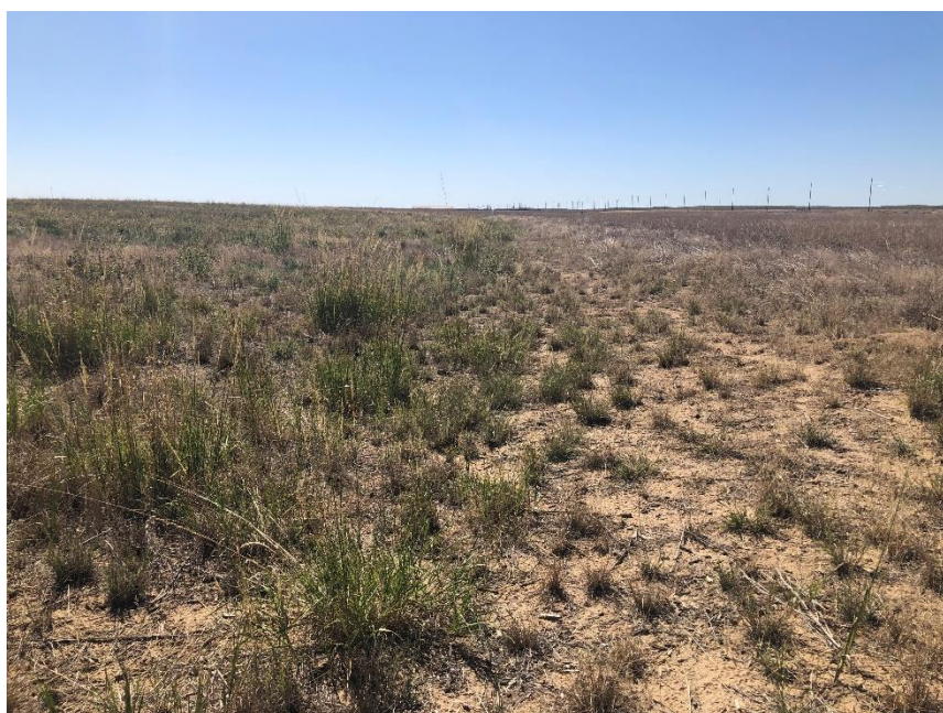
West end of site, looking south from Area 44 – better vegetation in disturbed area on left

Number of Partial Inspection this Fiscal Year: 1