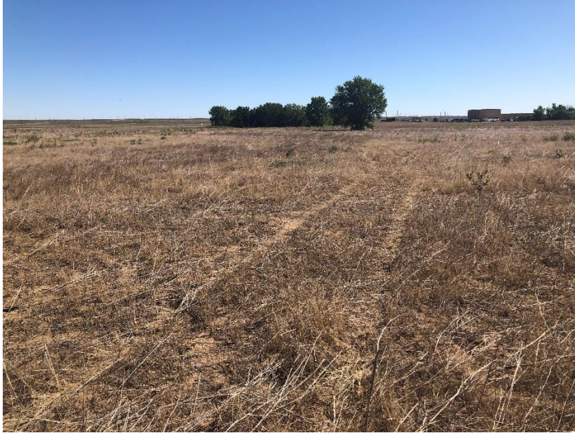
Brown vegetation in Area 42 (west of Area 26)