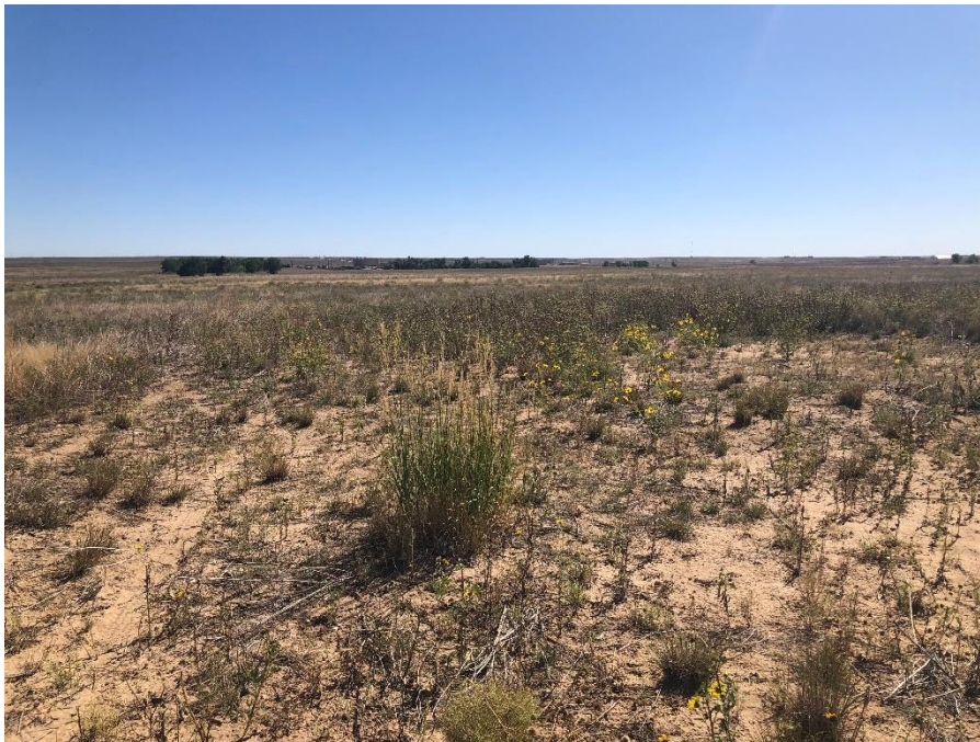
Looking east at reclaimed Long Term Spoil Area

Number of Partial Inspection this Fiscal Year: 1