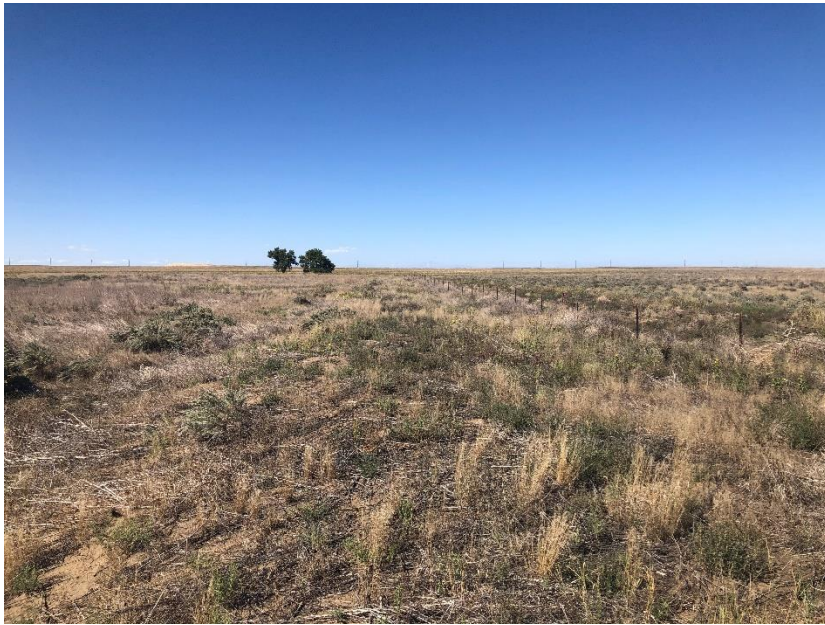
North boundary, looking west from Sediment Pond 2

Number of Partial Inspection this Fiscal Year: 1