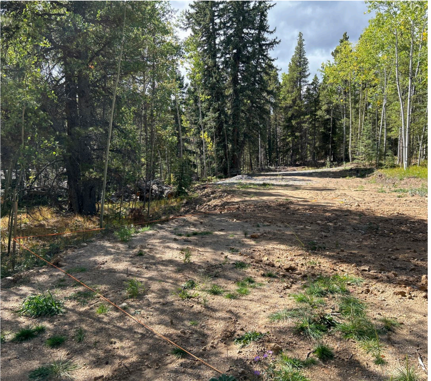
Figure 7: Staked construction site, 367