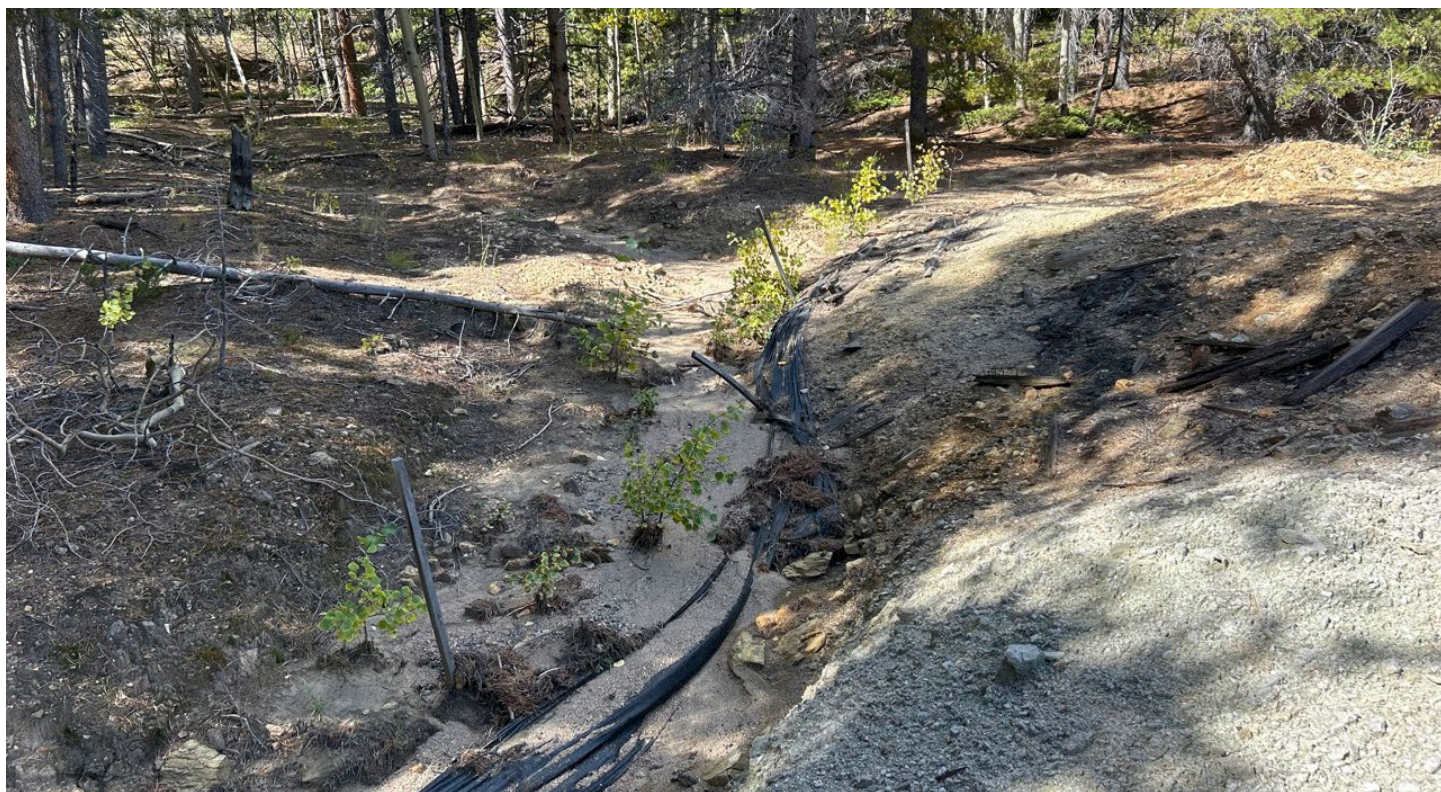
Figure 3: Southern edge of historic waste dump, showing silt fence in poor repair, 364