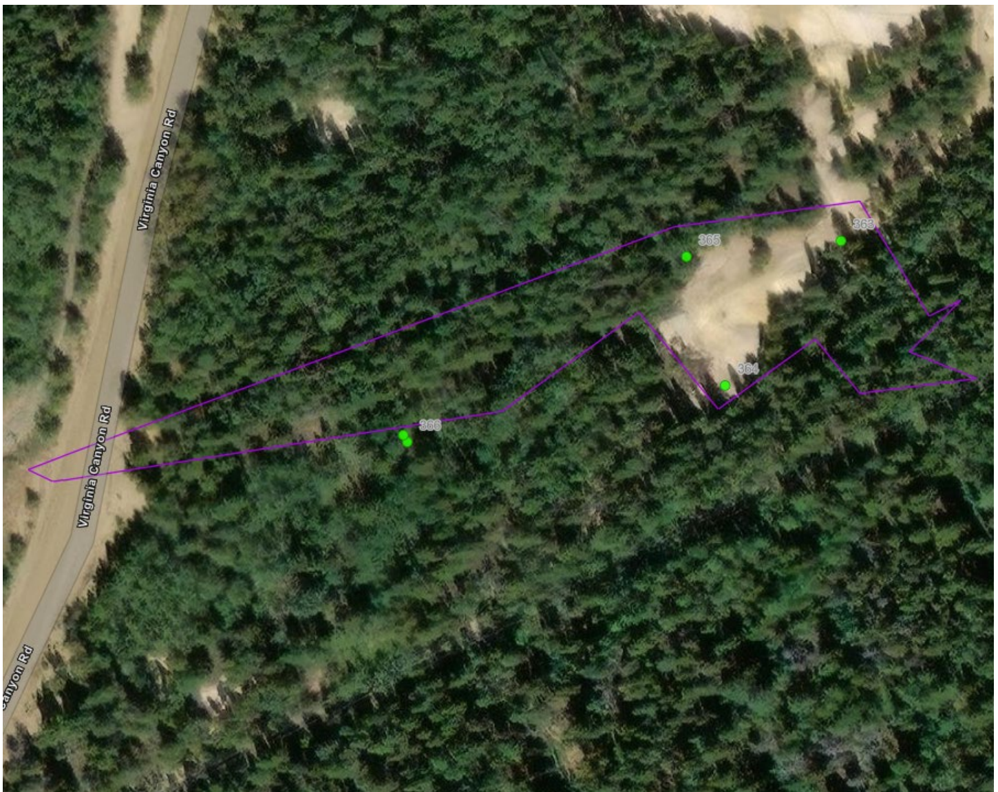
Figure 1: Screenshot of field map; approximate permit boundary in purple, inspection features in green

For a 110(d) permit, the permit boundary and affected area boundary are identical. The boundary is shown on several maps, including Map E1, Mining Plan, Affected Area Description. An attempt was made to georeference the map using the property lines shown on the map and a GIS layer of legacy tax parcels made available by Gilpin County; although this process is not perfect, it was possible to digitize an approximate permit boundary polygon for use in the field. No boundary markers could be located in the field. A problem has been cited above.