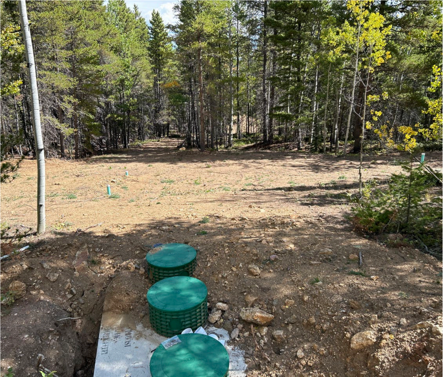
Figure 6: Recently installed septic tank and leach field, 366