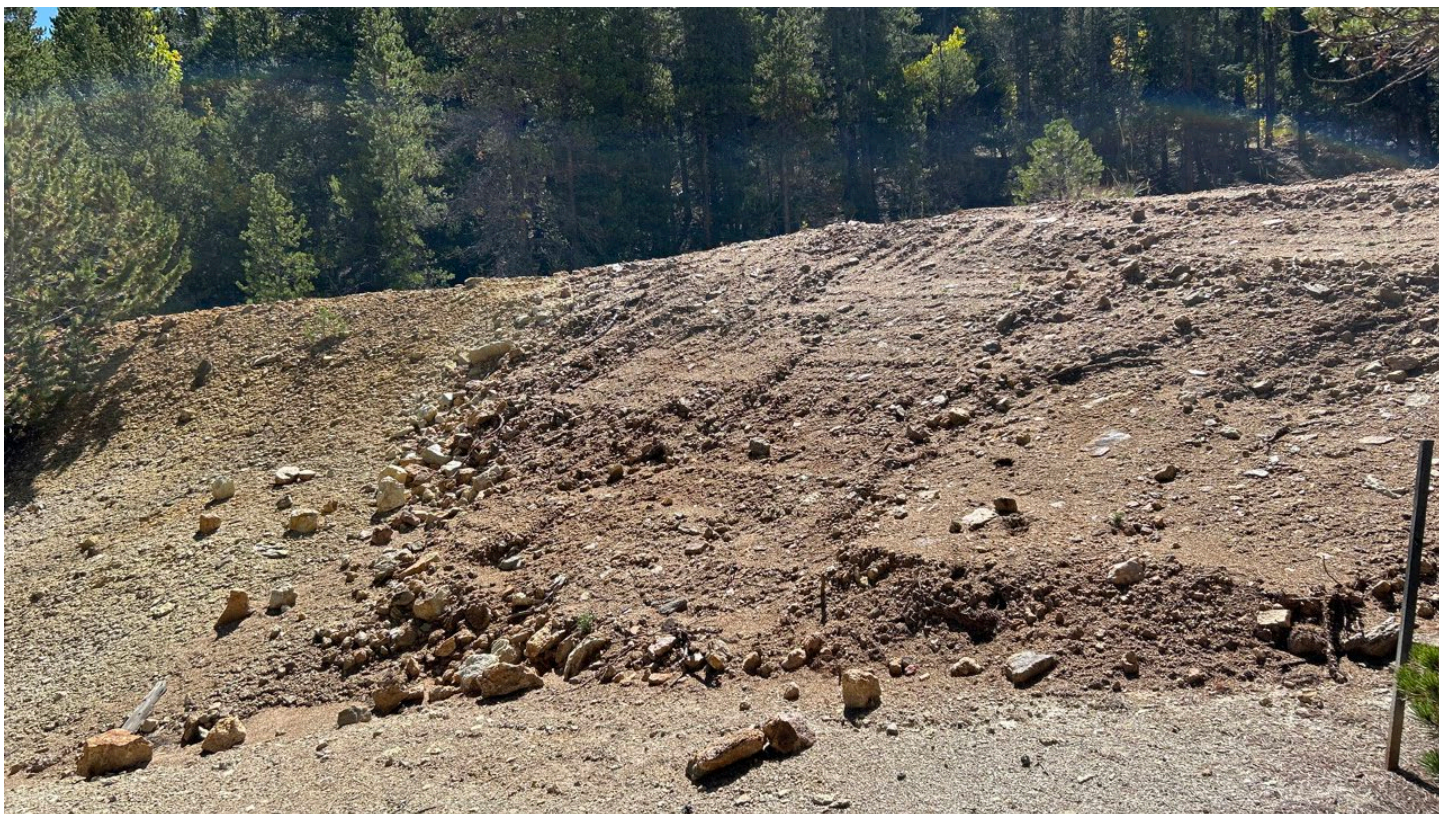
Figure 5: Northern edge of historic waste dump, showing soil brought to site, 365