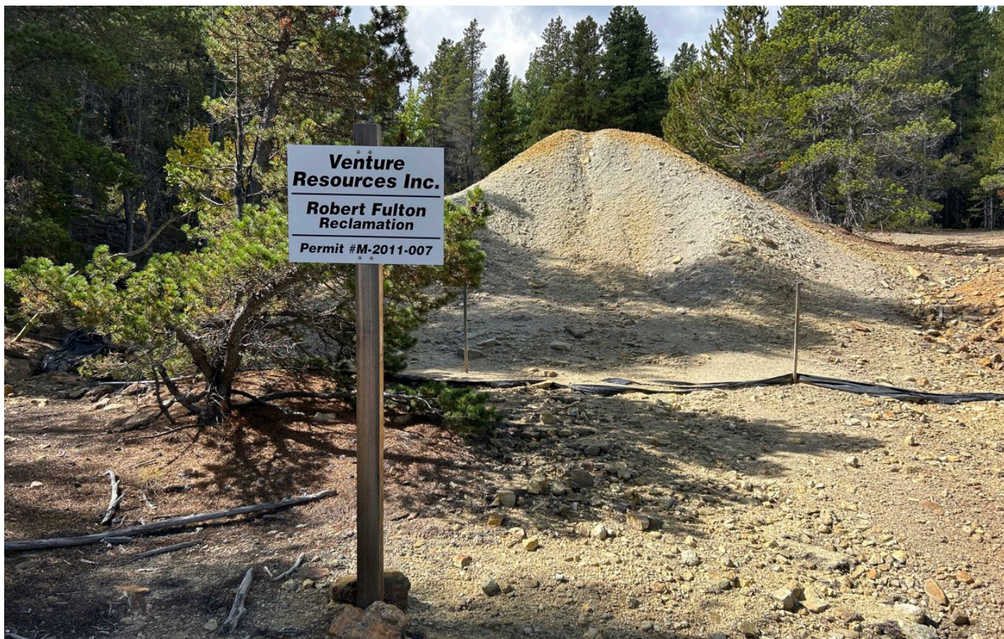
Figure 2: Mine ID sign, 363