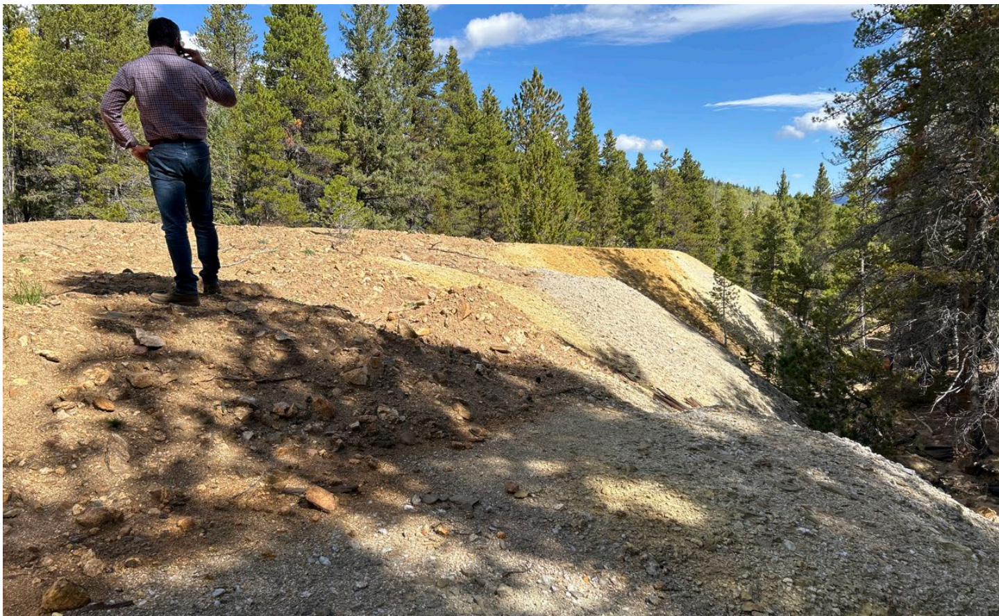
Figure 4: Southern edge of historic waste dump, showing soil brought to site, 364