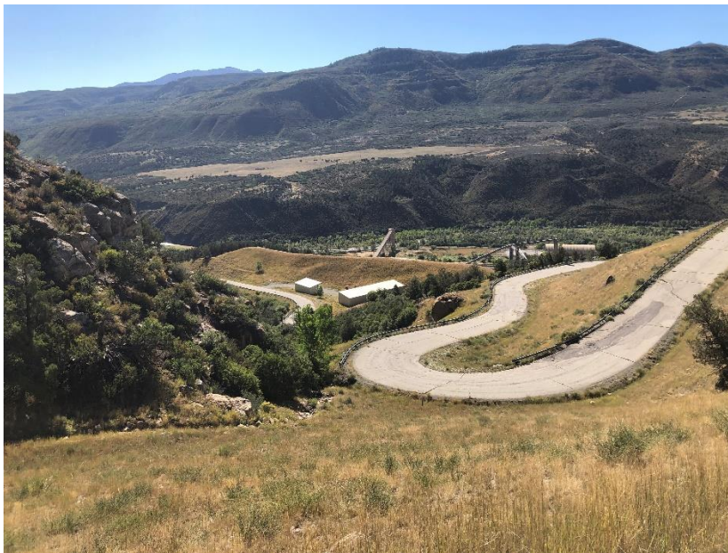
Curve 6 and Topsoil Stockpile A

Number of Partial Inspection this Fiscal Year: 2