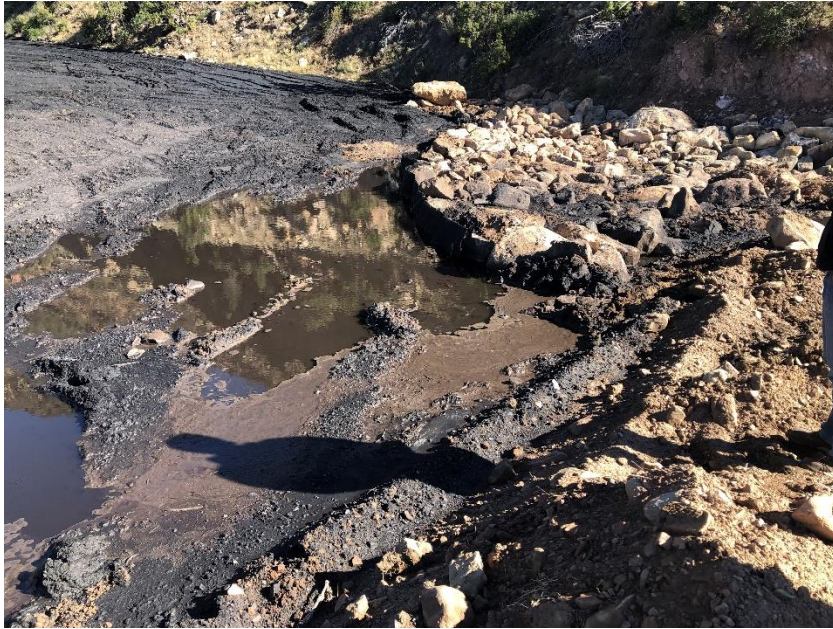
Sump area on Gob Pile #2 under construction – water from rain the day before the inspection