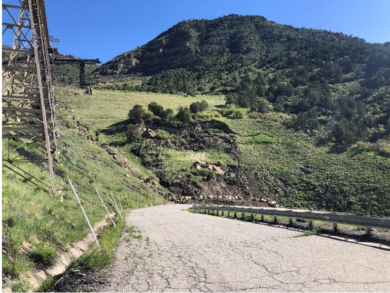
Curve 10 slide, taken in May 2024