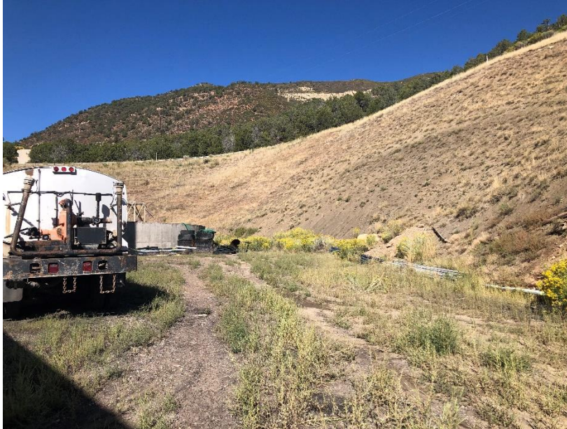
Slope behind the Prep Plant