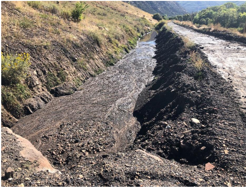
Ditch F7a in need of cleaning

Number of Partial Inspection this Fiscal Year: 2