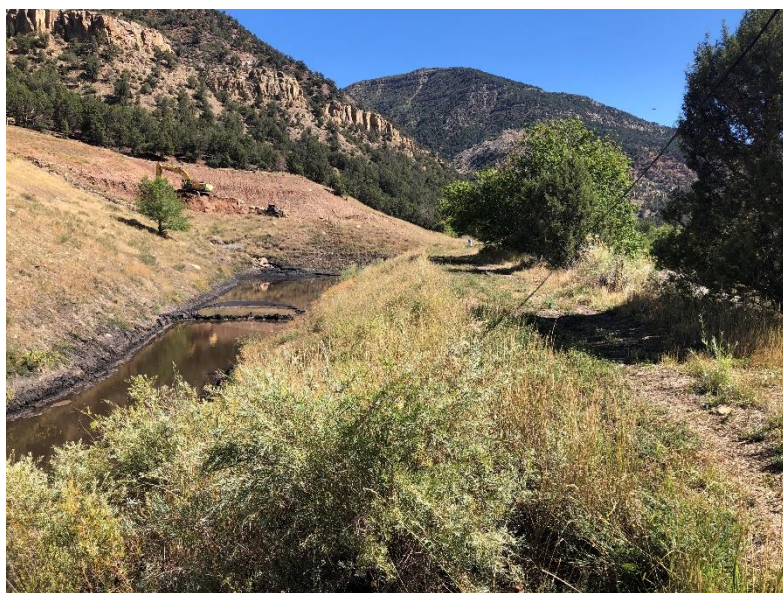
Pond F, looking east

Number of Partial Inspection this Fiscal Year: 2