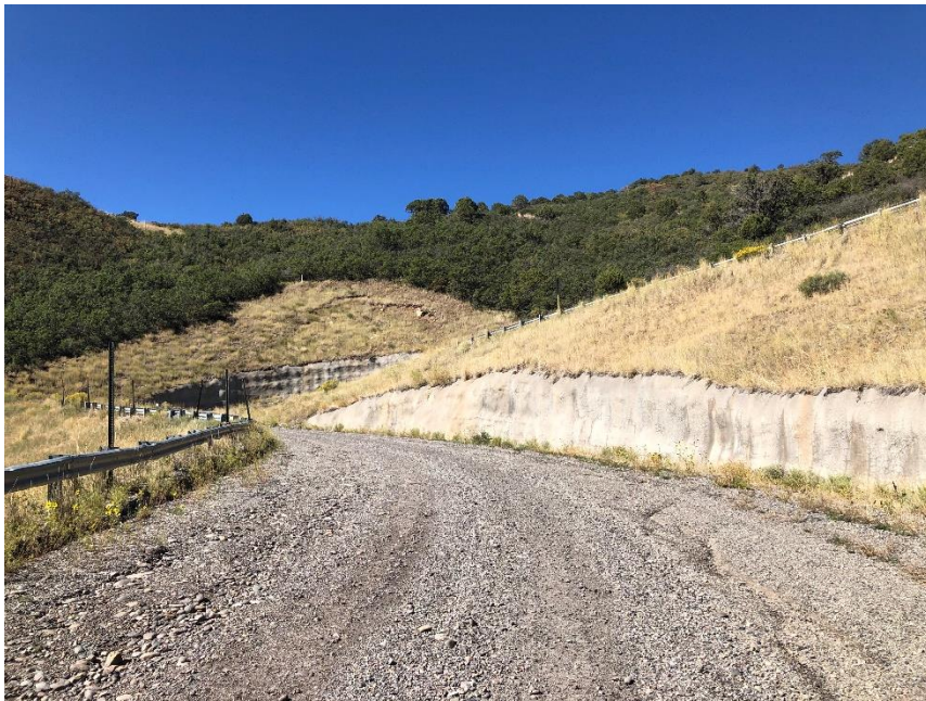
Curve 11 – slide appears to be healing

Number of Partial Inspection this Fiscal Year: 2