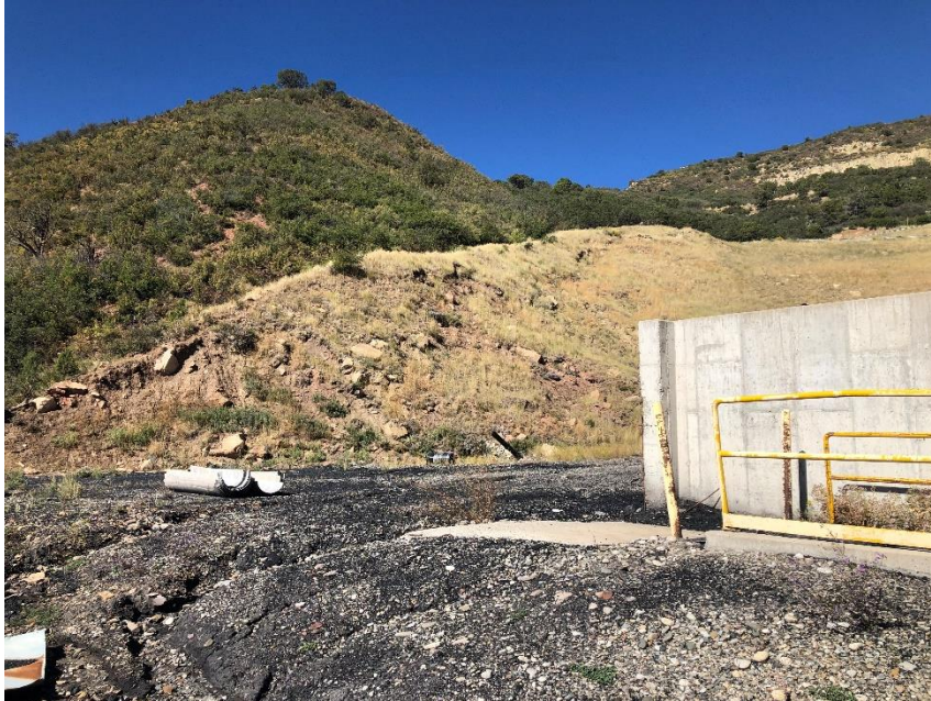
B Portal bench – slide appears to be healing