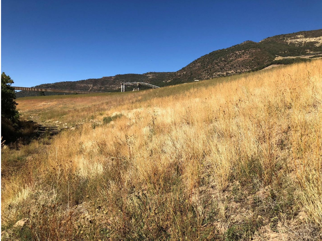
Gob Pile #3, looking west at south side

Number of Partial Inspection this Fiscal Year: 2