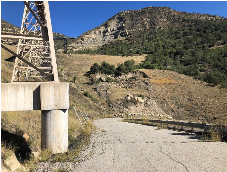
Curve 10 slide, taken in September 2024

Number of Partial Inspection this Fiscal Year: 2