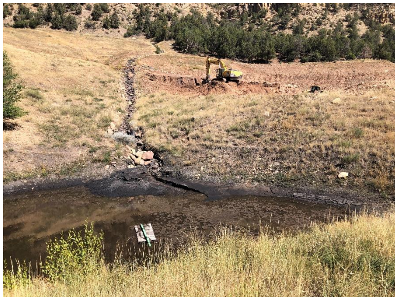
Pond F inlet and soil pile above