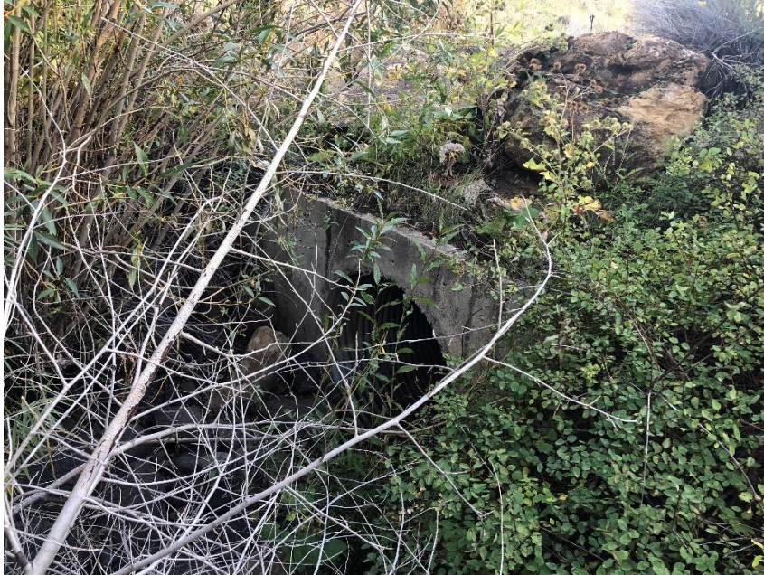
West Mine – upstream end of large culvert under ponds