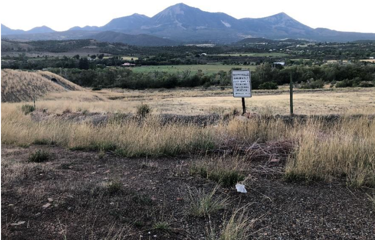
Coal Storage near highway

Number of Partial Inspection this Fiscal Year: 2