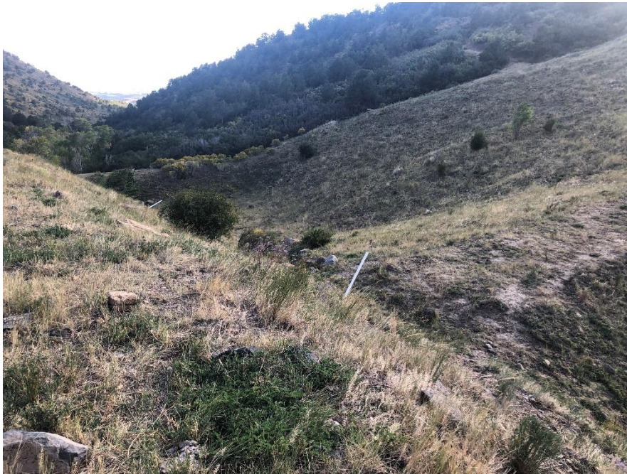
West Mine ponds