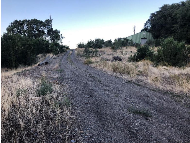
Loadout - road below shop and silo area