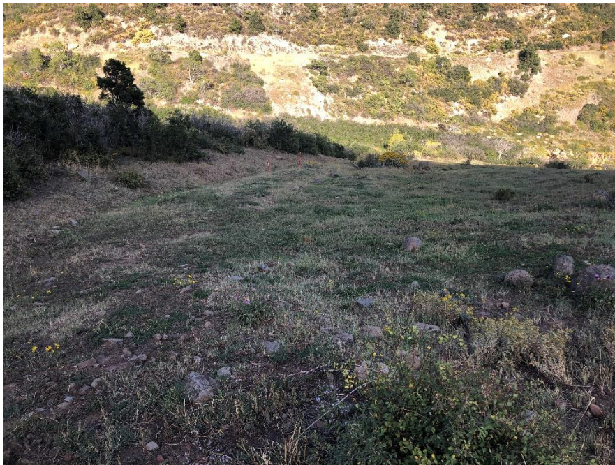
West Mine reclaimed road, looking downhill

Number of Partial Inspection this Fiscal Year: 2