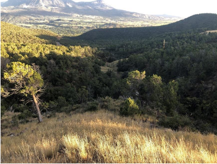
Drainage near reclaimed Ponds 3 and 4