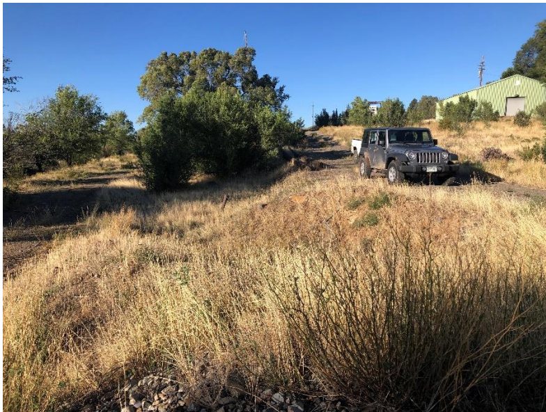
Ditch along south end of loadout where a sediment basin may be constructed

Number of Partial Inspection this Fiscal Year: 2