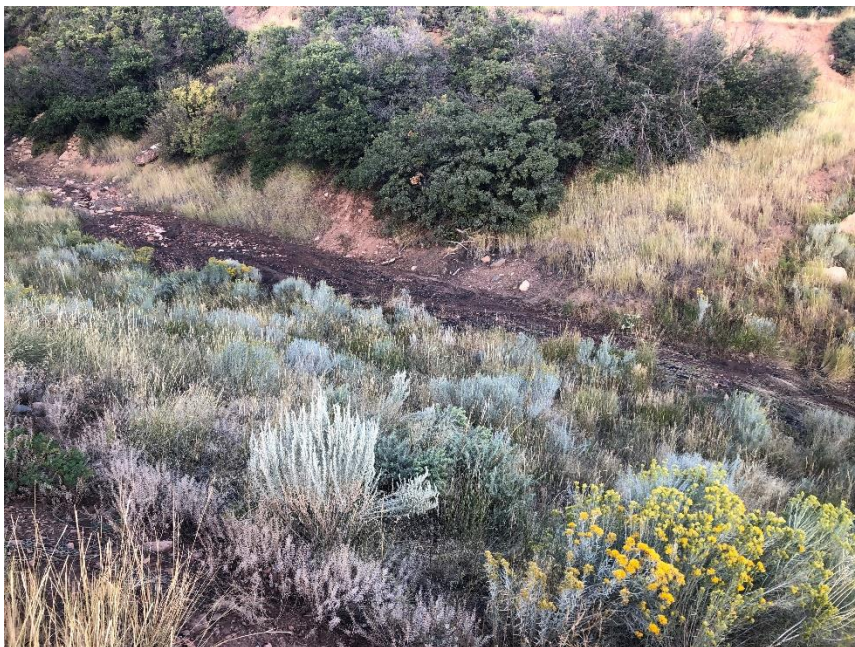
East Mine – drainage at reclaimed Pond 1

Number of Partial Inspection this Fiscal Year: 2