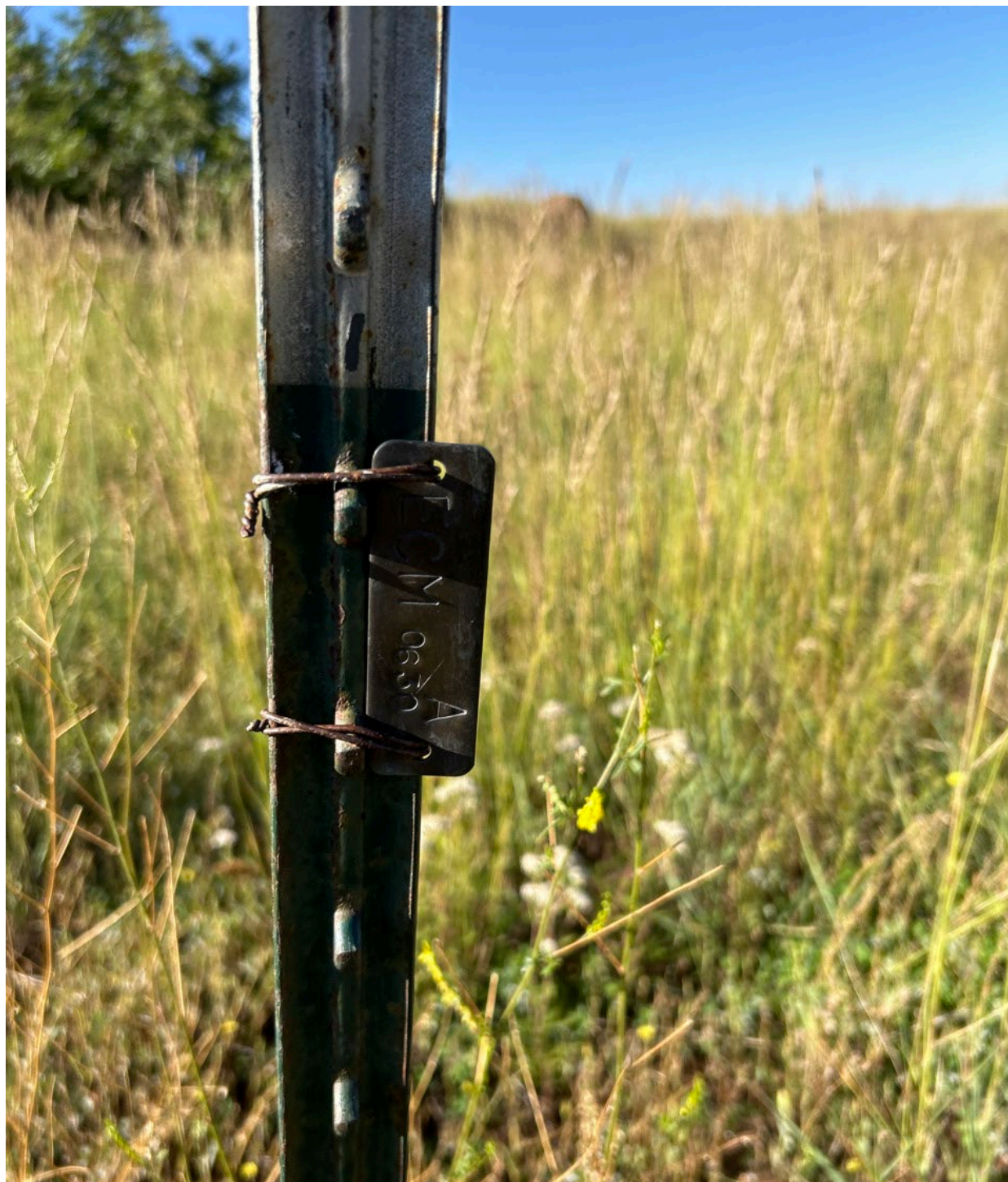
Figure 5: ECM 06-30A

Number of Partial Inspection this Fiscal Year: 0