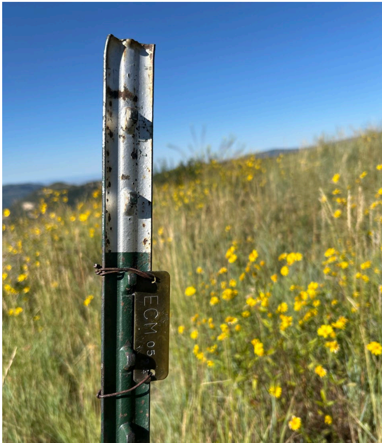
Figure 7: ECM 05-24

Number of Partial Inspection this Fiscal Year: 0