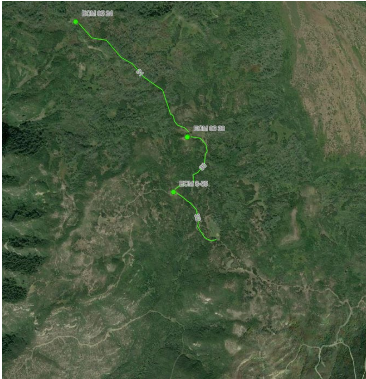
Figure 1: Screenshot of inspection map

No enforcement actions were initiated as a result of this inspection, nor are any pending.