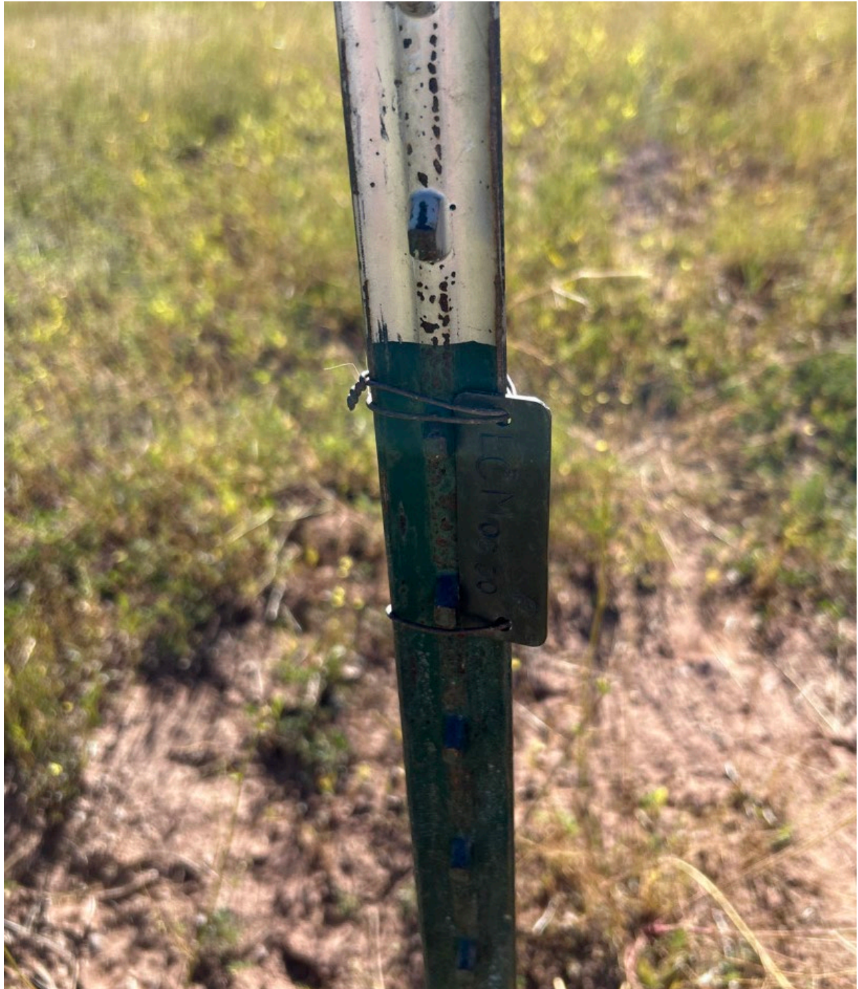
Figure 4: ECM 06-30

Number of Partial Inspection this Fiscal Year: 0