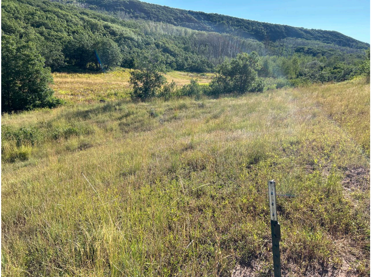
Figure 6: ECM 06-30 pad

Number of Partial Inspection this Fiscal Year: 0