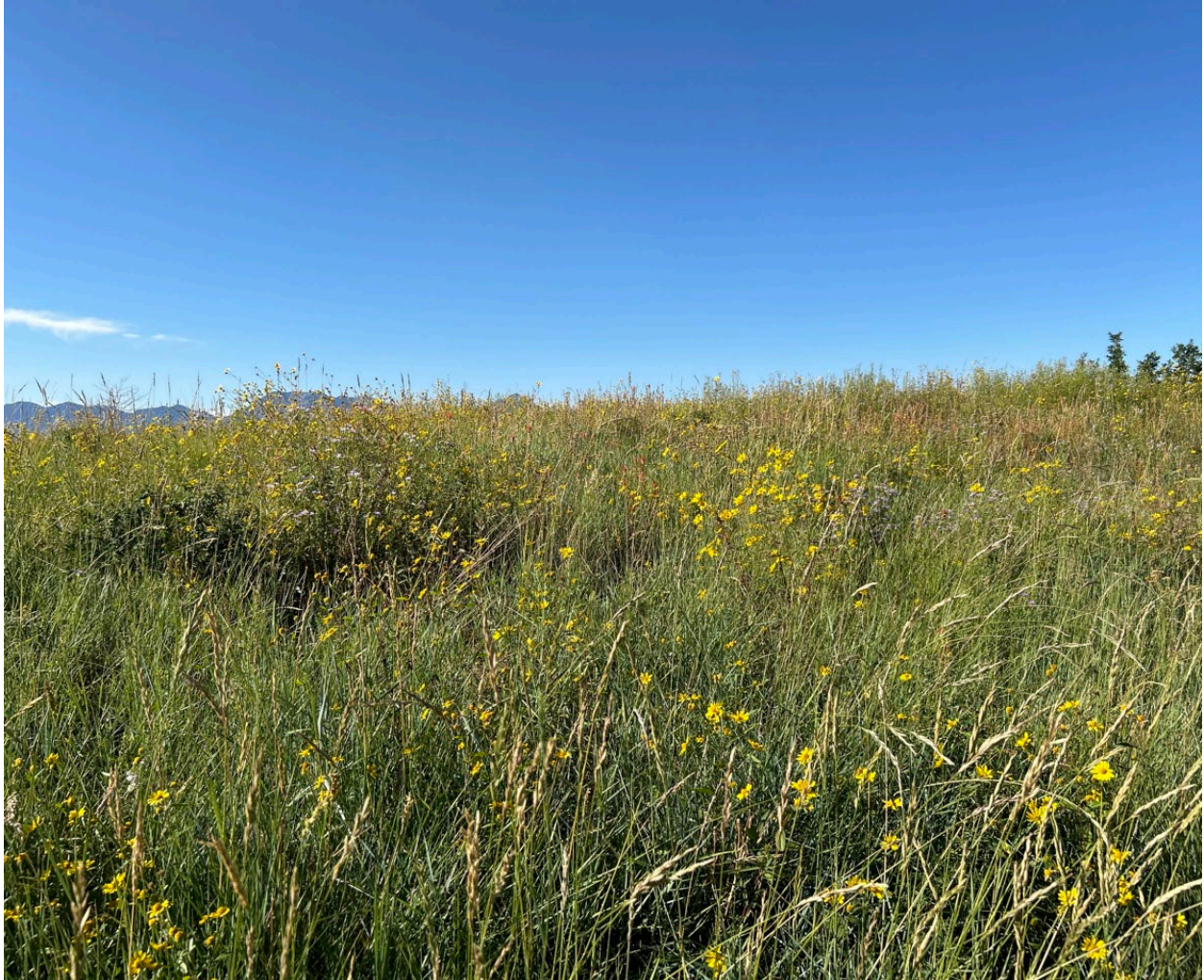
Figure 8: ECM 05-24 pad

Number of Partial Inspection this Fiscal Year: 0