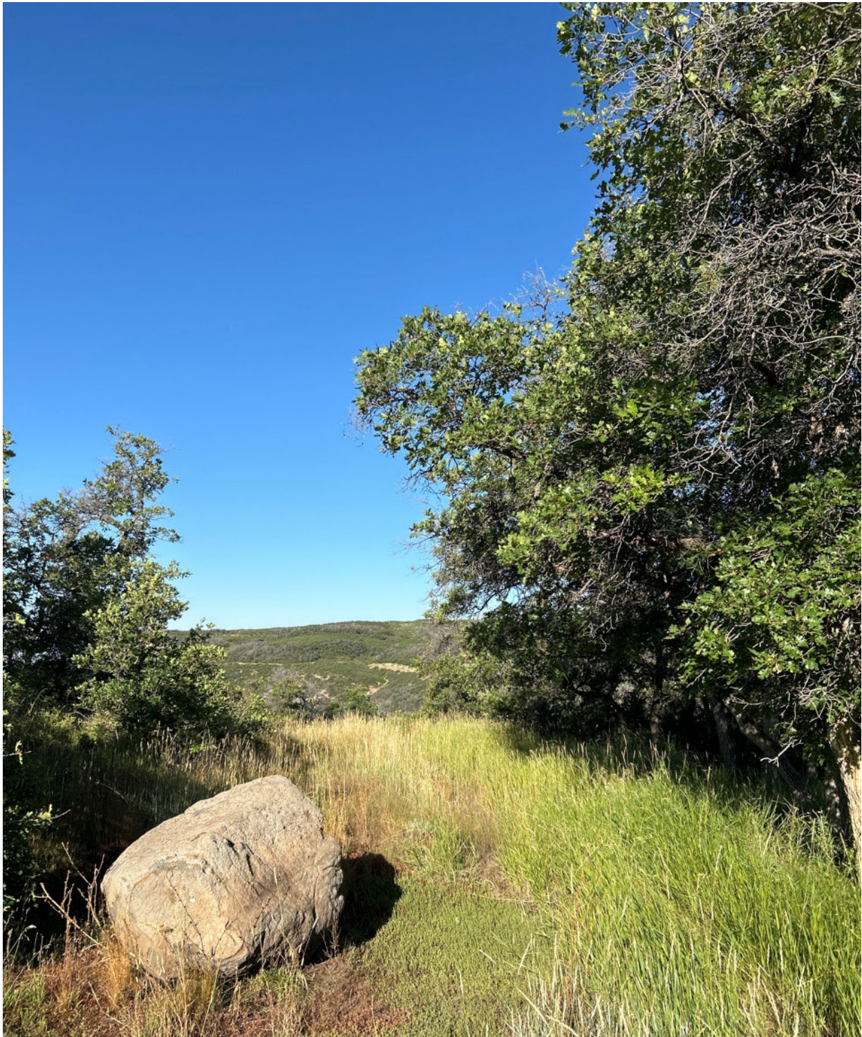
Figure 2: Reclaimed road

Number of Partial Inspection this Fiscal Year: 0