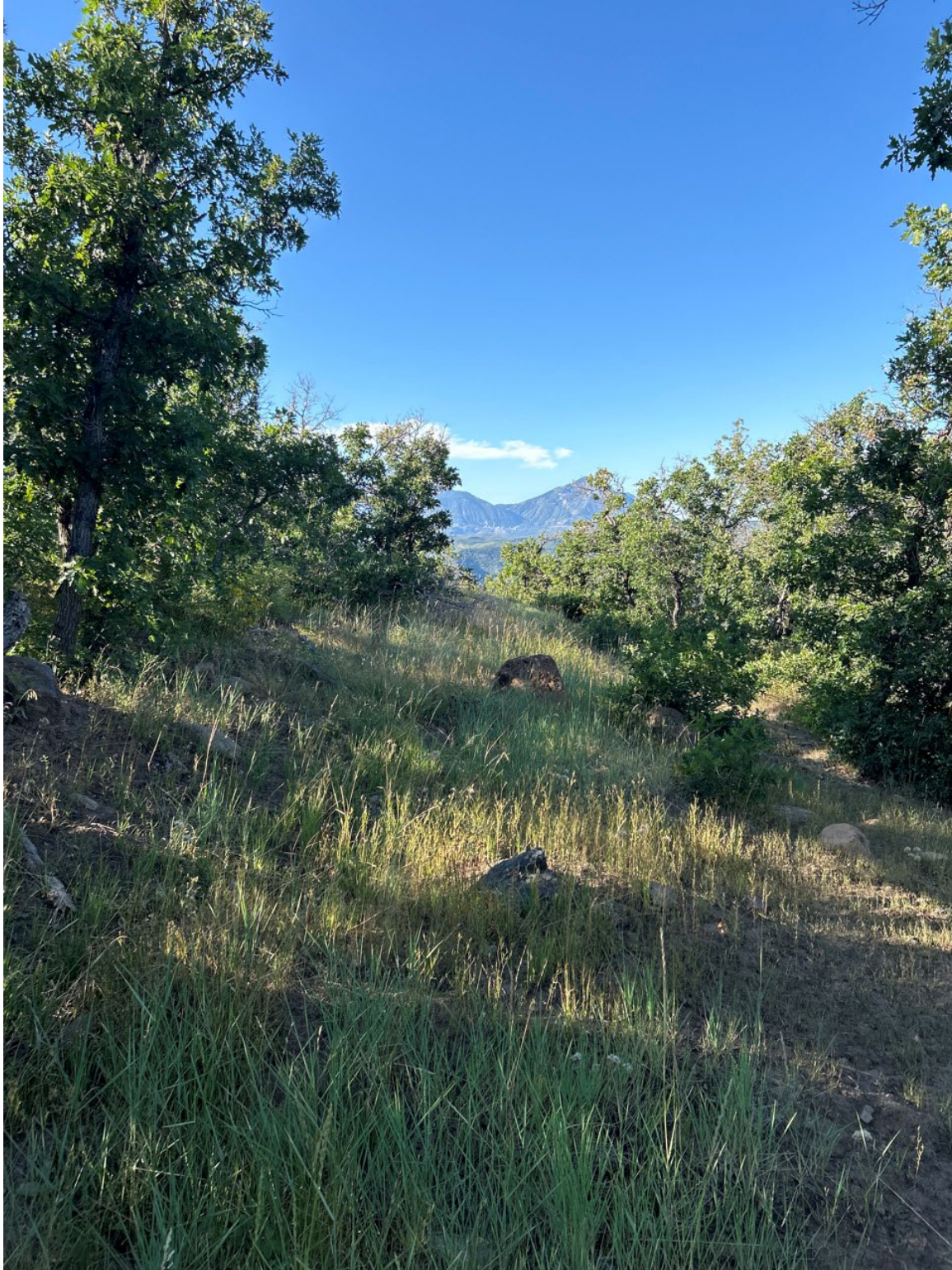
Figure 3: Reclaimed road with volunteer shrubs

Number of Partial Inspection this Fiscal Year: 0