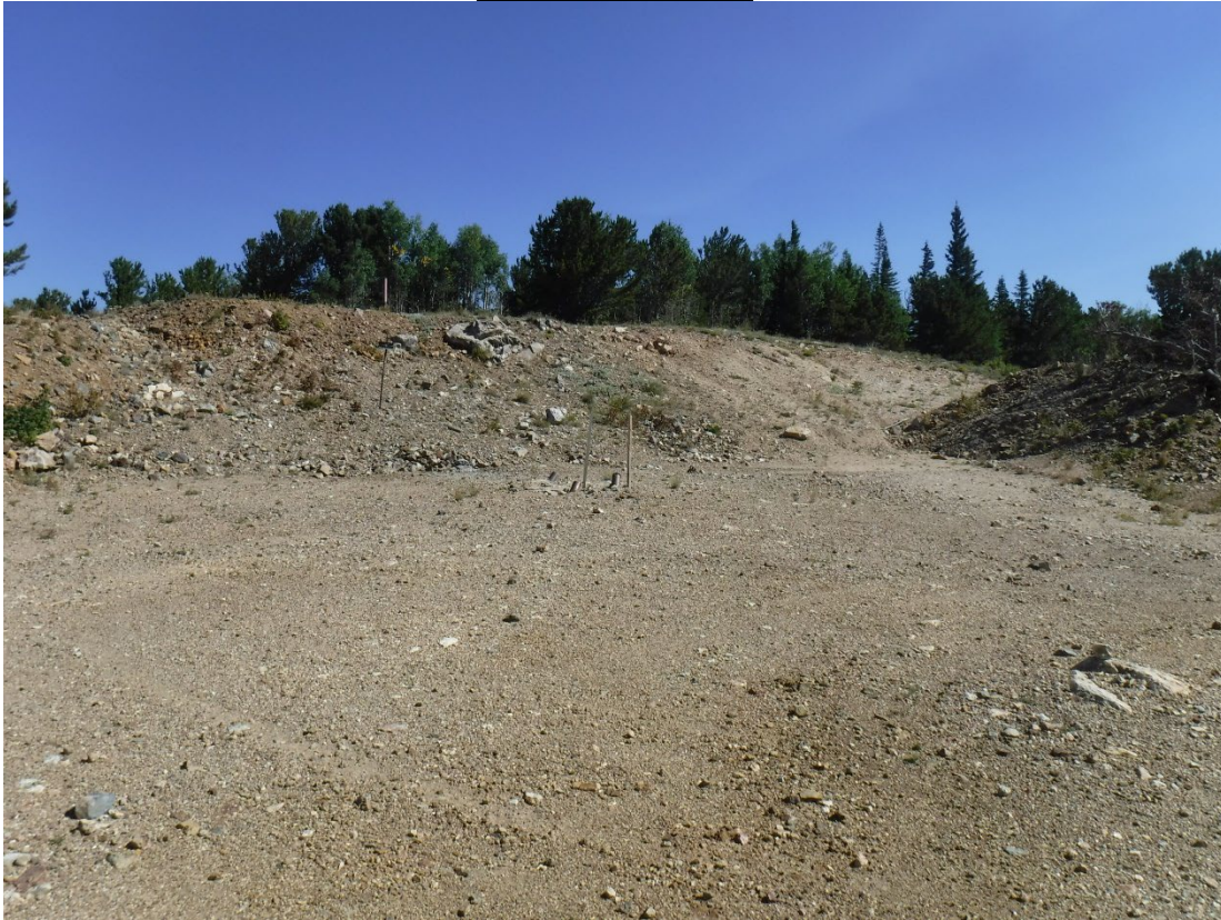
Photo 1: Looking at the main area of the drill pad, looking northeast