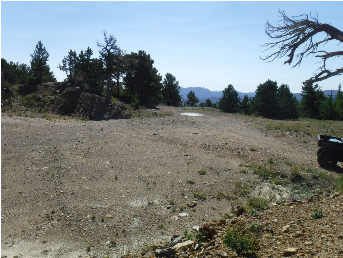
Photo 3: Looking east across the southern portion of the drill pad