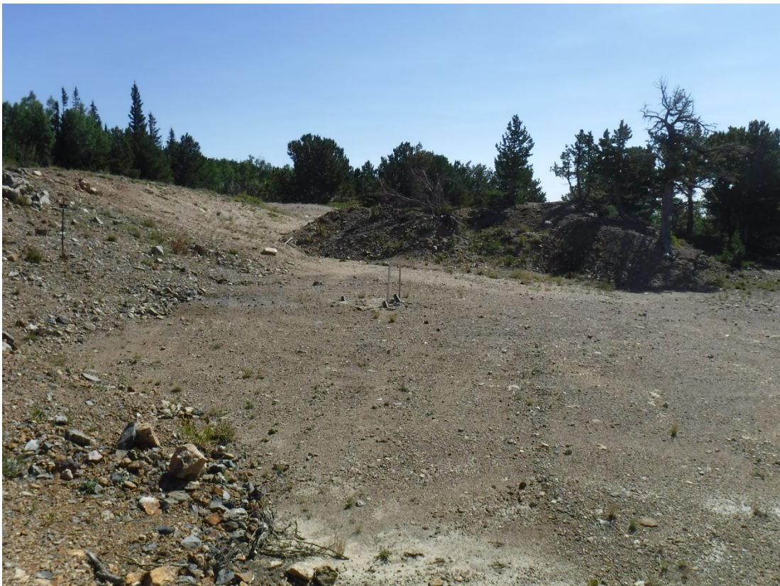
Photo 2: Looking east across the drill pad the three abandoned drill locations center of photo