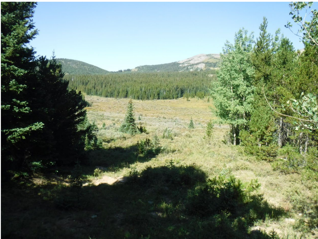
Photo 4: Looking southeast from where the access road is towards drill location, no activity