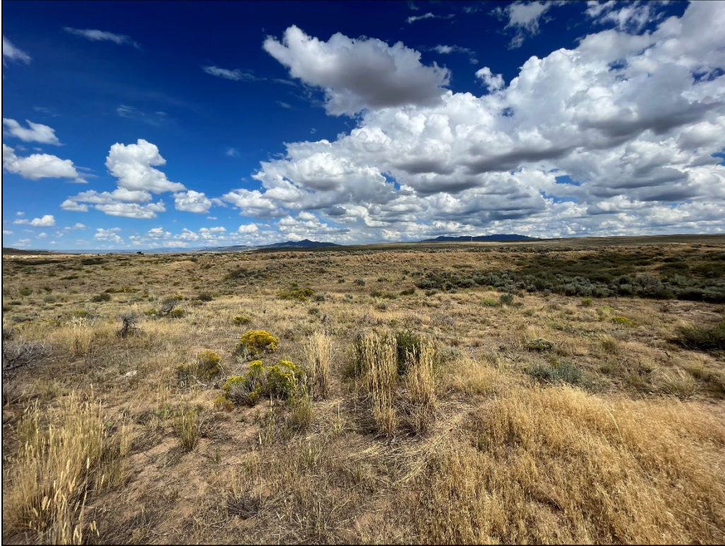
Photo 1: Area of representative vegetation and topography of where test pits will eventually be dug.