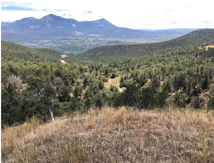
Lower reclaimed ponds at East Mine (Ponds 3 and 4), viewed from above

Number of Partial Inspection this Fiscal Year: 2