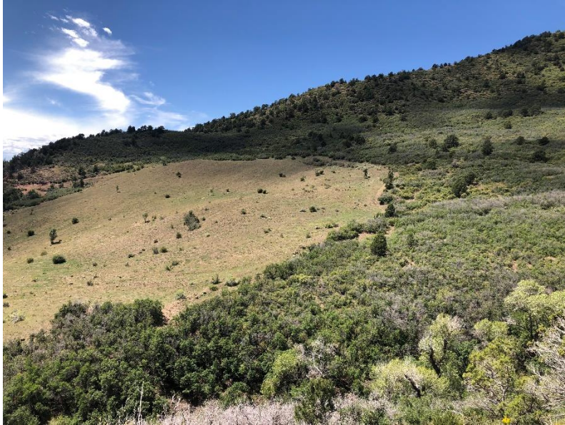
Reclaimed road at West Mine