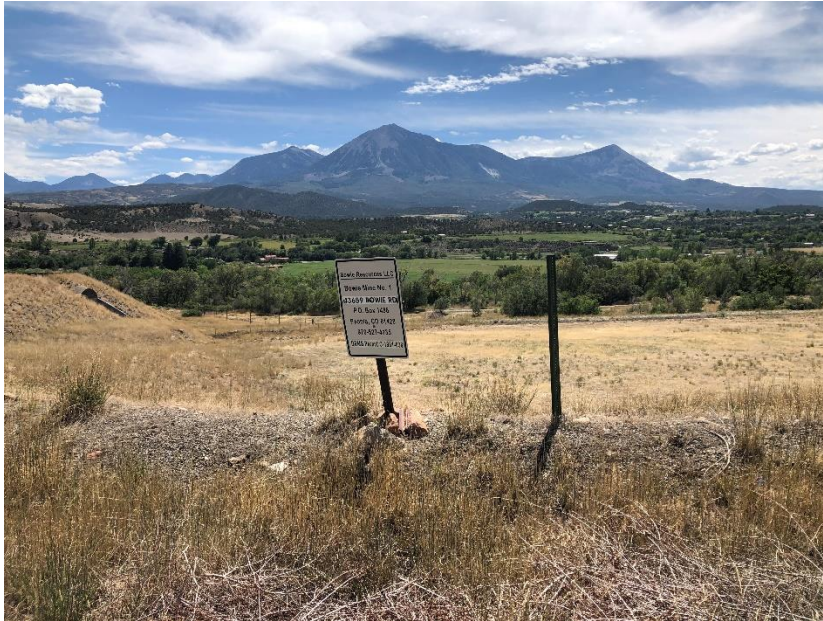
Coal Storage by Highway