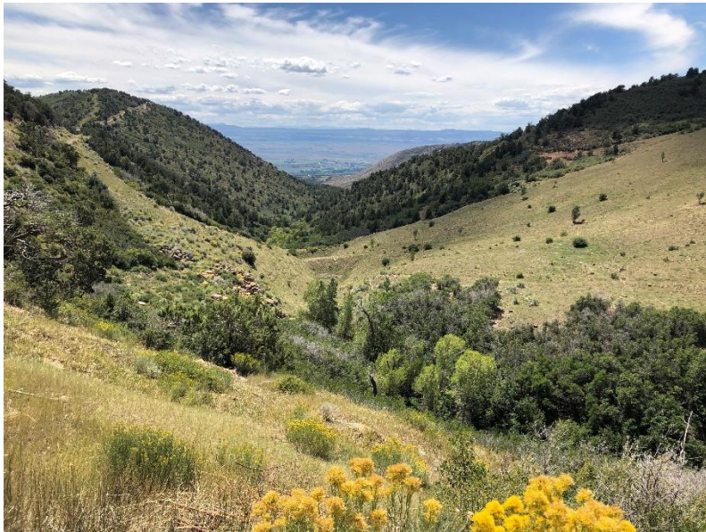
Ponds at West Mine

Number of Partial Inspection this Fiscal Year: 2