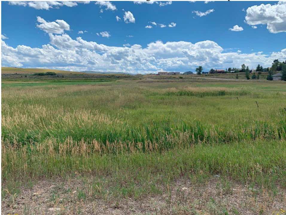
Photo 3 – Area of reclamation between the tailhead parking lot and the City of Hayden sewer line.

Number of Partial Inspection this Fiscal Year: 2