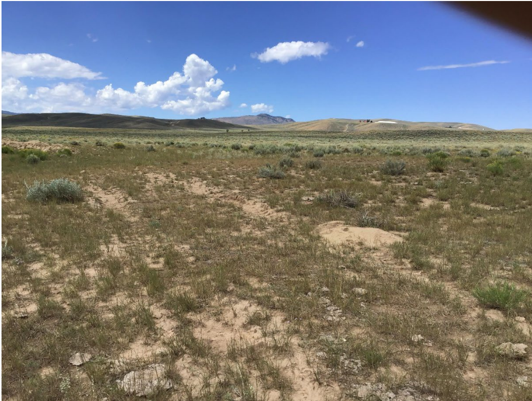
Photo 1: The rangeland ecosystem of the permit and post mining land use comprised of artemisia and various short bunch grasses.