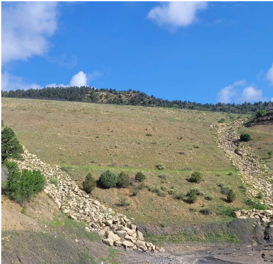
Face of Refuse Disposal Area