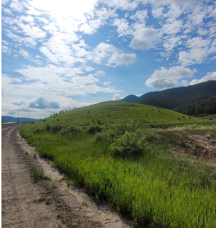
DWDA #1 West Face