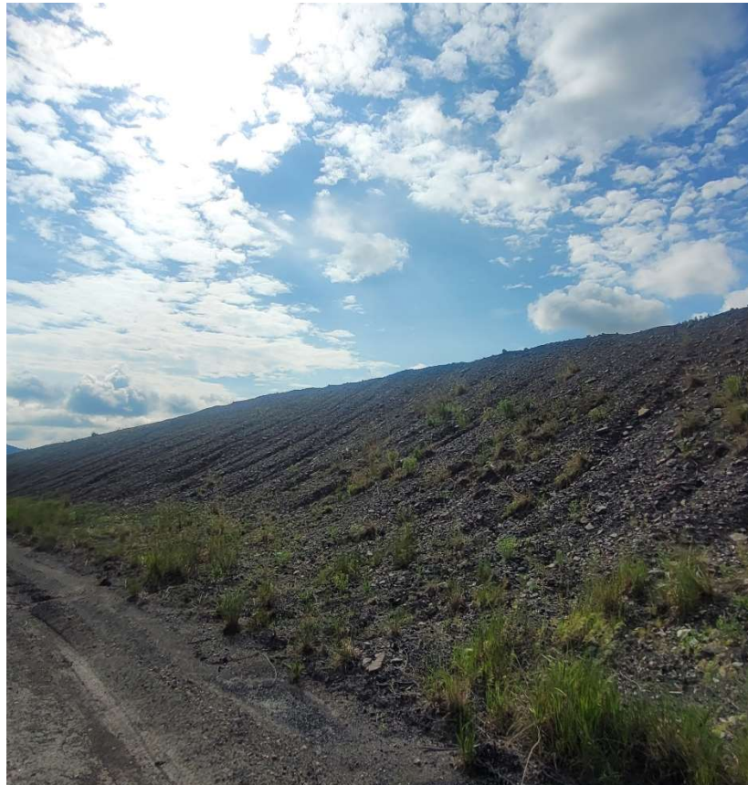
DWDA #2 North Face

Overall the disposal area is in good condition. The ditch around the southern and western toe was cleaned and the banks between the pile and the river buffer area was cleaned and had standard maintenance done to keep water flowing to the sediment pond on the eastern end of pile.