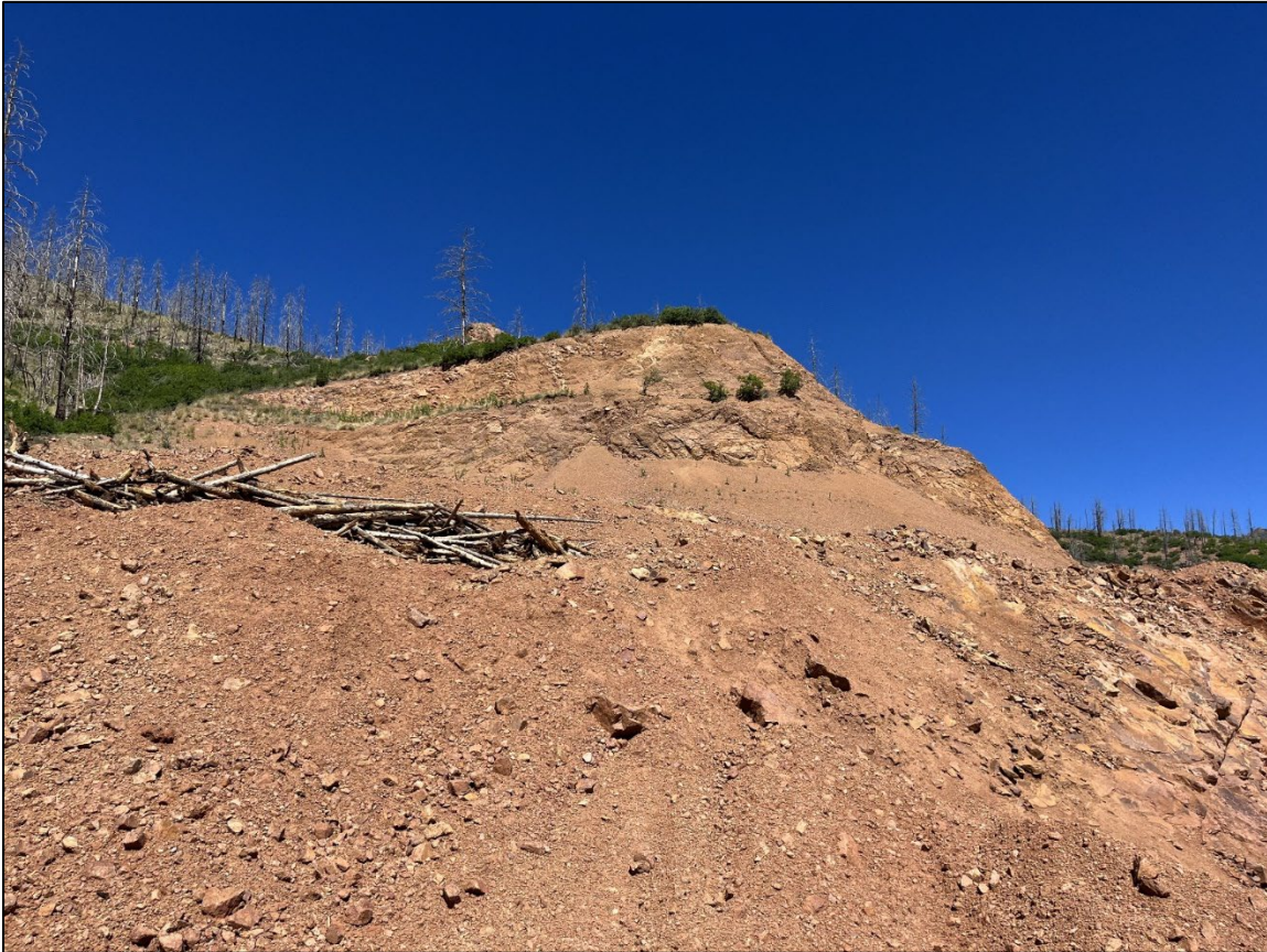
Photo 4: View west of the upper middle peak area, trees will be used as erosion control.