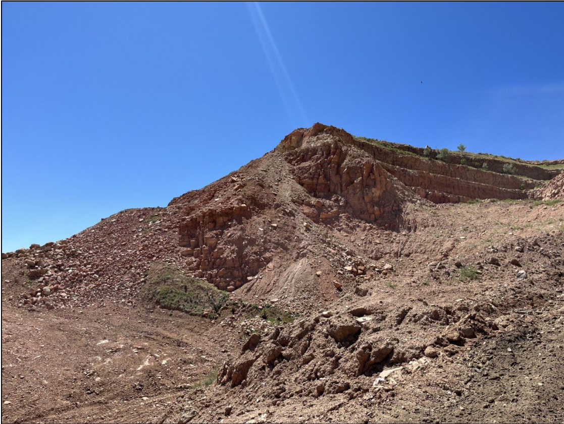
Photo 10: View south of a peak located at the southern end of the permit boundary, this peak will remain and carry a natural drainage channel to a designed plunge pool.