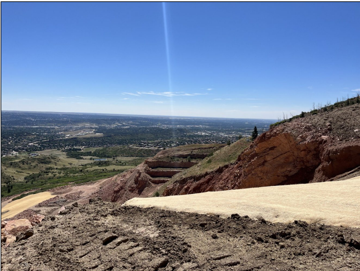
Photo 7: BFR tie-in area and 2H:1V slope above the 7500 prism series.