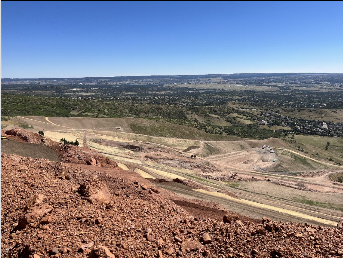
Photo 2: View northeast of shop area, Colorado Springs owned property, and Dragons Back area.