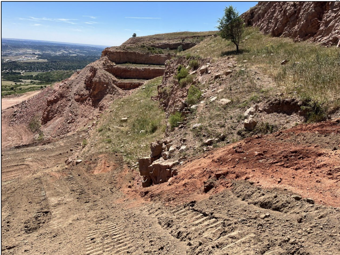
Photo 9: Area of new slope tie-in to old reclamation benches, minimal scaling will be done to improve structural integrity at the edges of this tie in.