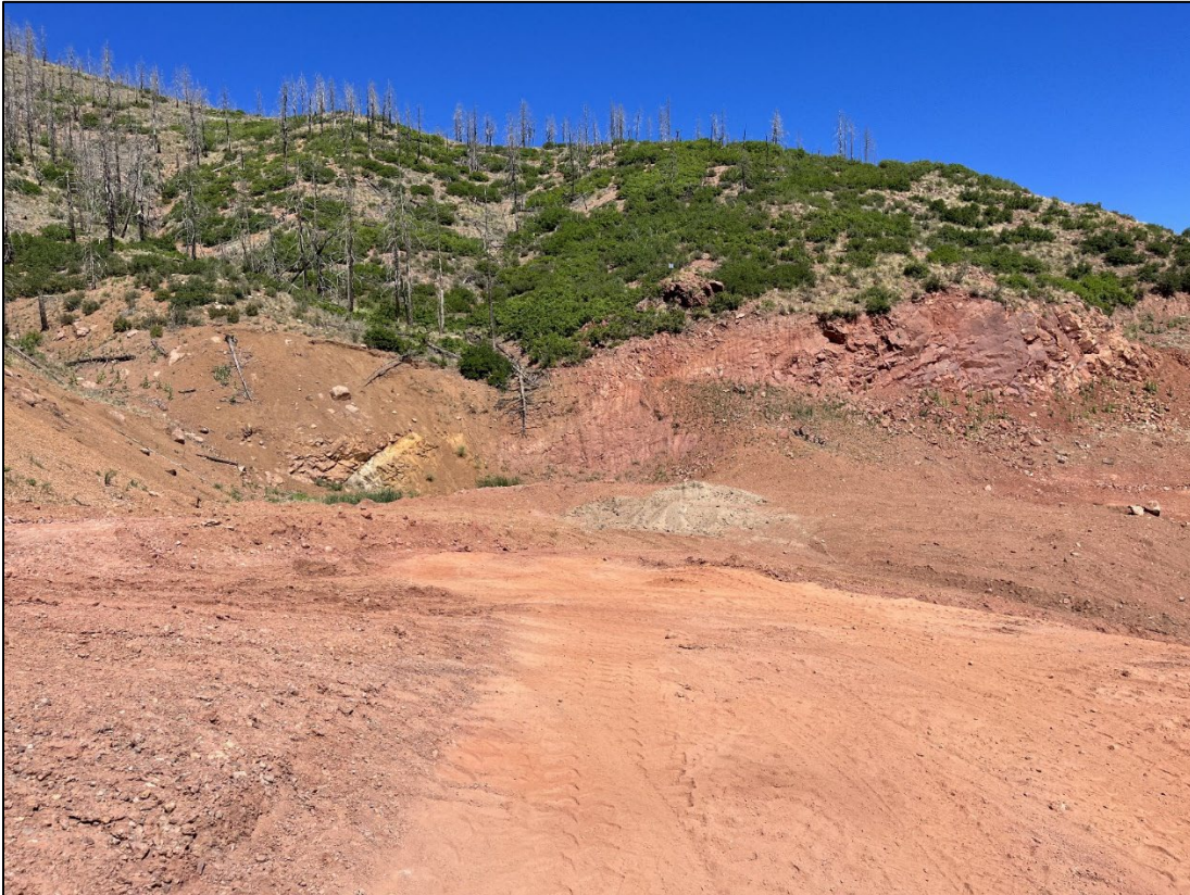
Photo 6: View north of the 'sheep pond' area, if this feature remains it will be moved off Forest Service property.