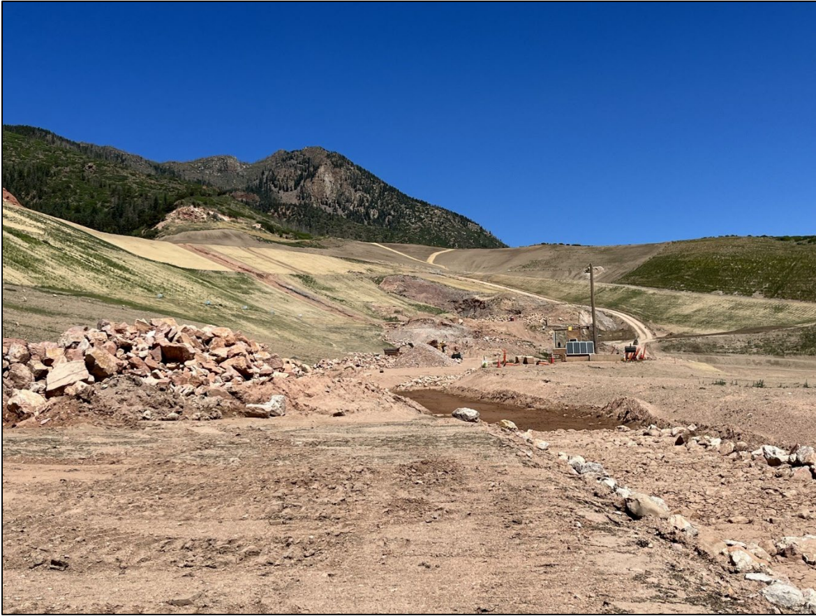
Photo 12: View north of new growth on matted slopes on both City and private property.

Jerry Schnabel Riverbend Industries Inc. 425 South Financial Place , Suite 3100 Chicago, IL 60605