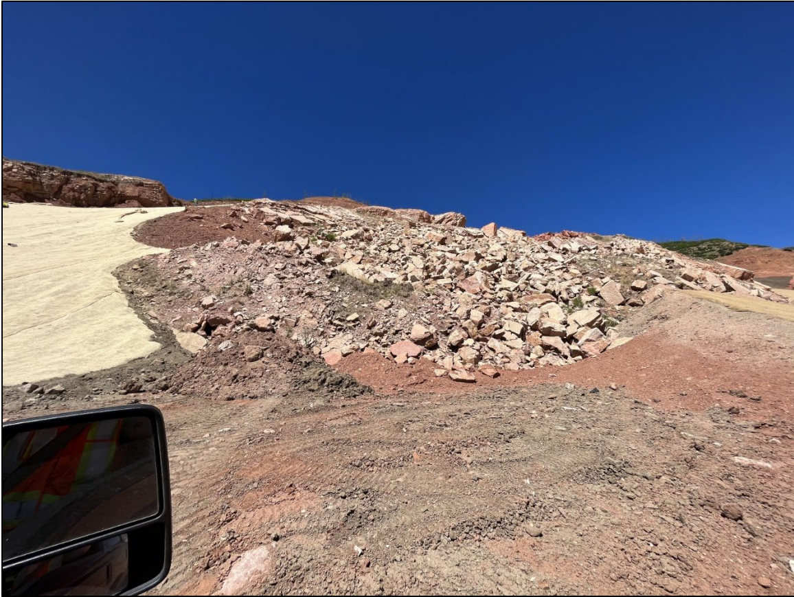
Photo 8: View of the bottom buttress for the BFR area, material will continue to be added to buttress this large rock feature.