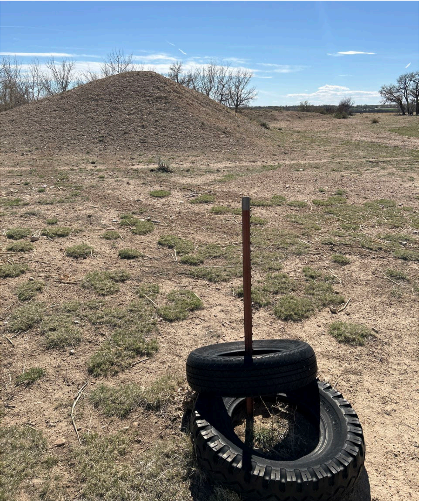
Figure 5: 257