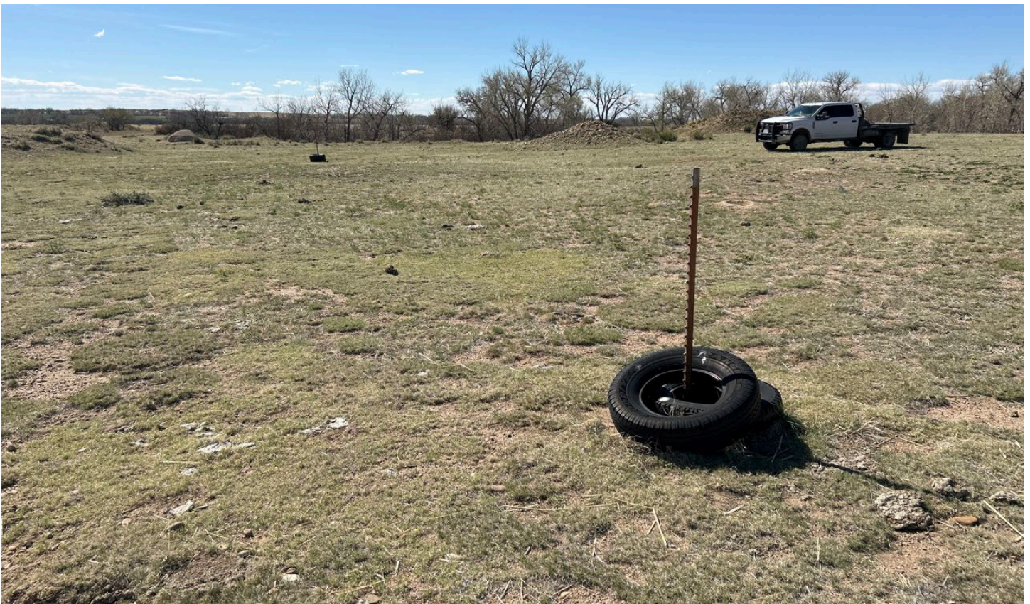
Figure 3: Typical permit boundary marker (260)