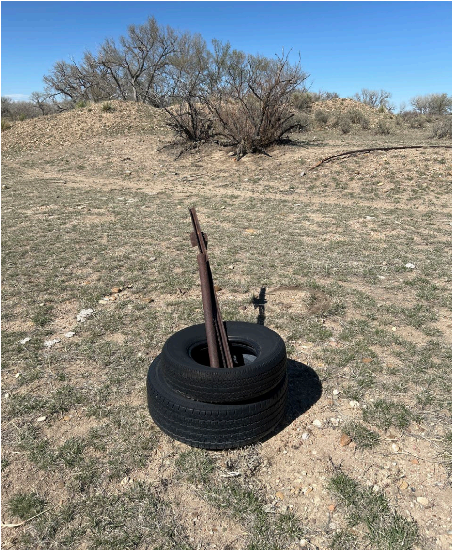
Figure 4: 255