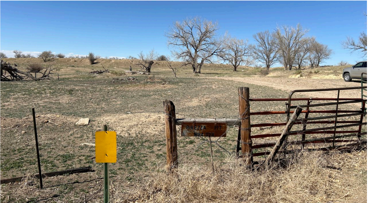
Figure 2: Mine ID sign (254)