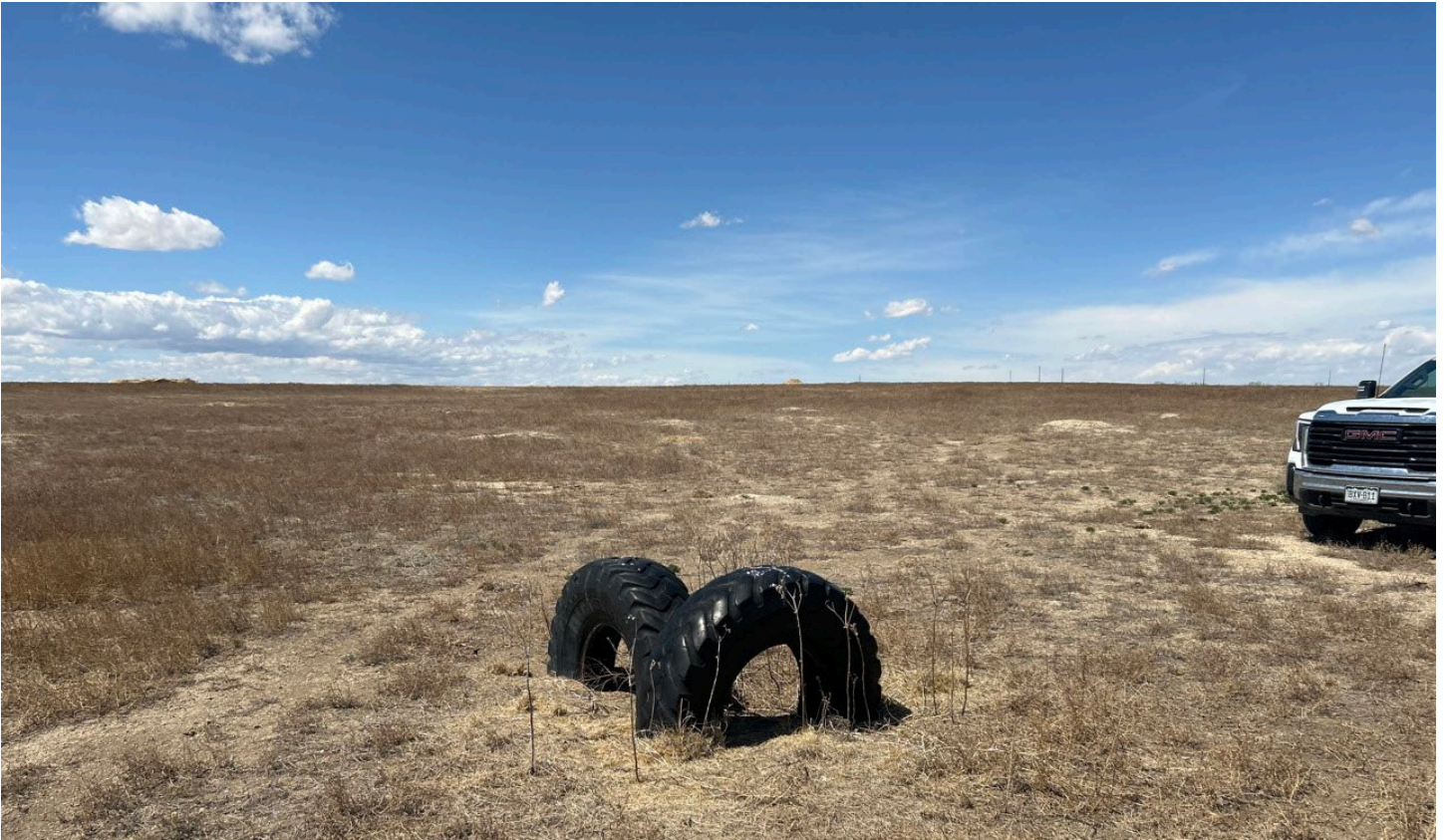
Figure 2: Typical boundary marker (211)