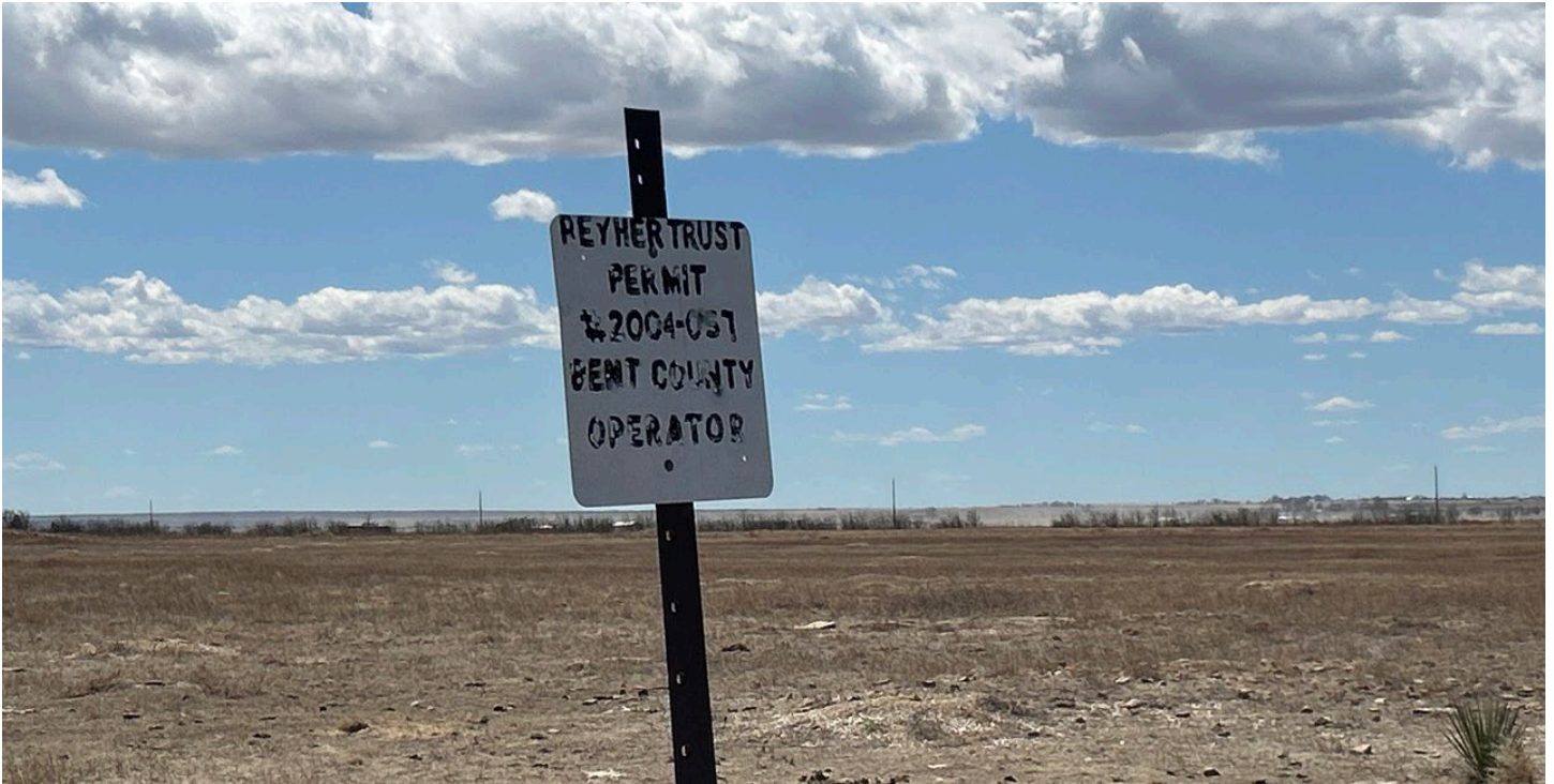
Figure 4: Mine ID sign (215)