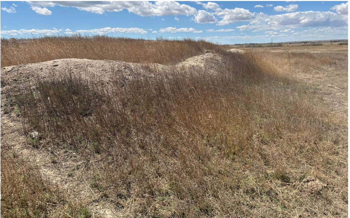
Figure 5: Stockpiled topsoil