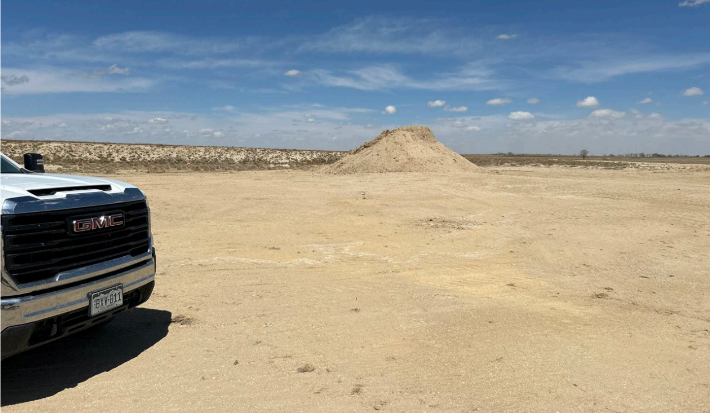
Figure 3: Stockpiled material (214)