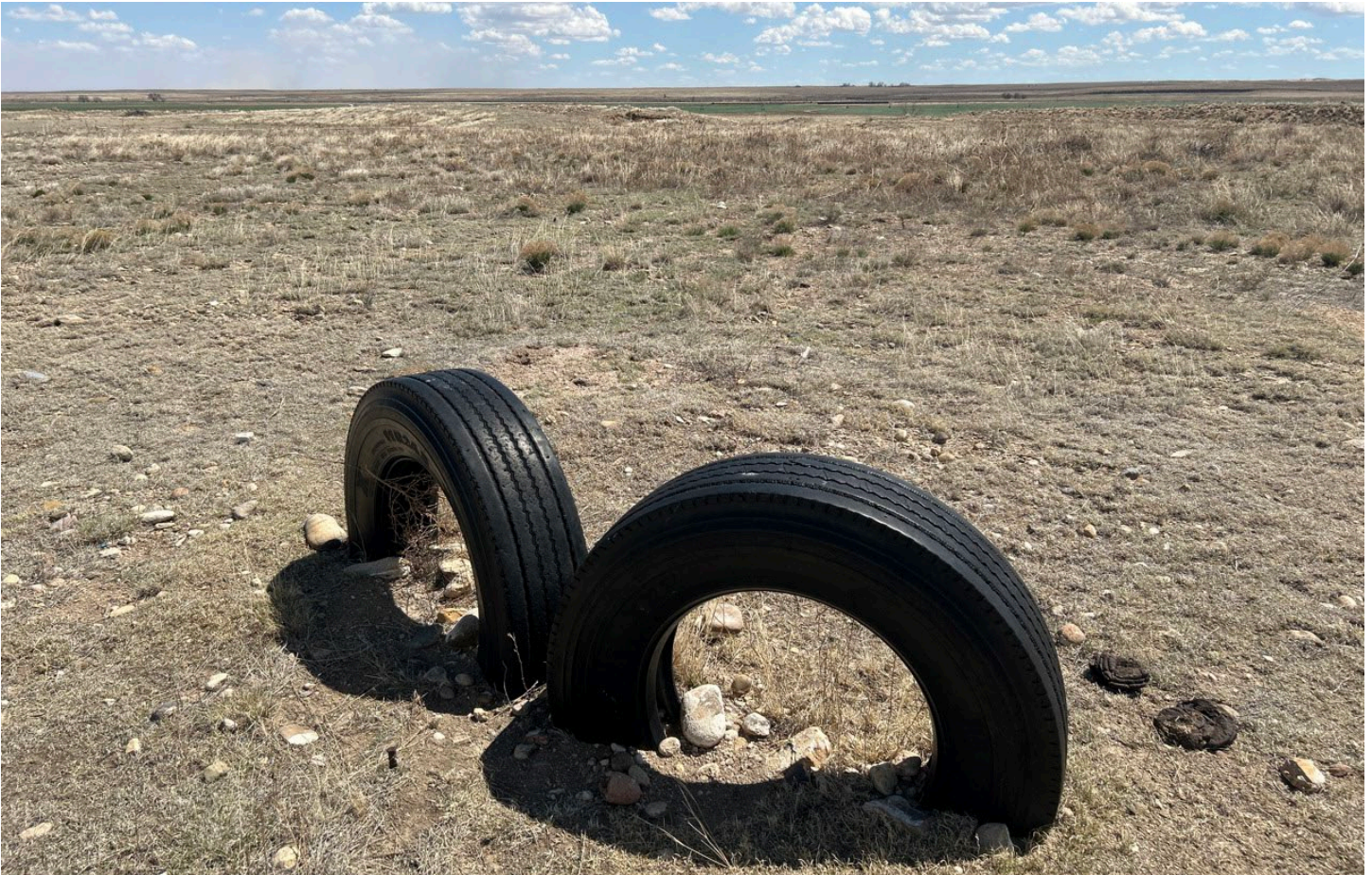
Figure 3: Typical boundary marker (217)