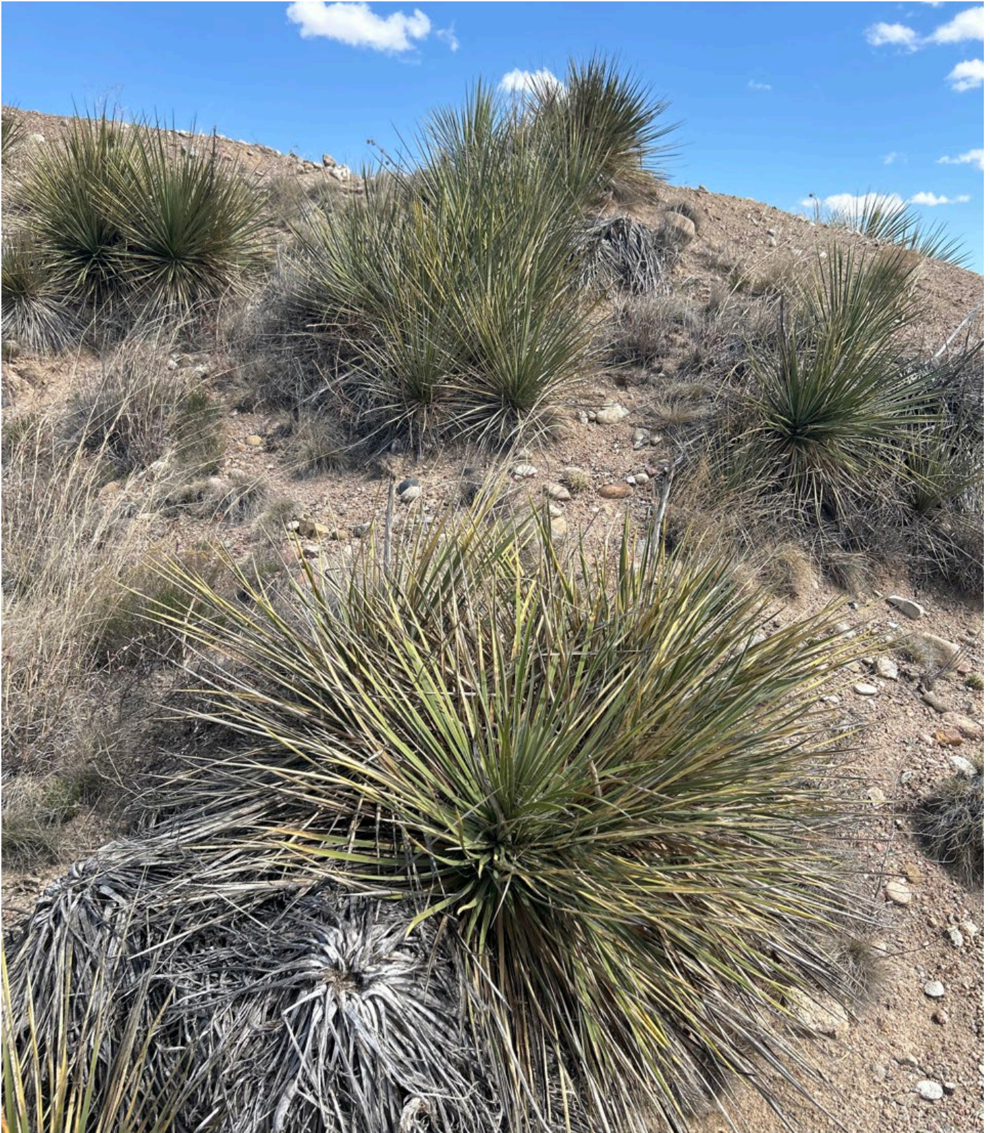
Figure 7: Diverse vegetation on topsoil stockpile