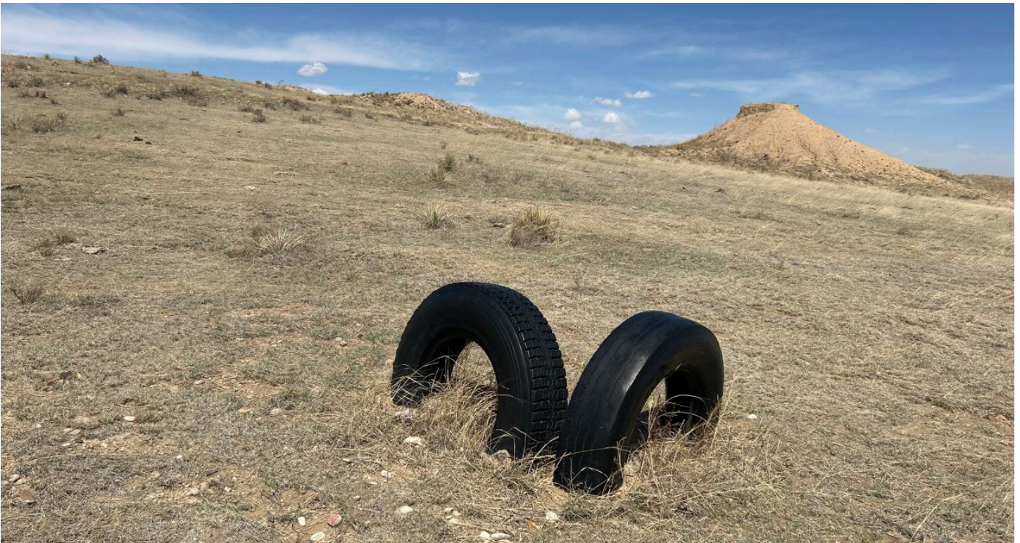
Figure 4: View from south-west corner of permit area, with stockpiled sand