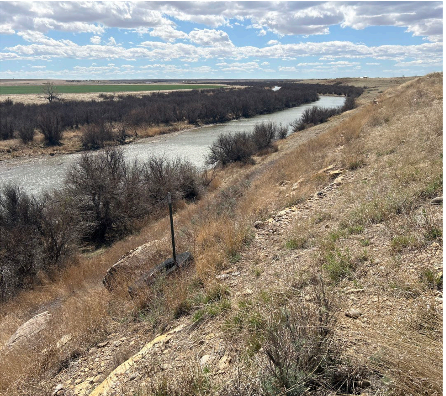
Figure 5: Southern edge of permit area and Arkansas River (221)