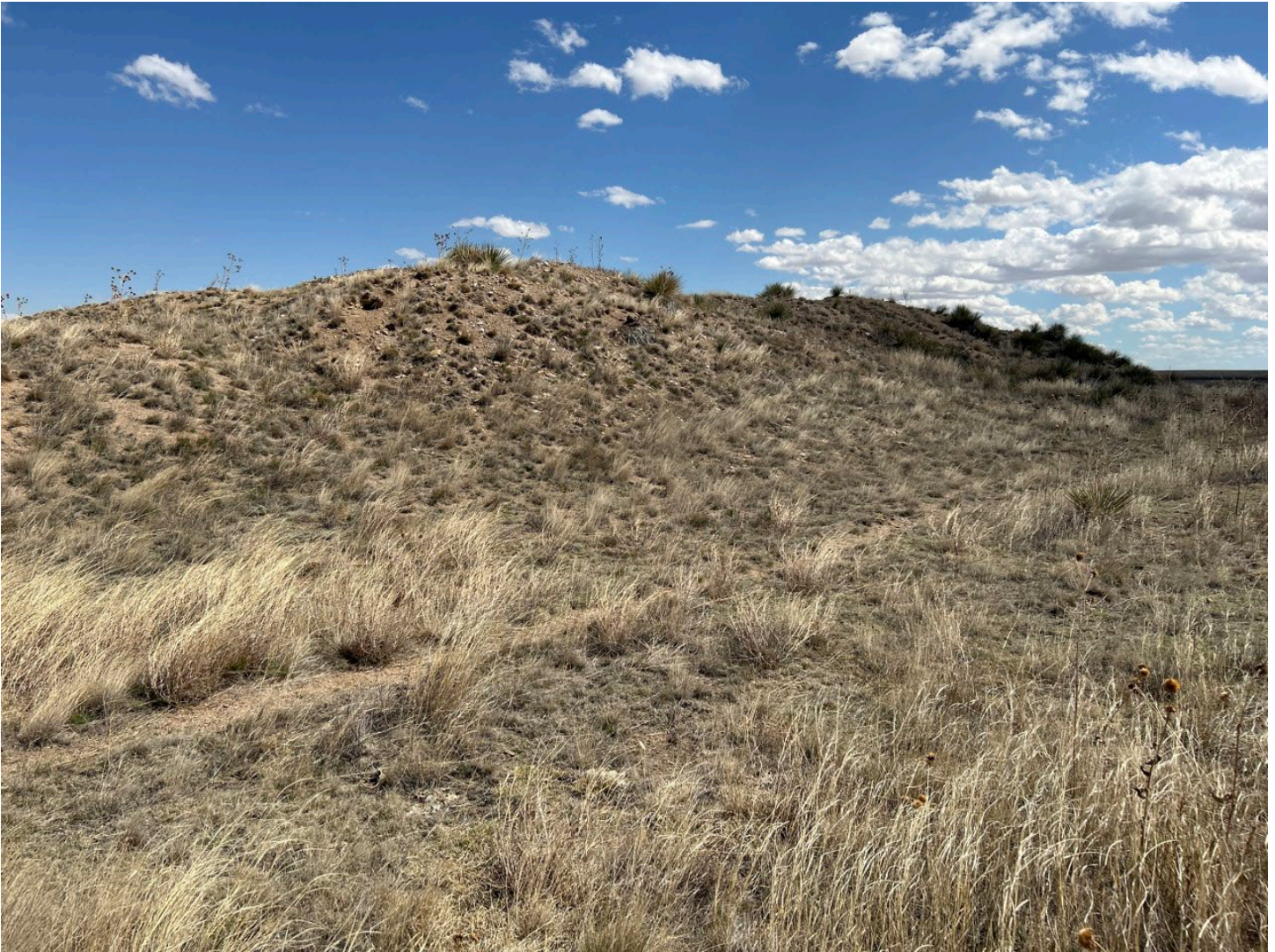
Figure 6: Stockpiled topsoil