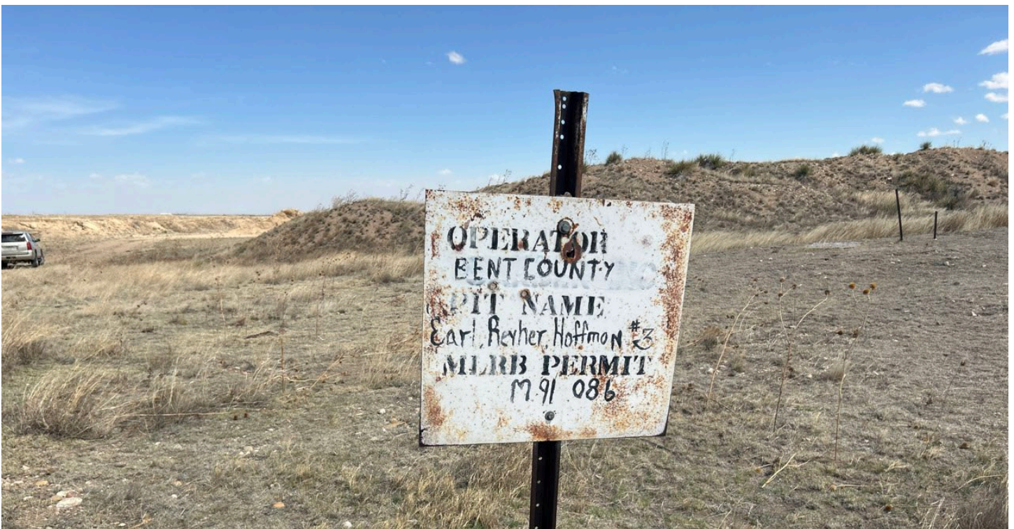
Figure 2: Mine ID sign (223)