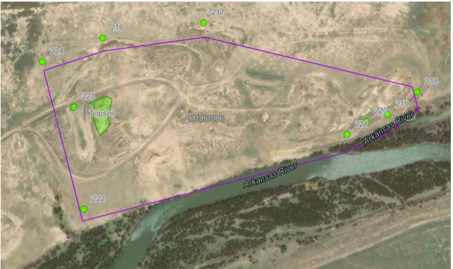
Figure 1: Screenshot of inspection map, showing approximate permit boundary in purple and inspection features in green