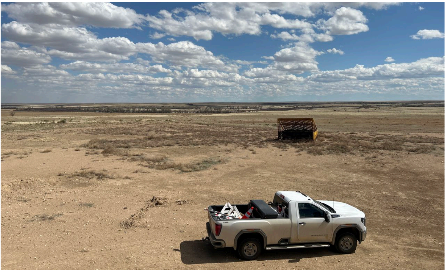
Figure 3: View of site to the south-east (203)