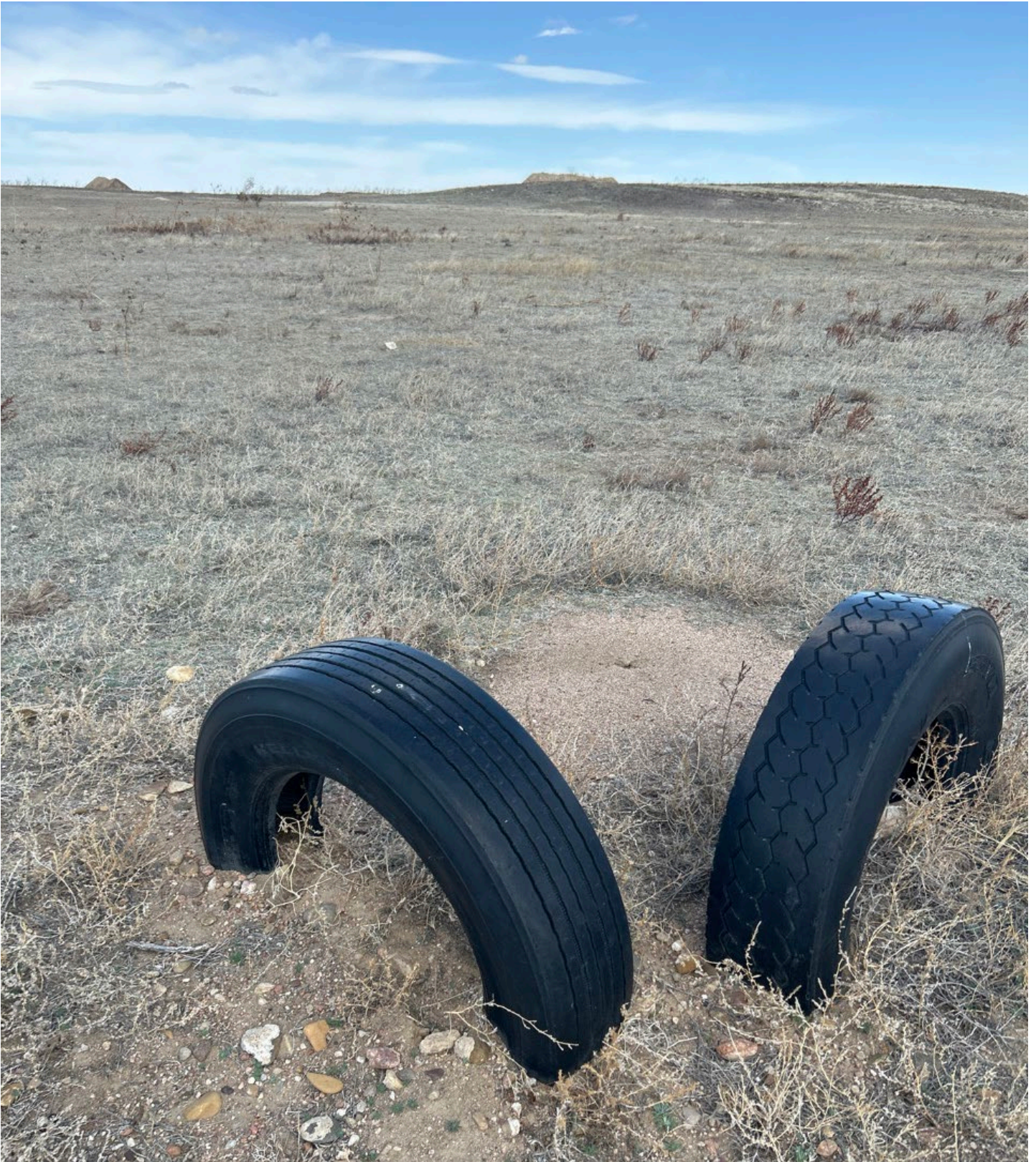
Figure 4: Typical corner marker (201)