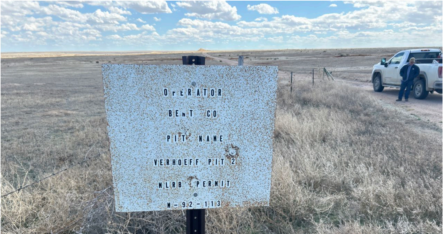
Figure 2: Mine ID sign (198)