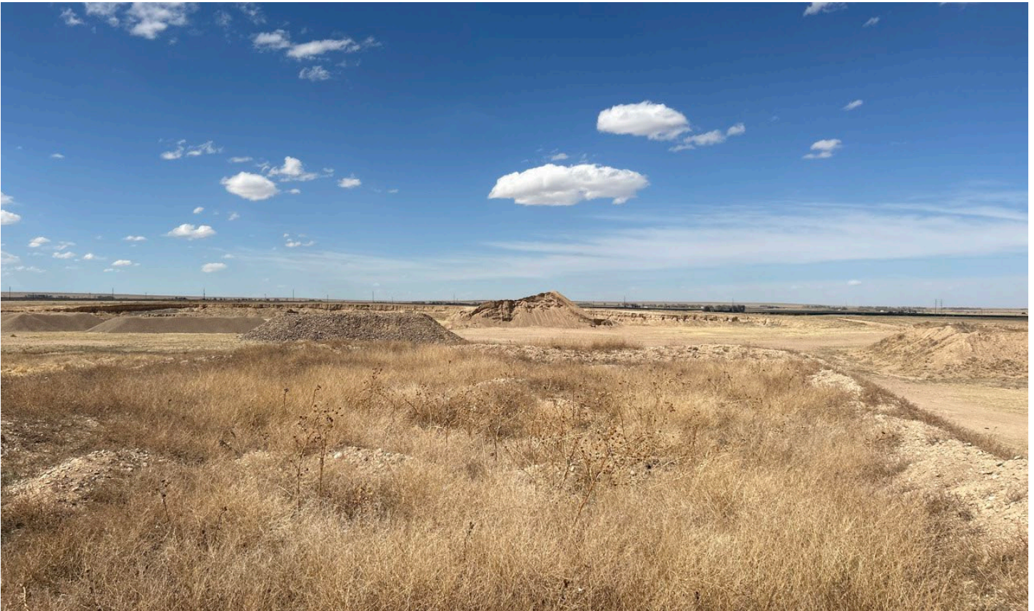
Figure 6: Stockpiled material (203)