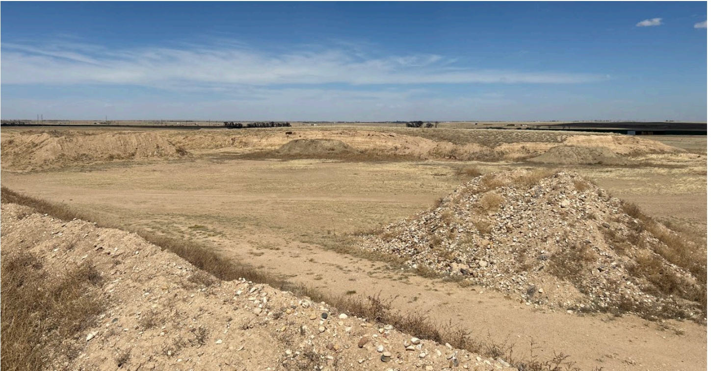
Figure 5: Stockpiled topsoil and overburden (203)