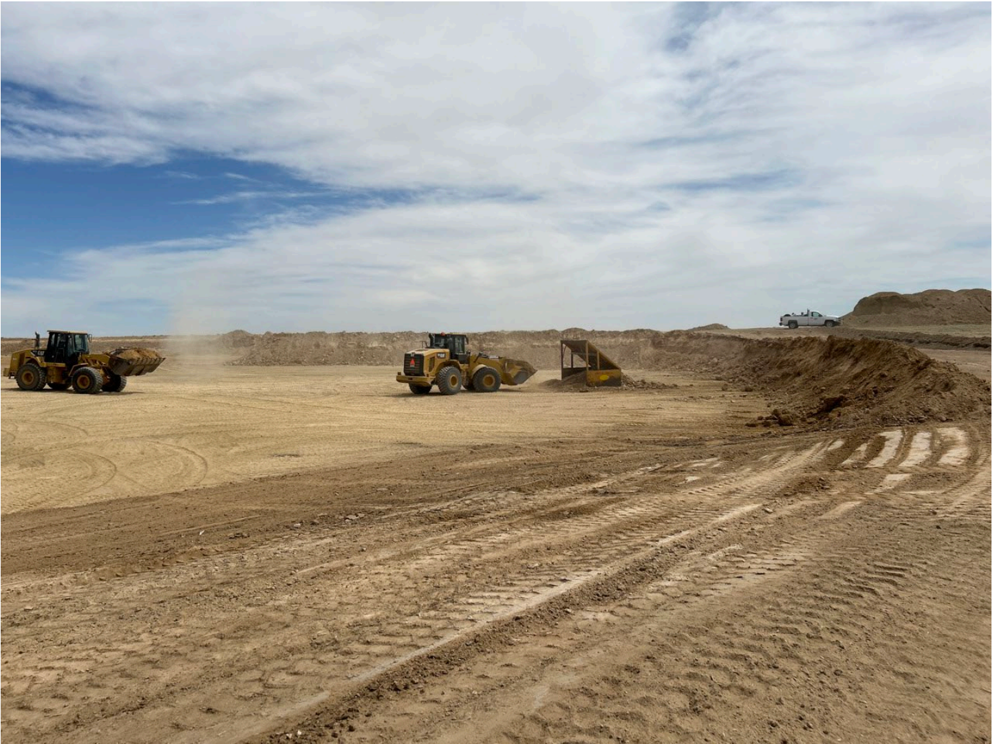
Figure 5: Screening in progress, with recently graded slope in foreground (241)