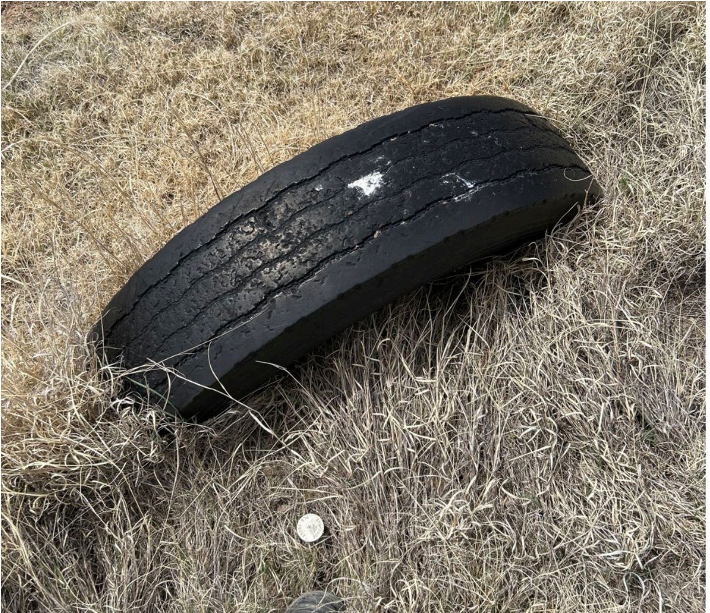
Figure 2: Typical permit boundary corner marker (236)