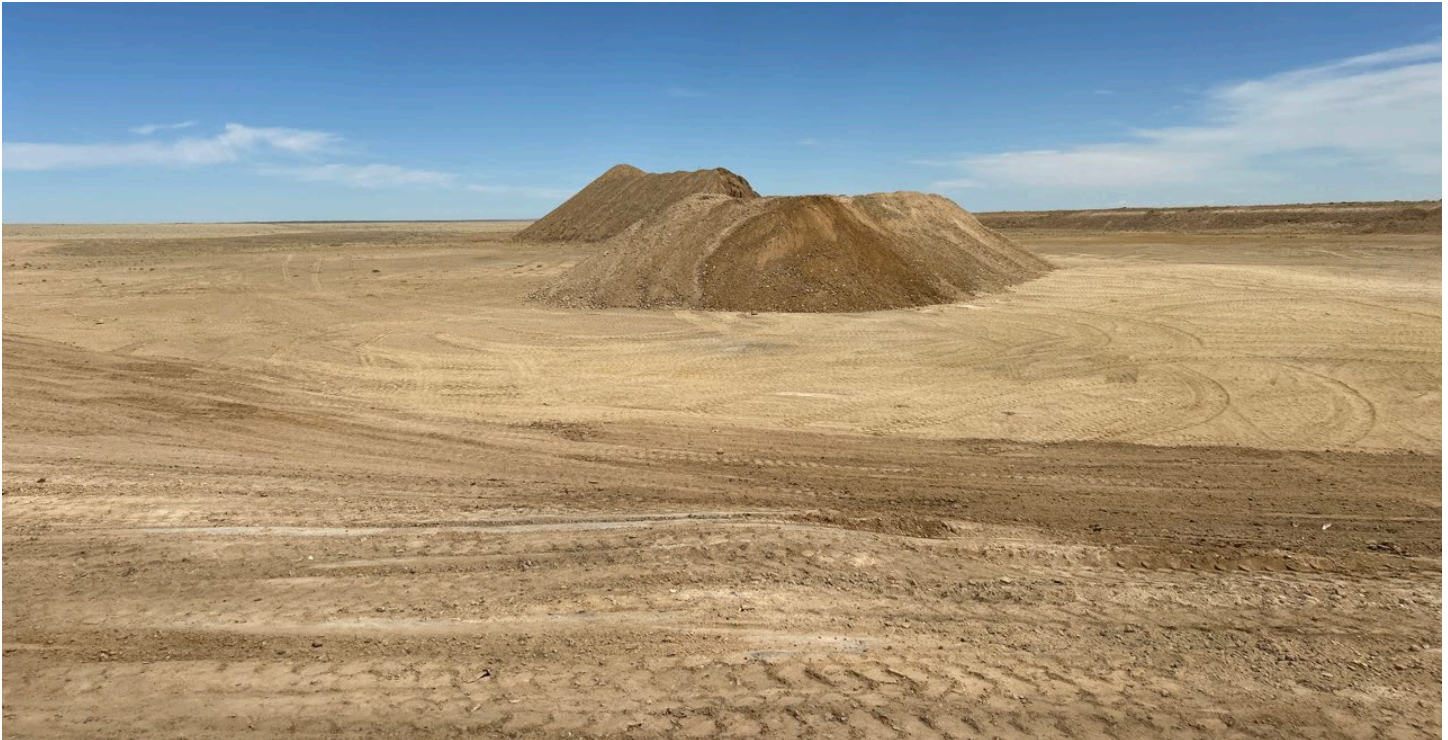
Figure 4: Stockpiled material with regraded slope in foreground (241)