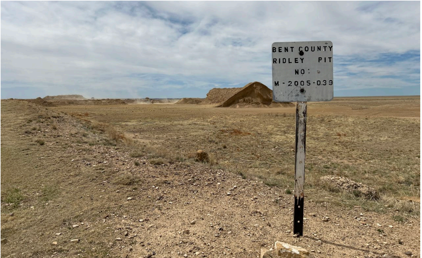
Figure 3: Mine ID sign, with stockpile material behind (240)