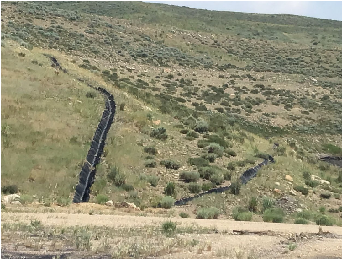
Photo 2: “Smart” ditches at the portal, conveying water to Pond 2.

Number of Complete Inspections this Fiscal Year: 1