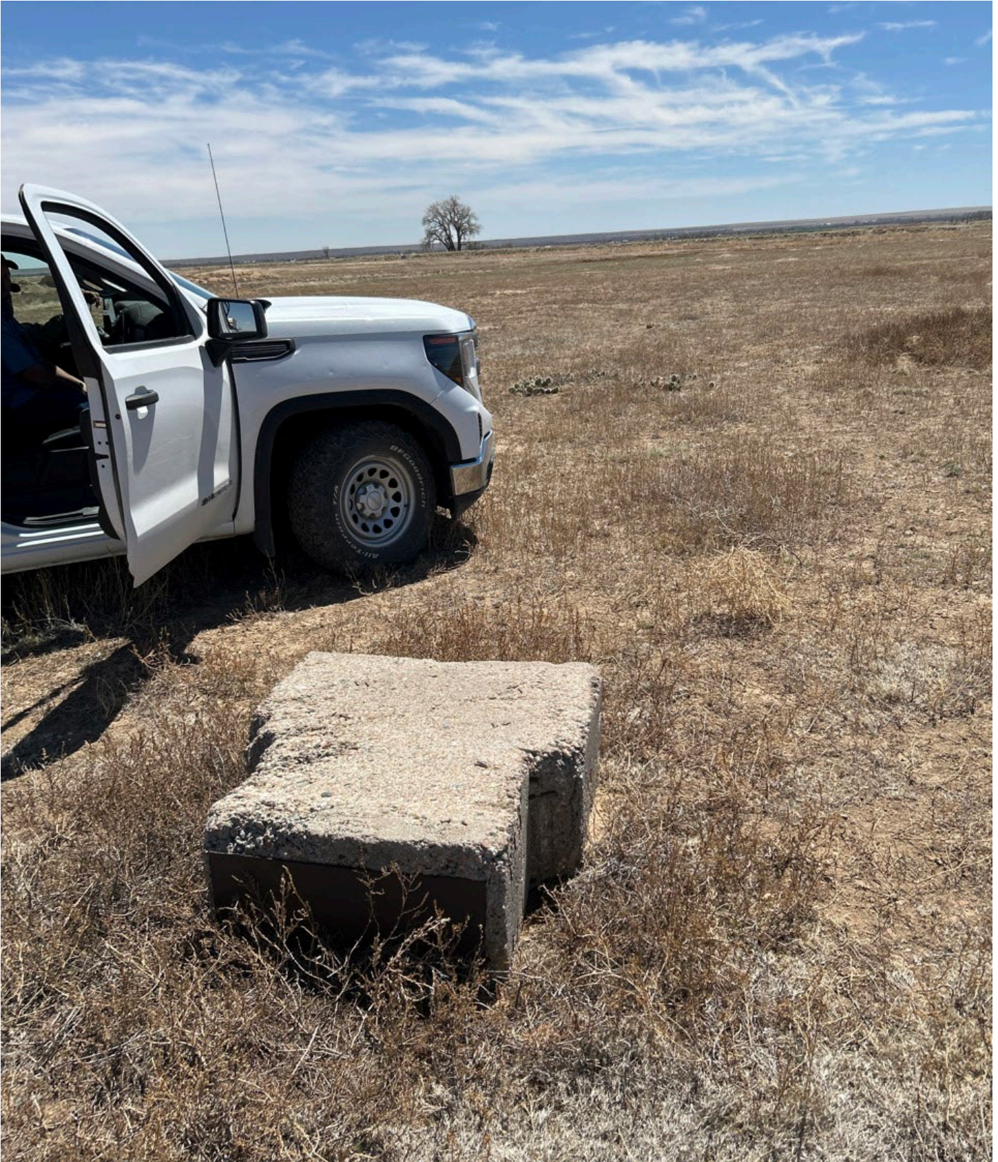
Figure 4: NW corner of permit area, showing heavily grazed vegetation (245)