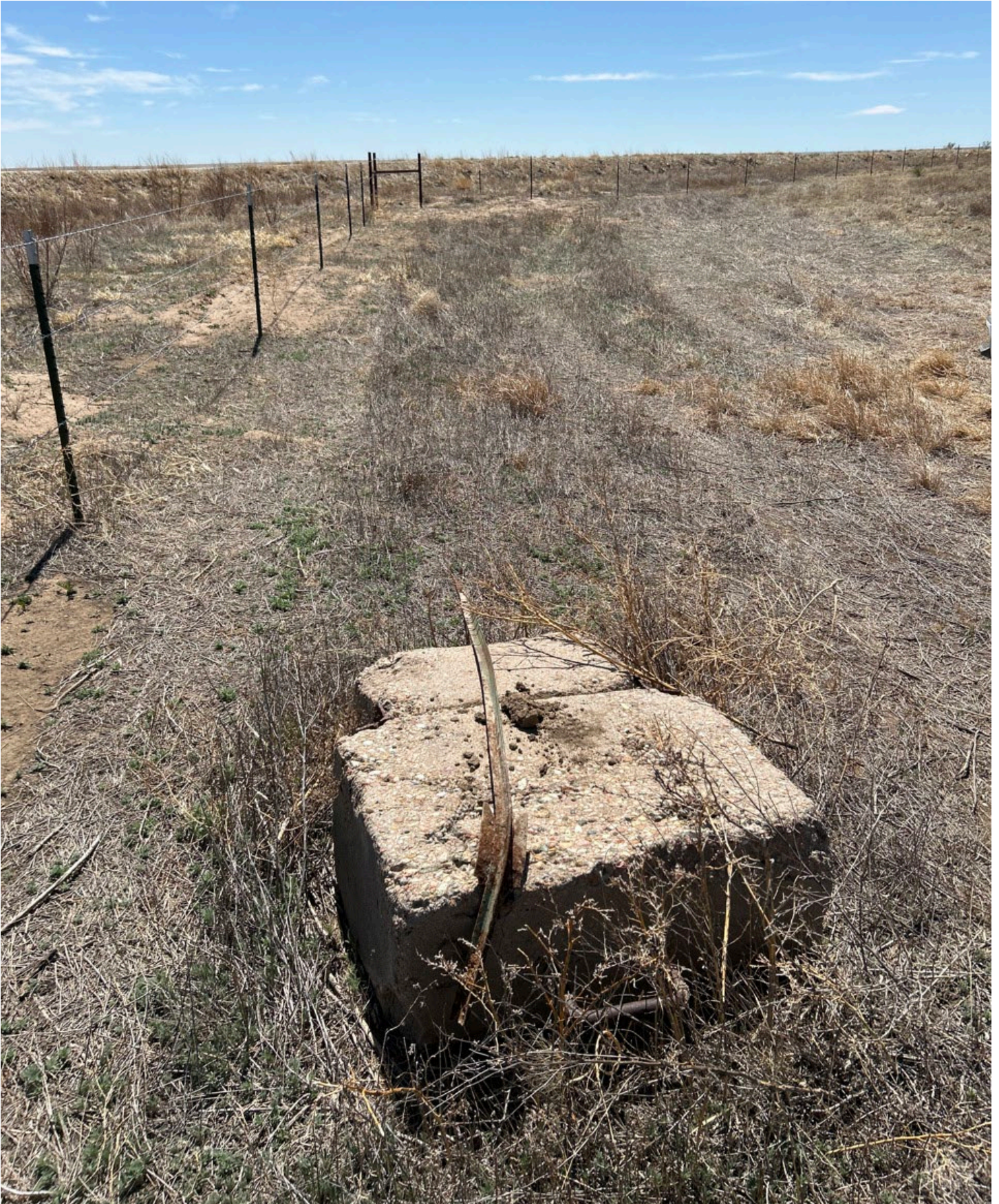
Figure 6: SE corner of permit area, with recently installed landowner fence (247)