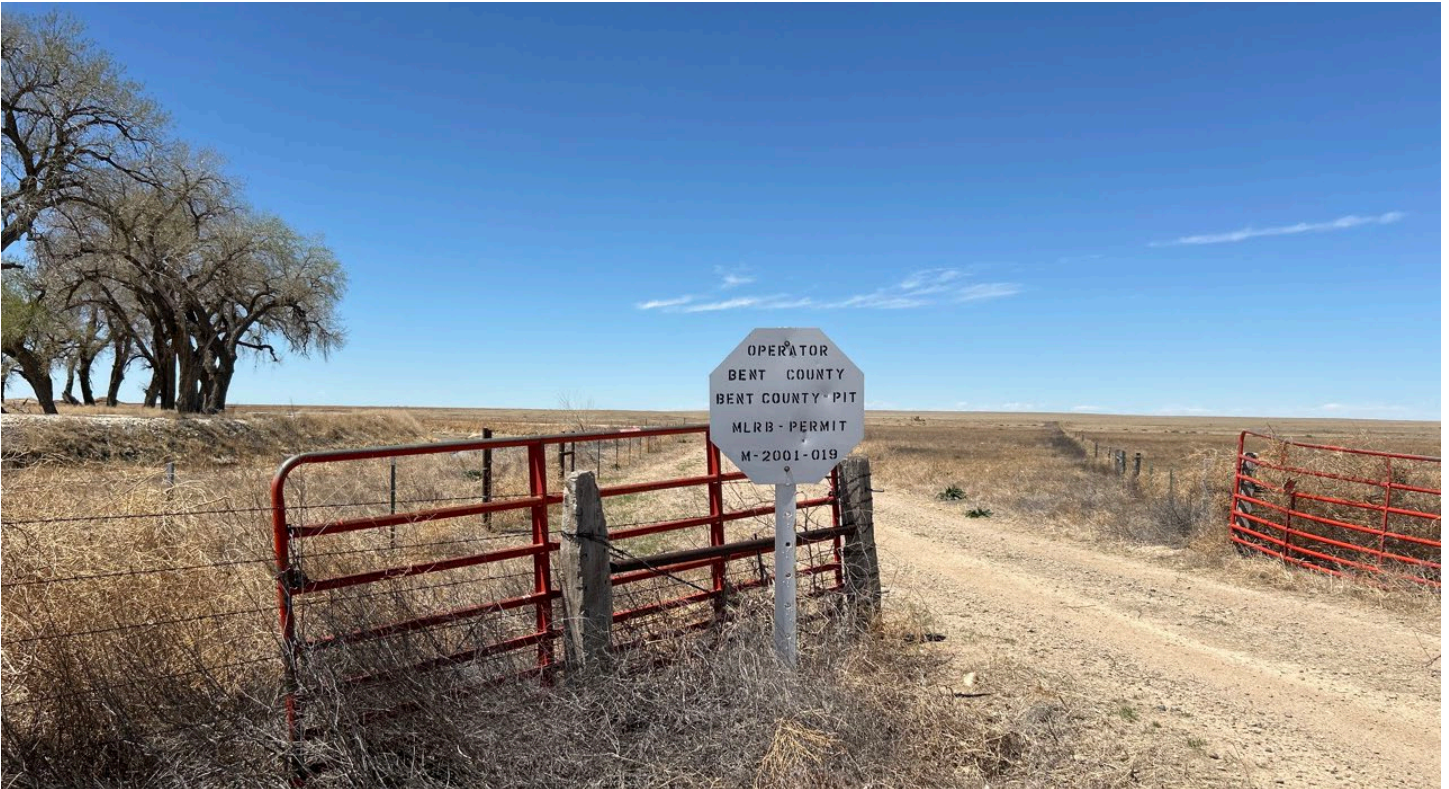
Figure 2: Mine ID sign (243)