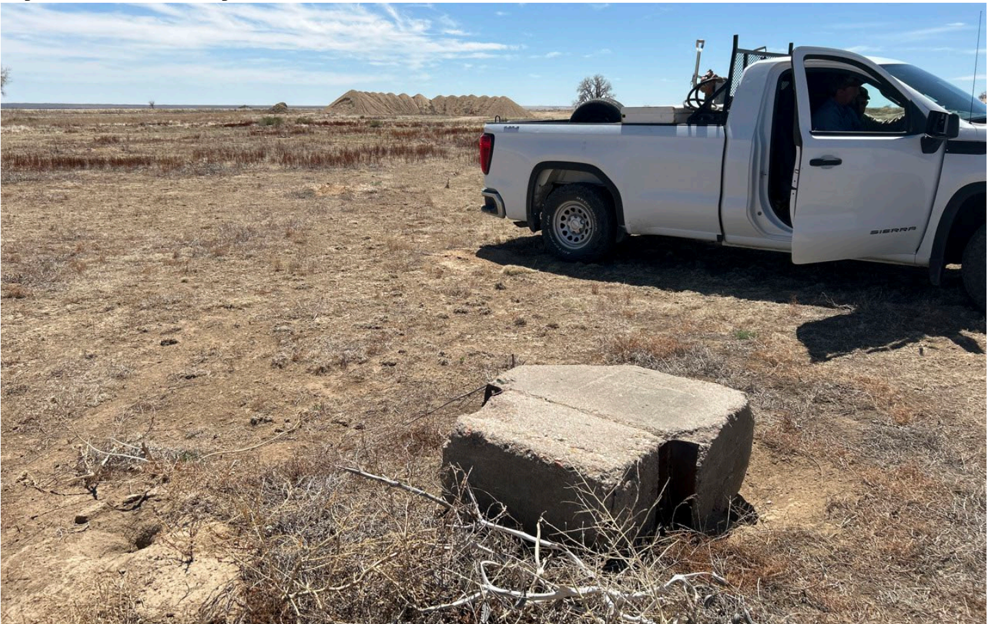
Figure 3: NE corner of permit area, with stockpiled material visible (244)