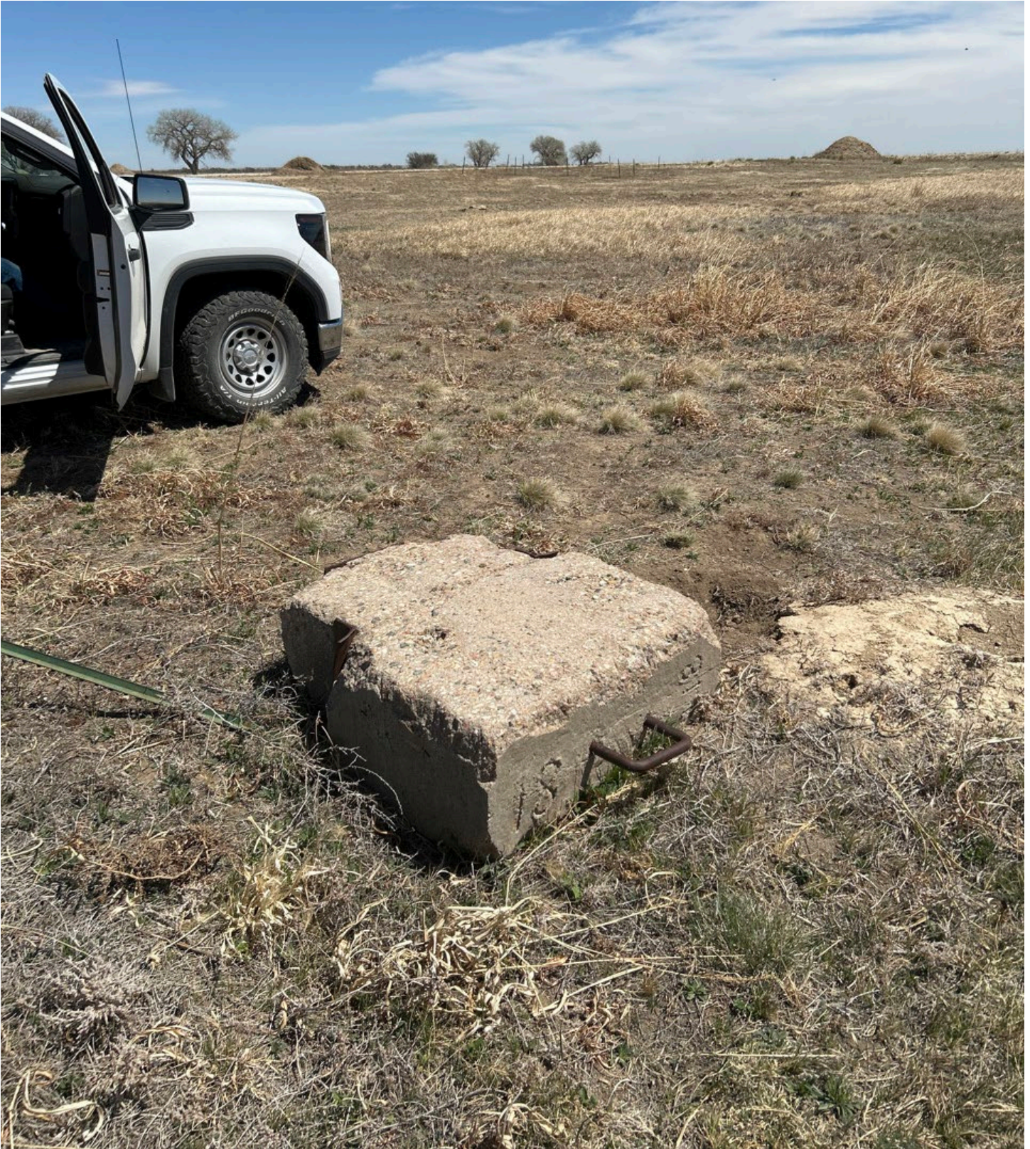
Figure 5: SW corner of permit area, stockpiles visible (246)