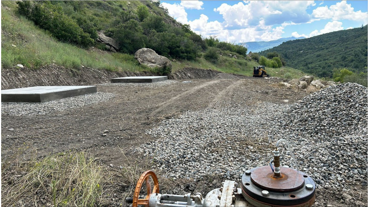
Figure 1: Concrete pads for "Elk Creek West" methane destruction facility in Hubbard Creek drainage

Number of Partial Inspection this Fiscal Year: 1