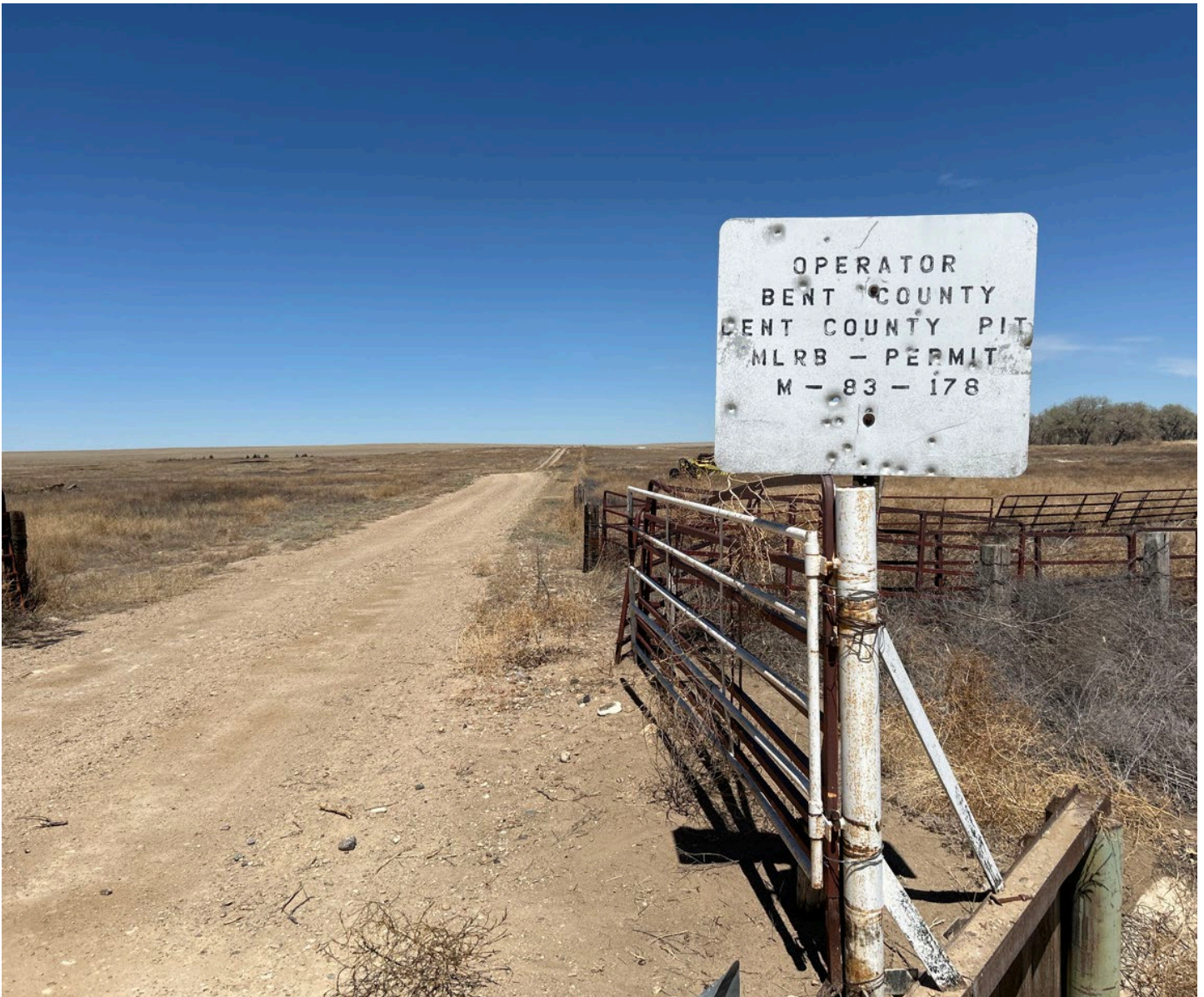
Figure 1: Mine ID sign, with reclaimed Bent County Pit beyond