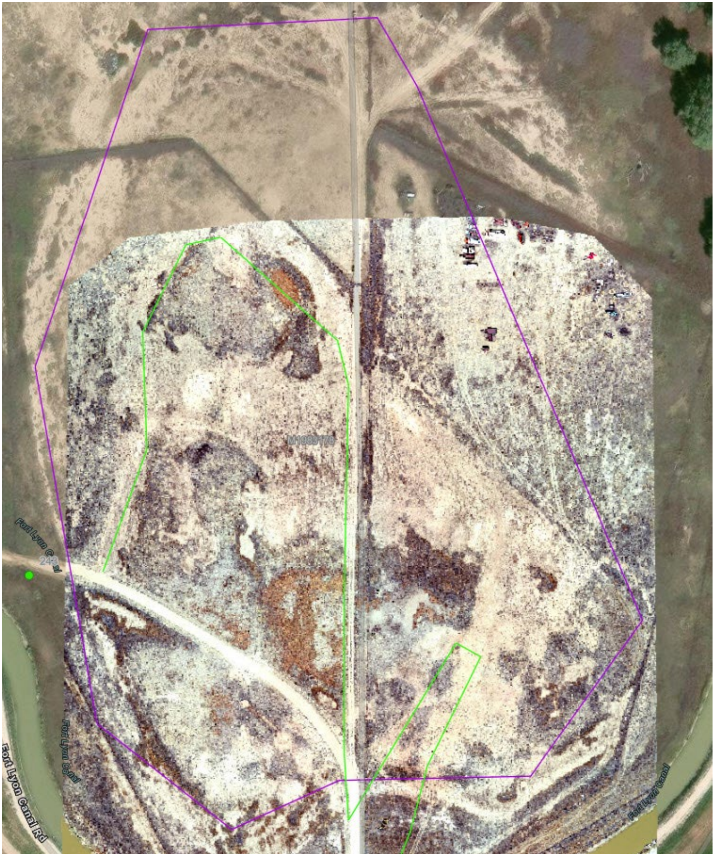
Figure 2: Screenshot of Inspection map, with orthomosaic overlaid on basemap and approximate permit boundary (purple) and inspection features (green)