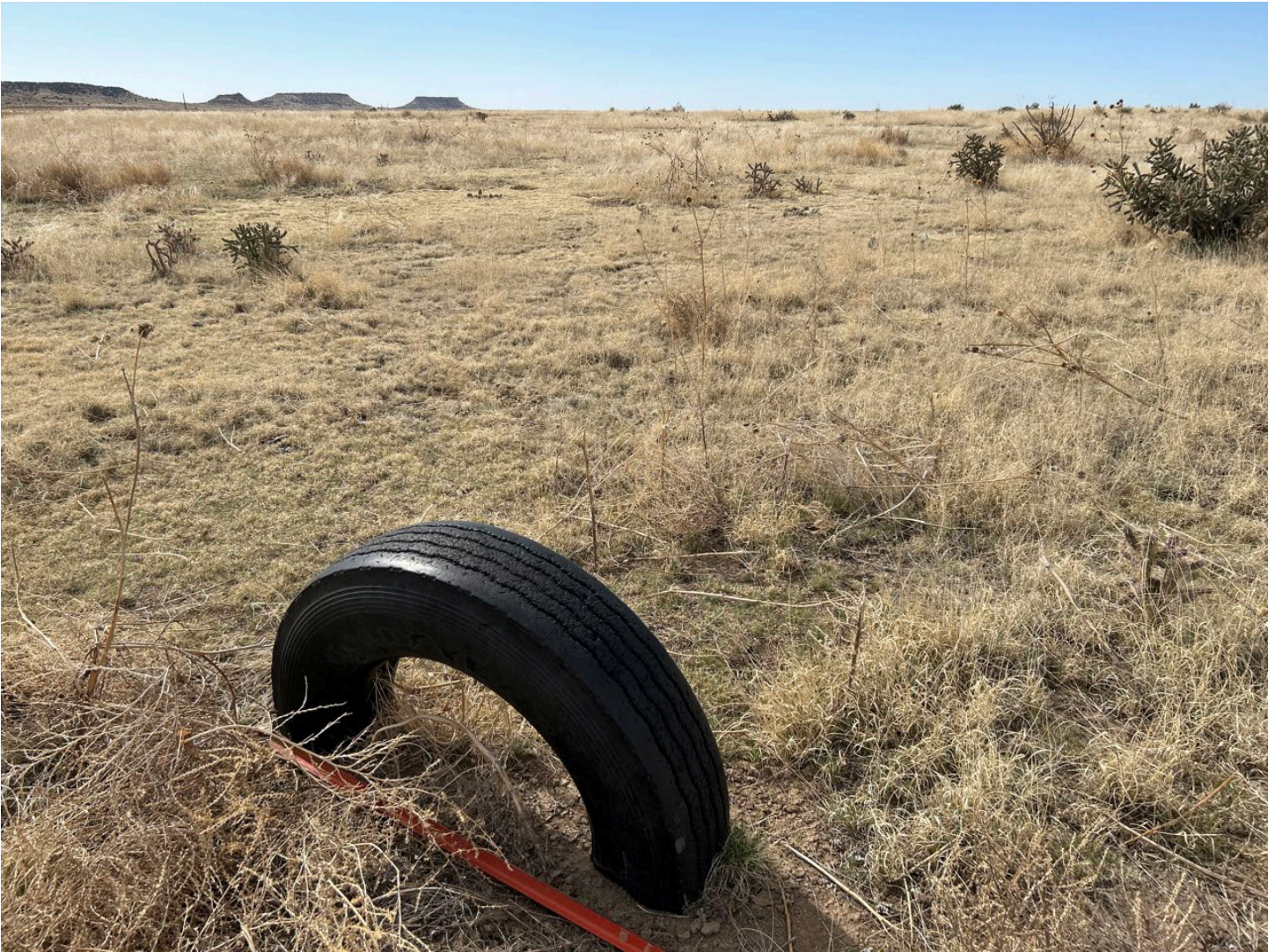
Figure 3: NW permit boundary marker, (264)