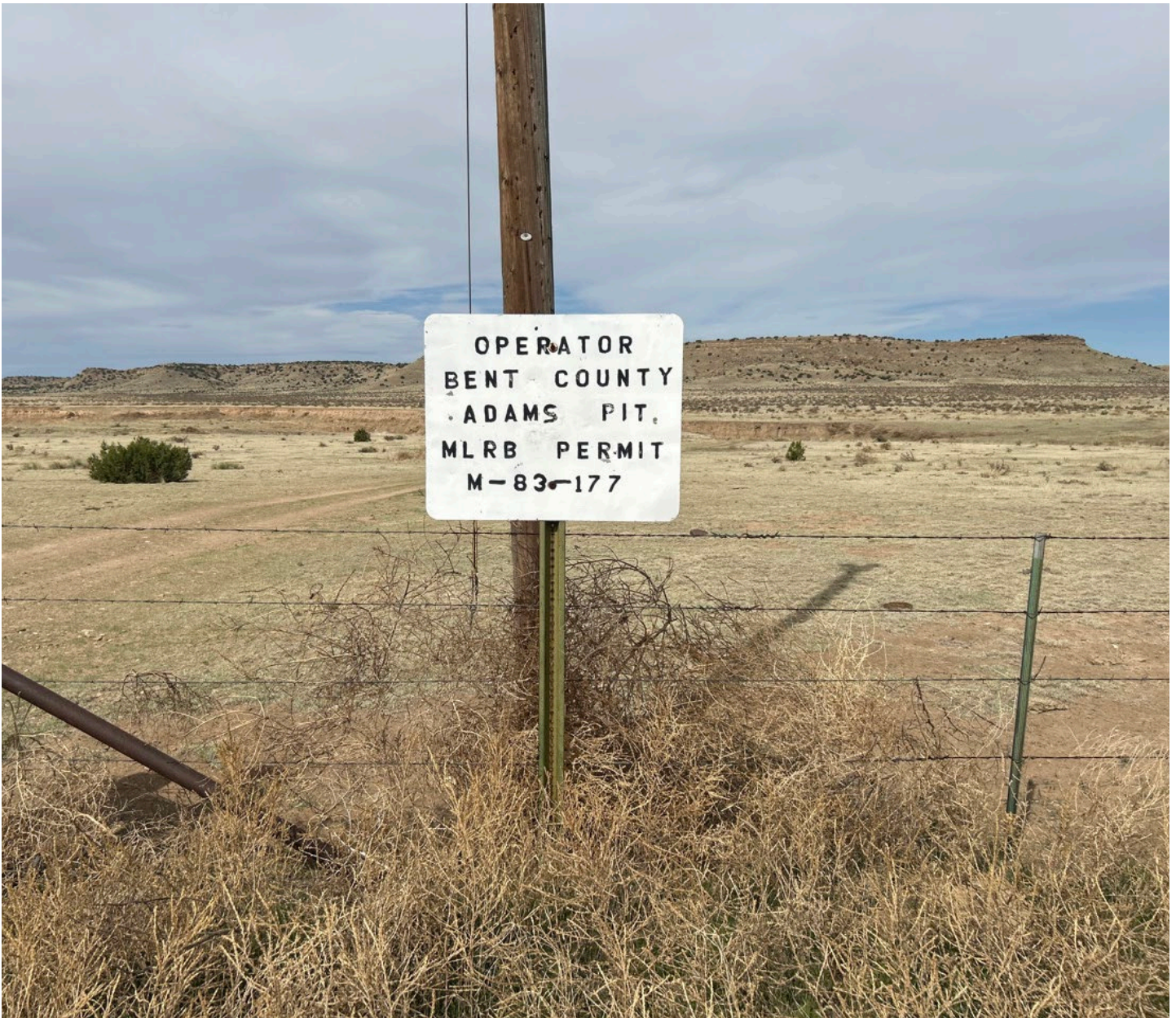
Figure 2: Mine ID sign, (265)