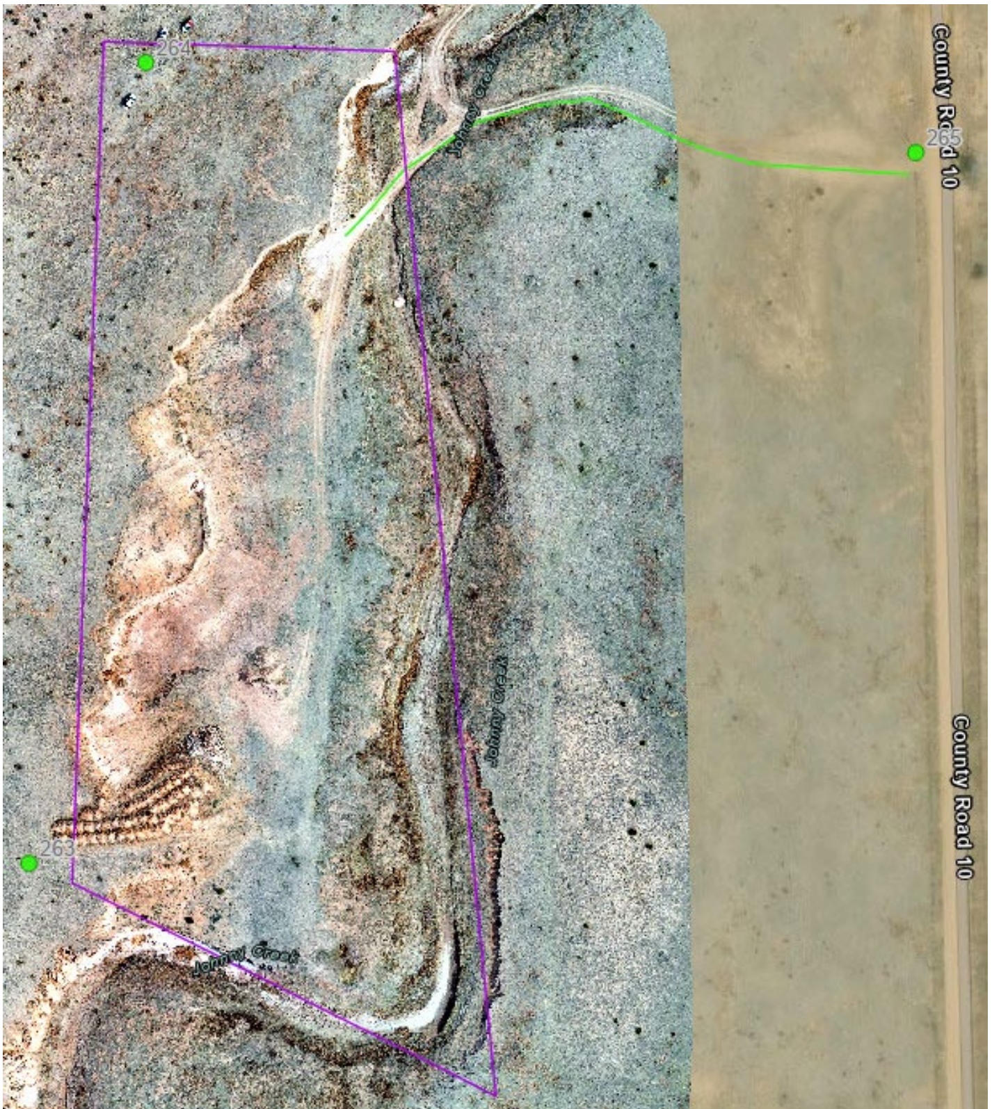
Figure 1: Screenshot of inspection map, with orthomosaic