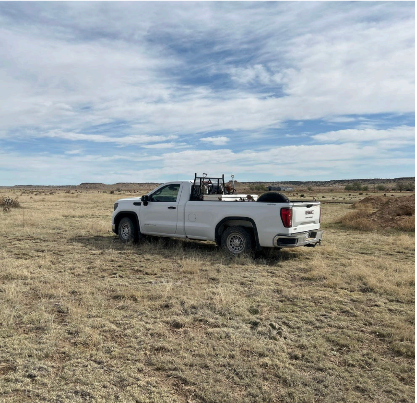
Figure 4: Stockpiled material (on right of frame) from SW permit boundary marker, (263)

Robert Darnell, Kevin Van Egmond Bent County P.O. Box 350 Las Animas, CO 81054