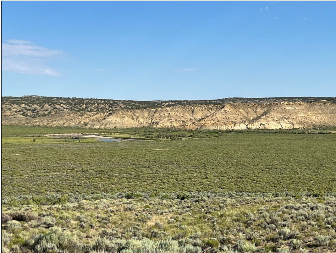
Photo 2: Partially reclaimed pads are located in various areas, both near and far from the main road.