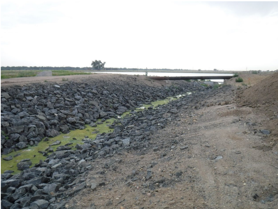
Photo 6: Inflow ditch, from Plumb Ditch, to reservoir. Metal pipe across ditch is for discharge.