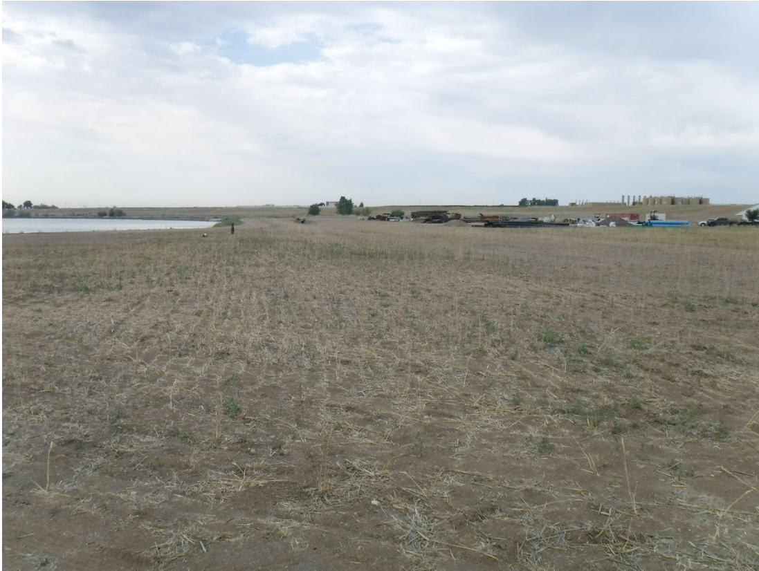
Photo 5: Portion of the approved laydown area seeded by landowner (this area was approved for base course covering but the landowner decided to seed it instead)