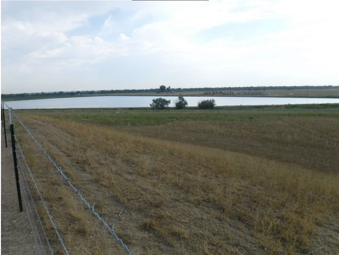
Photo 1: Looking north across the site from near the SW permit corner