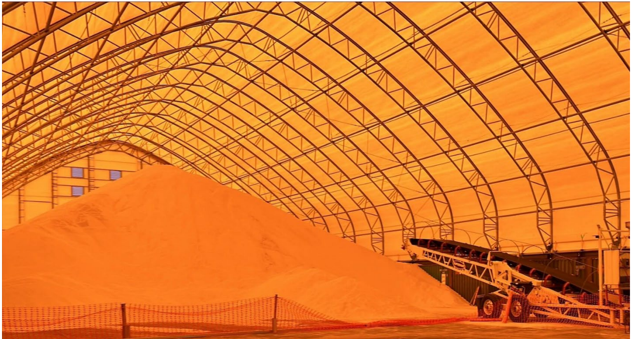
Figure 1: Frac sand in temporary building