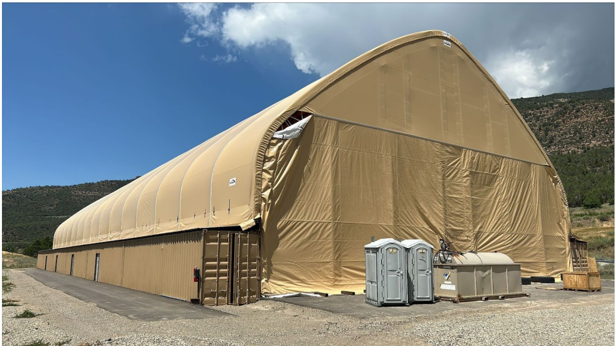
Figure 2: Temporary building

Number of Partial Inspection this Fiscal Year: 1