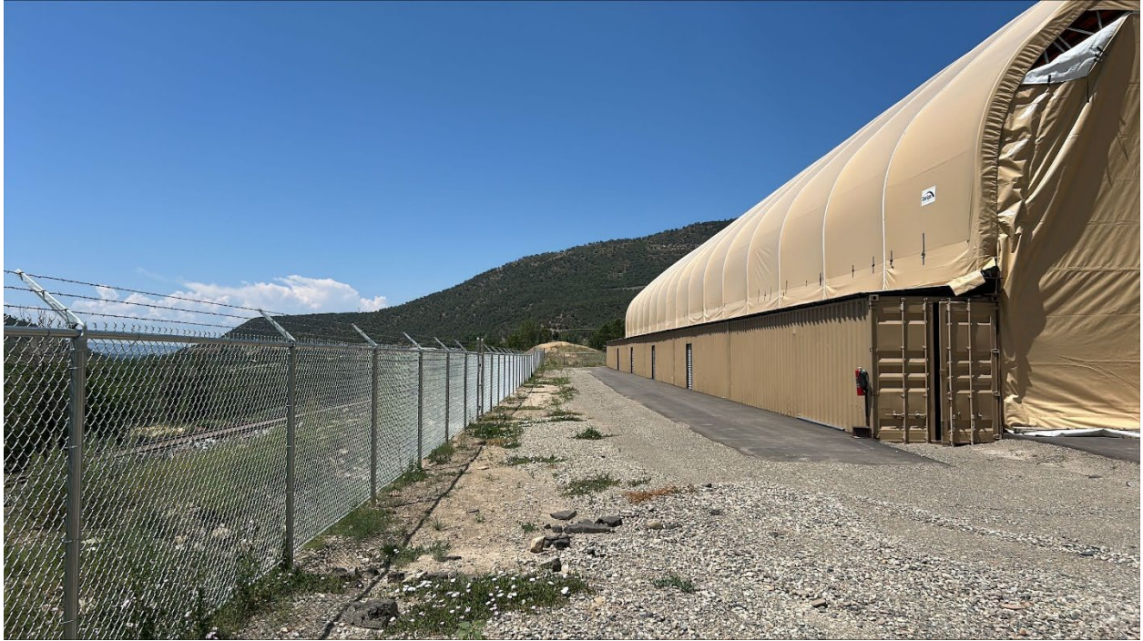
Figure 3: Security fence

Number of Partial Inspection this Fiscal Year: 1