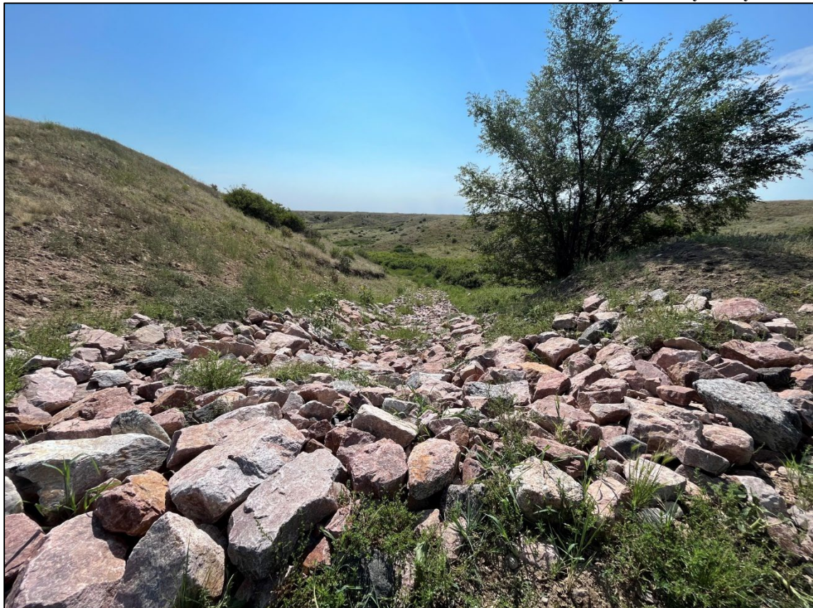
Photo 4: Rip rapped drainage channel on the eastern side of the site.