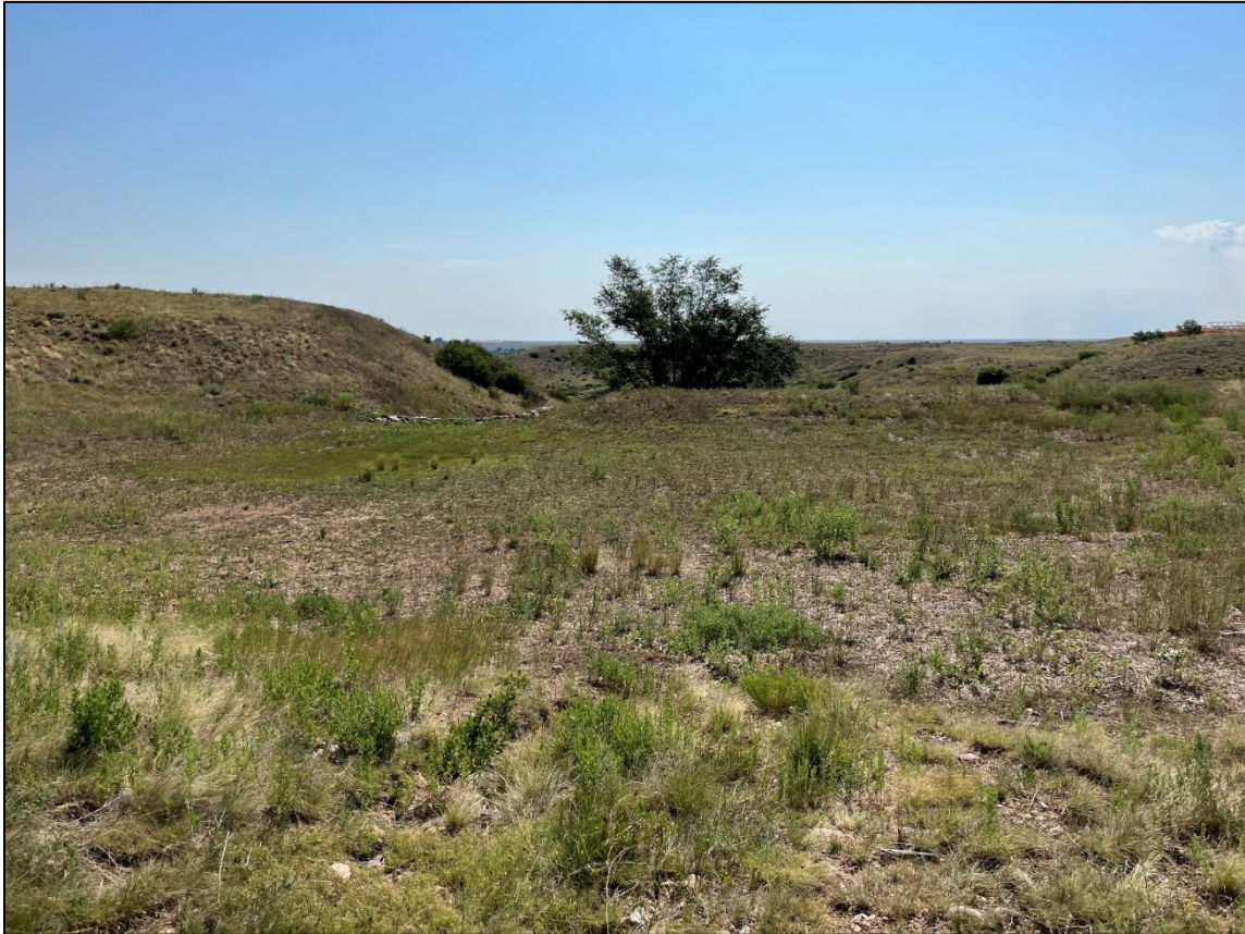
Photo 3: View east of the 0.5 acres disturbance and berm which was blown out in a previous year by a storm event.