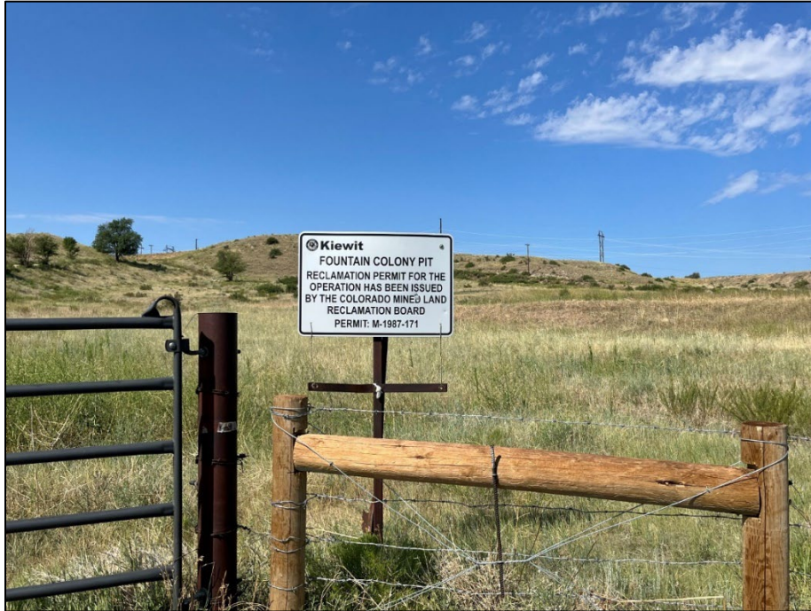
Photo 1: Mine identification sign located at the entrance to the access road off Charter oak Ranch Road.