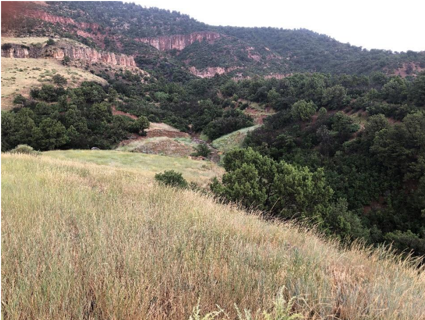
Reclaimed Ponds 1 and 2 at East Mine

Number of Partial Inspection this Fiscal Year: 1