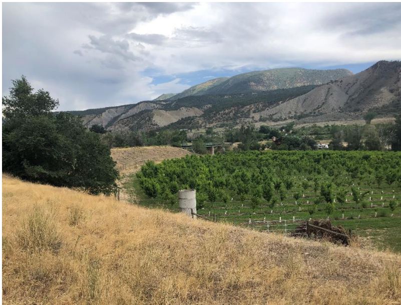
Loadout with bridge at east end (center of photo)

Number of Partial Inspection this Fiscal Year: 1