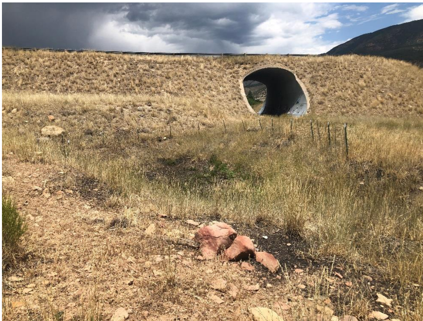
Pond at Coal Storage Area near Black Bridge Road

Number of Partial Inspection this Fiscal Year: 1