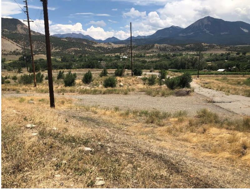
West side of loadout