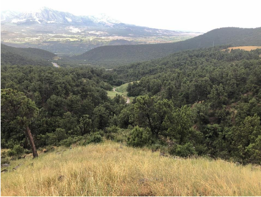
Reclaimed Ponds 3 and 4 at East Mine