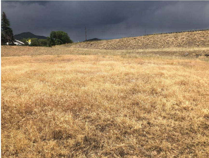
Cheat grass at Coal Storage Area near Black Bridge Road