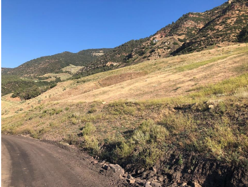
Gob Piles 1 and 4