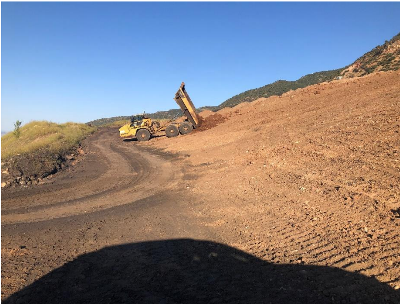
Gob Pile #2 – dumping coverfill on upper slope

Number of Partial Inspection this Fiscal Year: 1