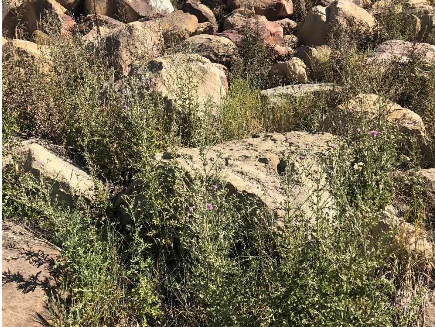
Knapweed at Curve 8