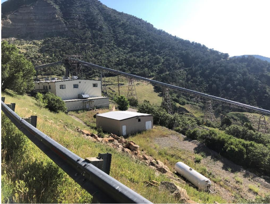
D Portal Bench – structures at southwest corner