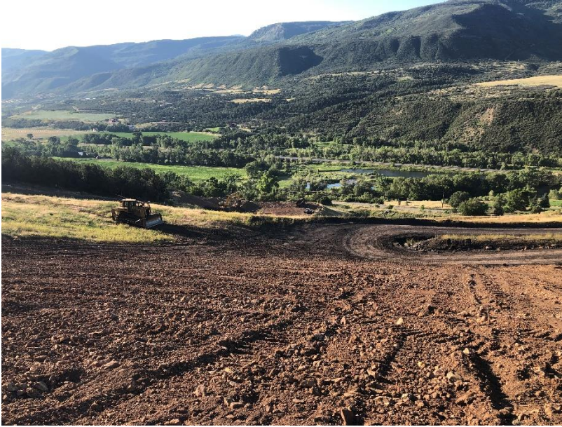
Gob Pile #2 – source of material is in middle of photo