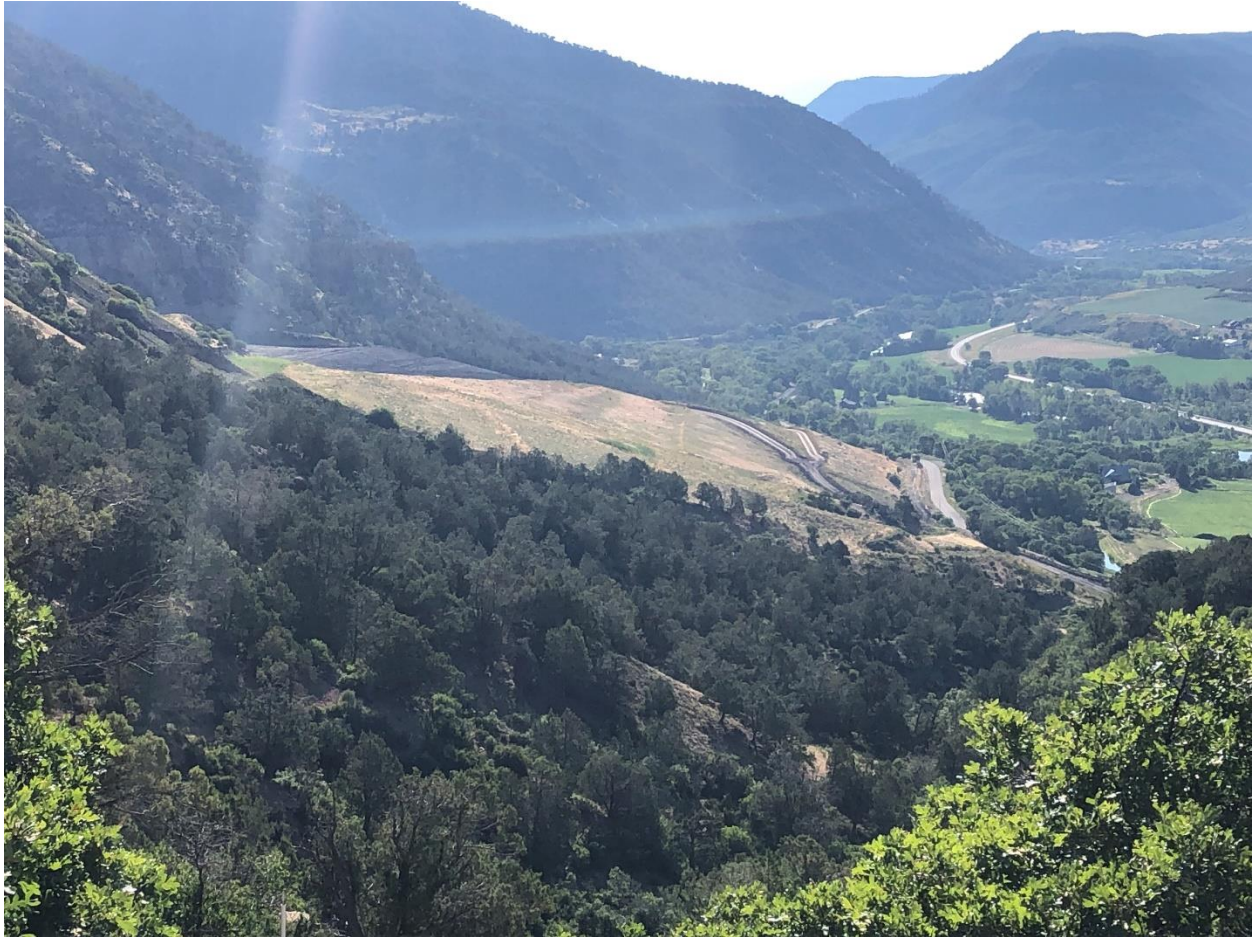
Gob Piles 1, 2, and 4, from upper Haul Road

Number of Partial Inspection this Fiscal Year: 1