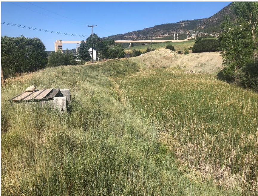
Pond J with vegetation removed from inner bank

Number of Partial Inspection this Fiscal Year: 1