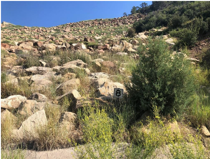
Knapweed at Curve 8

Number of Partial Inspection this Fiscal Year: 1