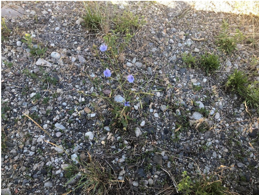
Chicory plant in parking lot next to parking by office on D Portal Bench

Number of Partial Inspection this Fiscal Year: 1